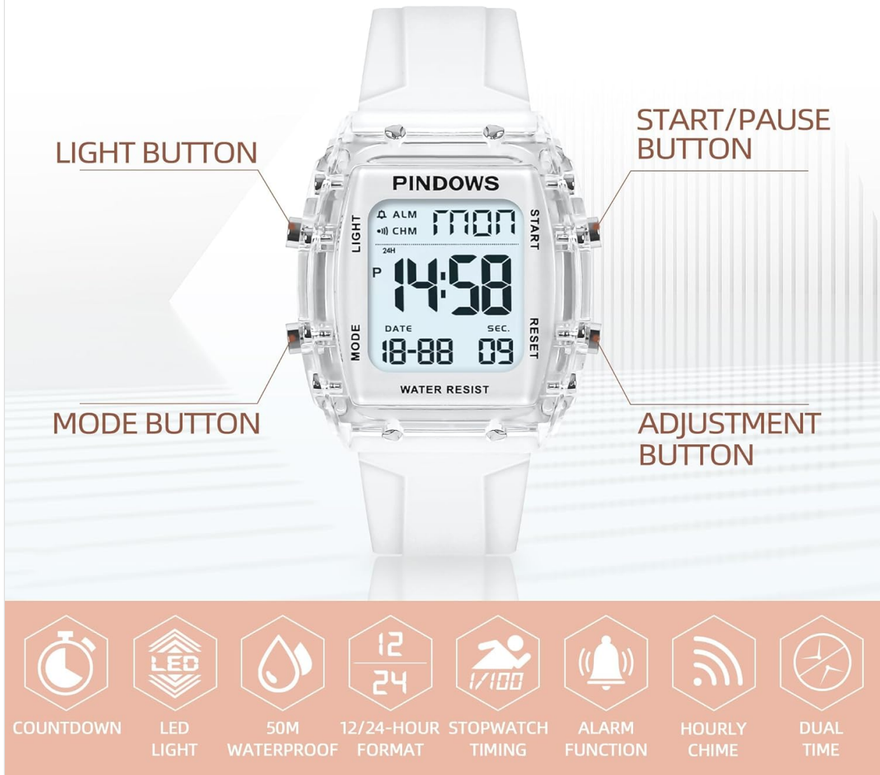
Figure 2: Functional Overview and Button Layout