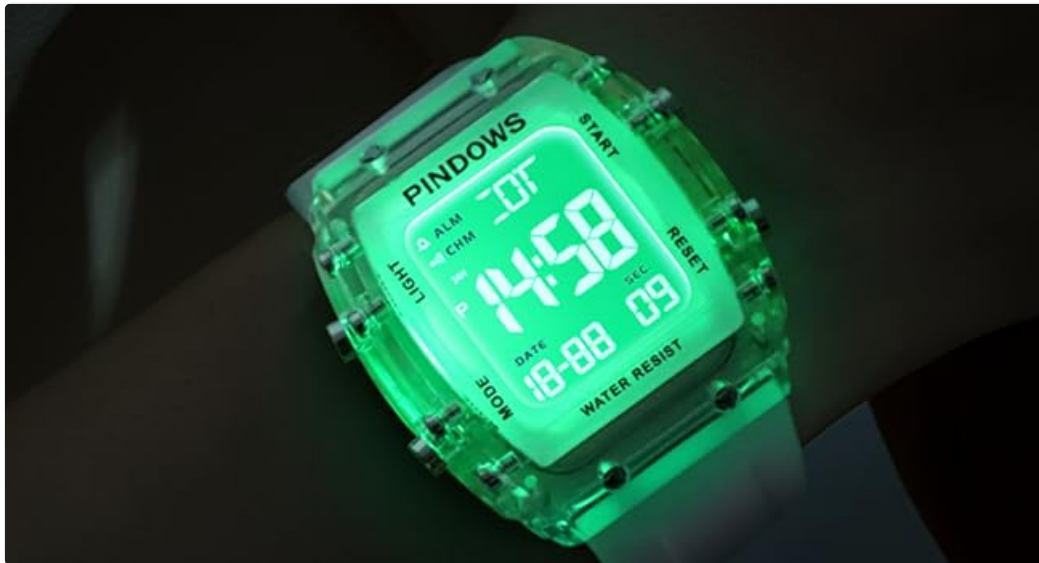
Figure 3: LED Backlight in action

Press the LIGHT button (top left) to illuminate the display. The backlight will remain on for a few seconds.