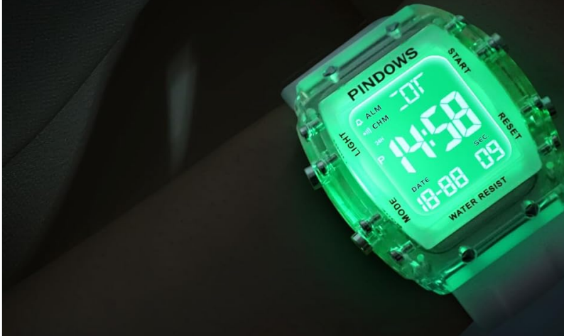
Figure 1: PINDOWS Digital Sport Watch PDS-8021

combined with a transparent case, can easily illuminate the watch