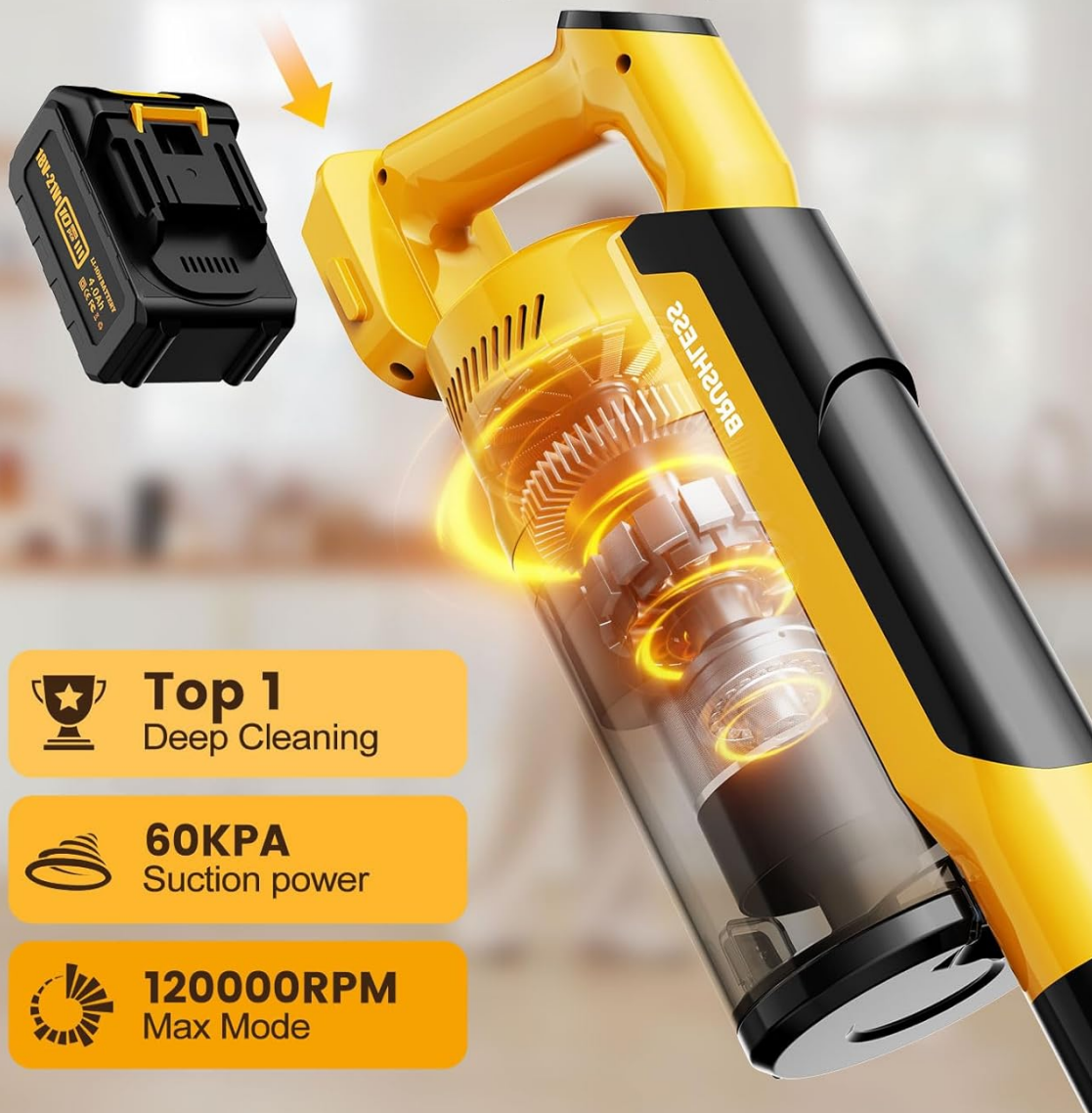
Image: qimedo V1 Cordless Vacuum Cleaner highlighting its removable battery, 60KPA suction power, and 12000RPM Max Mode.

The removable battery design means you don't have to worry about battery life.