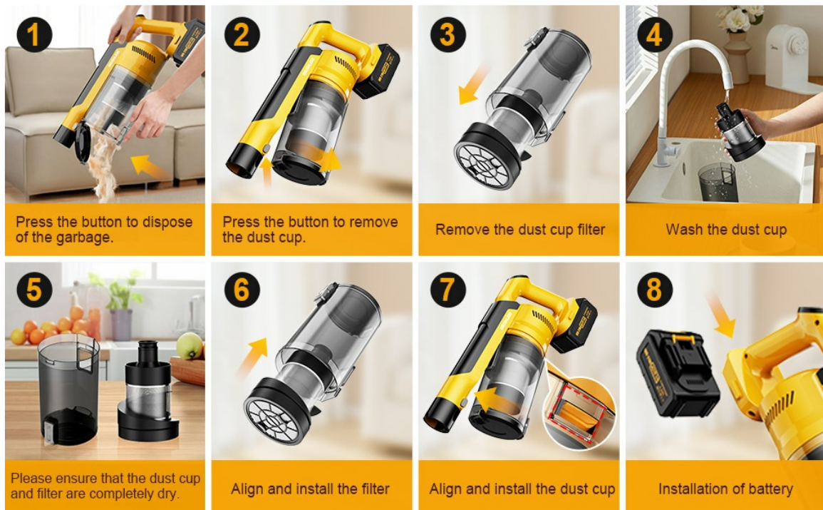
Image: A step-by-step visual guide on how to empty and clean the dust cup and filter of the qimedo V1 Cordless Vacuum Cleaner.

The 800 ml dust cup is designed for easy emptying. Simply press the release button to open the bottom flap and dispose of collected debris directly into a trash bin. The large capacity minimizes frequent emptying.