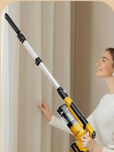
Extended Crevice Nozzle