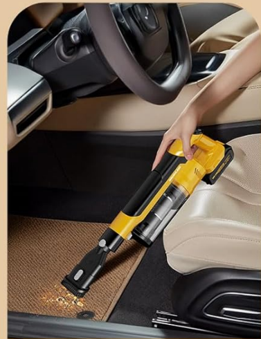
Crevice Nozzle Brush

Image: The qimedo V1 Cordless Vacuum Cleaner stored on its wall-mounted charging station, with accessories neatly organized.