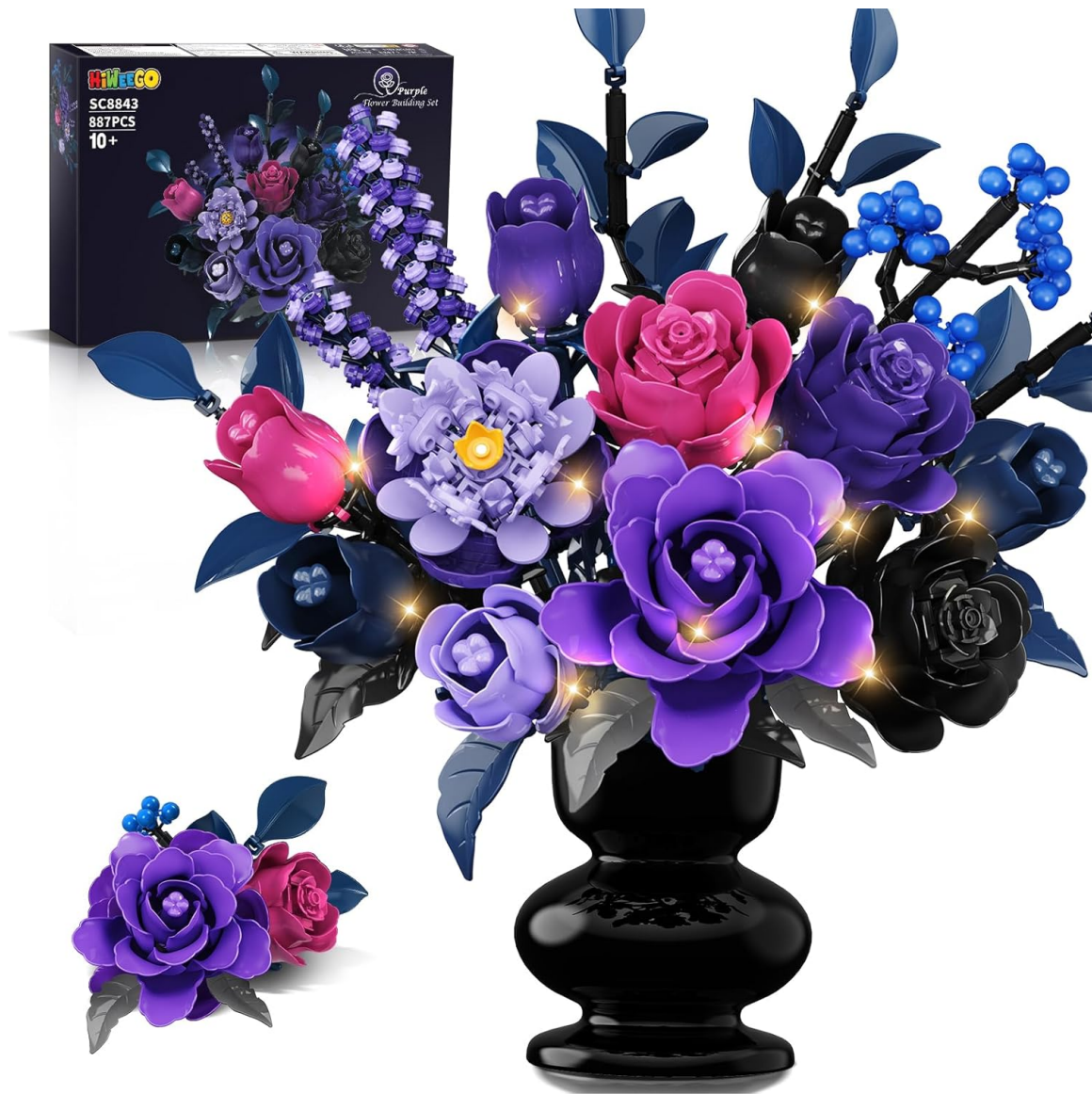
The complete HiWEEGO SC8843 Flowers Bouquet Building Set, featuring the assembled bouquet with LED lights and the product packaging.