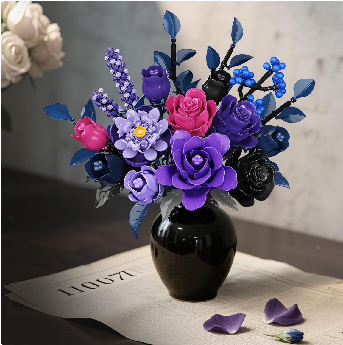
A close-up view of the HiWEEGO SC8843 Flowers Bouquet in a vase, emphasizing its detailed design and decorative placement.