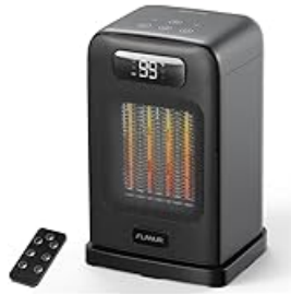
Figure 4: Top Control Panel