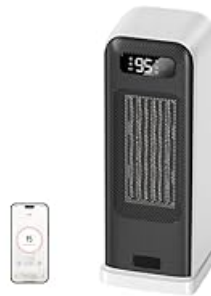
Figure 5: LED Display Indicators

The LED display shows the current temperature, selected mode (High, Low, ECO, Cool Air), and timer settings. The touch buttons on the top panel allow for direct control of all functions.