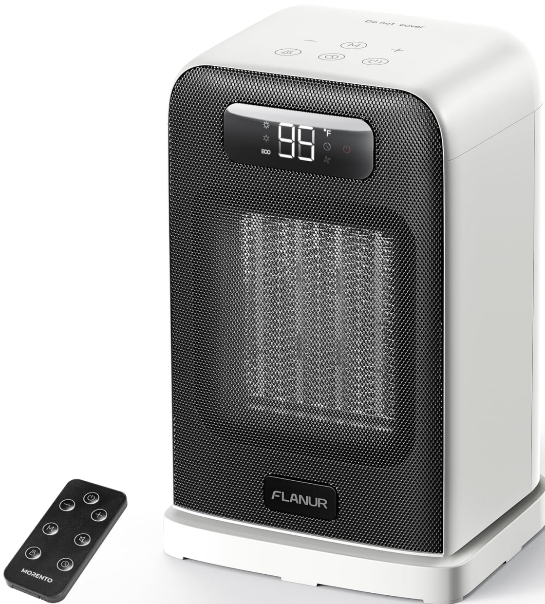
Figure 1: FLANUR Space Heater SH26 and Remote Control