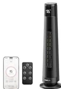
Figure 6: Remote Control

The multifunctional remote control provides convenient access to all heater settings from a distance, including power, temperature, timer, oscillation, and quiet function.