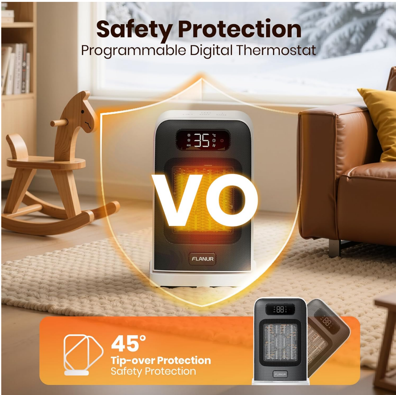
Figure 2: Safety Protection Features (Tip-Over and Overheat)