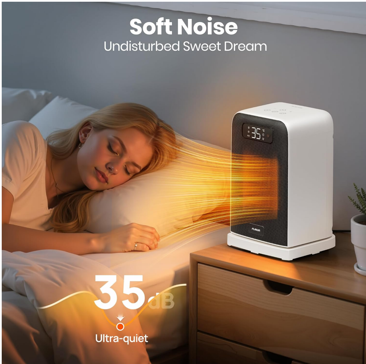
Figure 10: Ultra-Quiet Operation (Below 35dB)

The heater operates at an ultra-quiet level (below 35 decibels), ensuring minimal disturbance during sleep or work. This feature is inherent to its design.