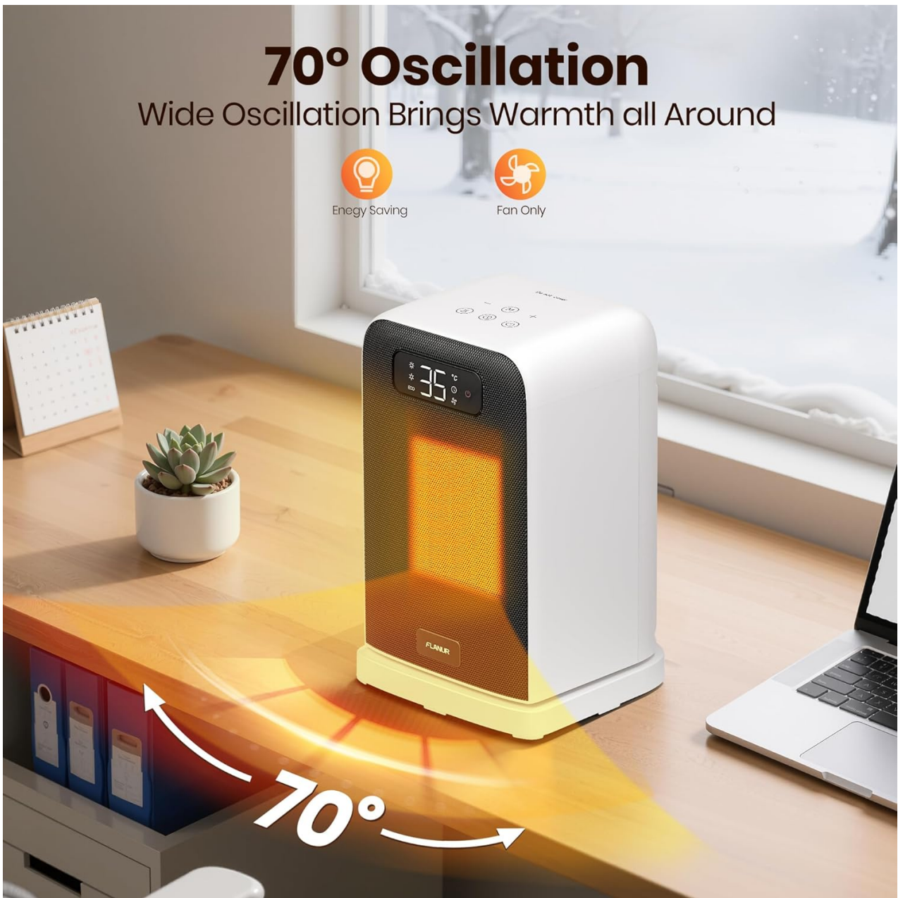
Figure 8: 70° Wide Angle Oscillation