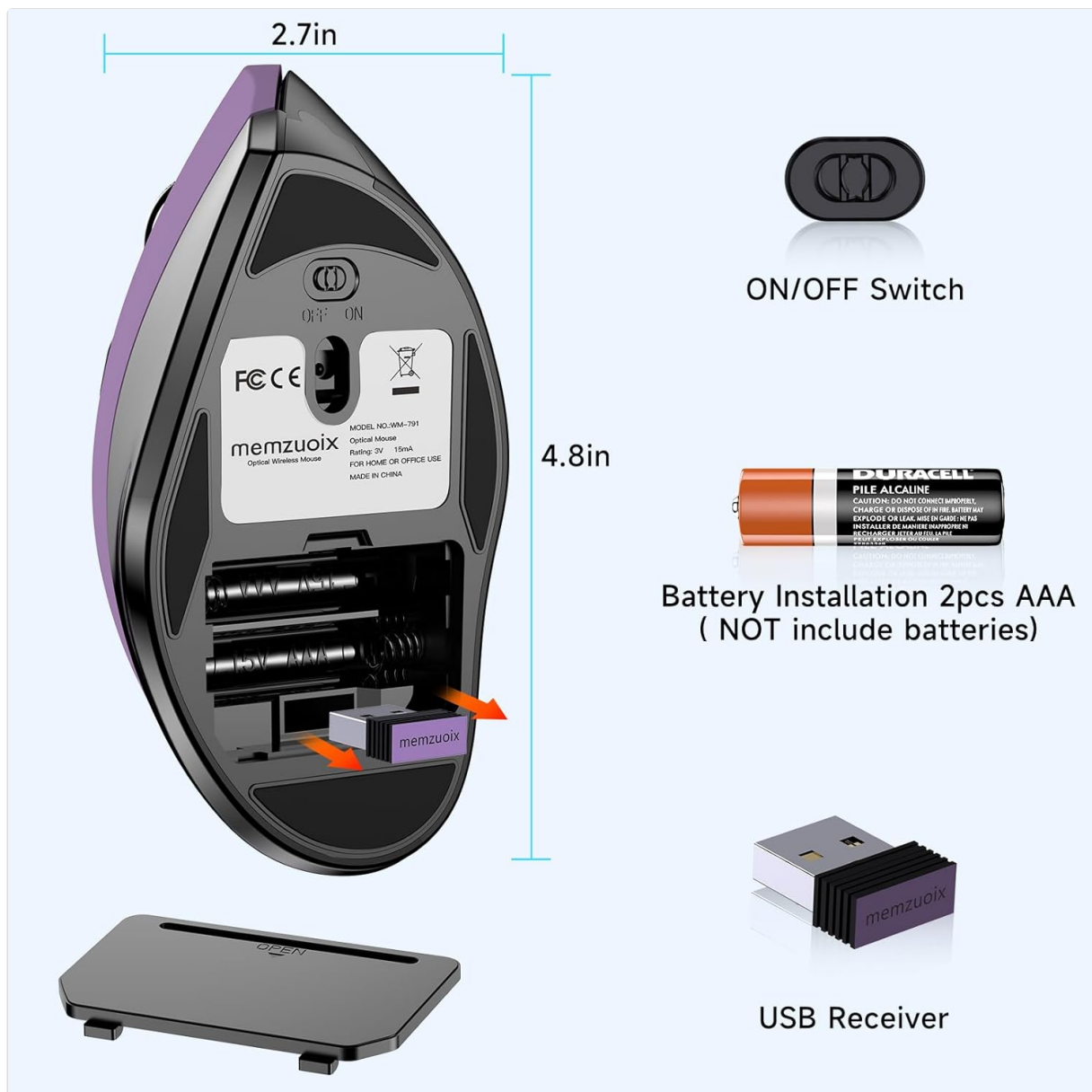
Image: The underside of the mouse with the battery compartment open, illustrating where to insert two AAA batteries and the location of the USB receiver storage.