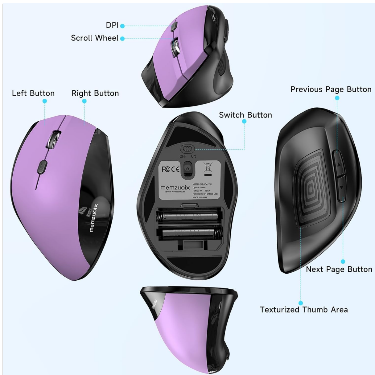
Image: Multiple views of the memzuoix vertical mouse, highlighting the DPI button, scroll wheel, left and right click buttons, previous and next page buttons, and the textured thumb area for grip.