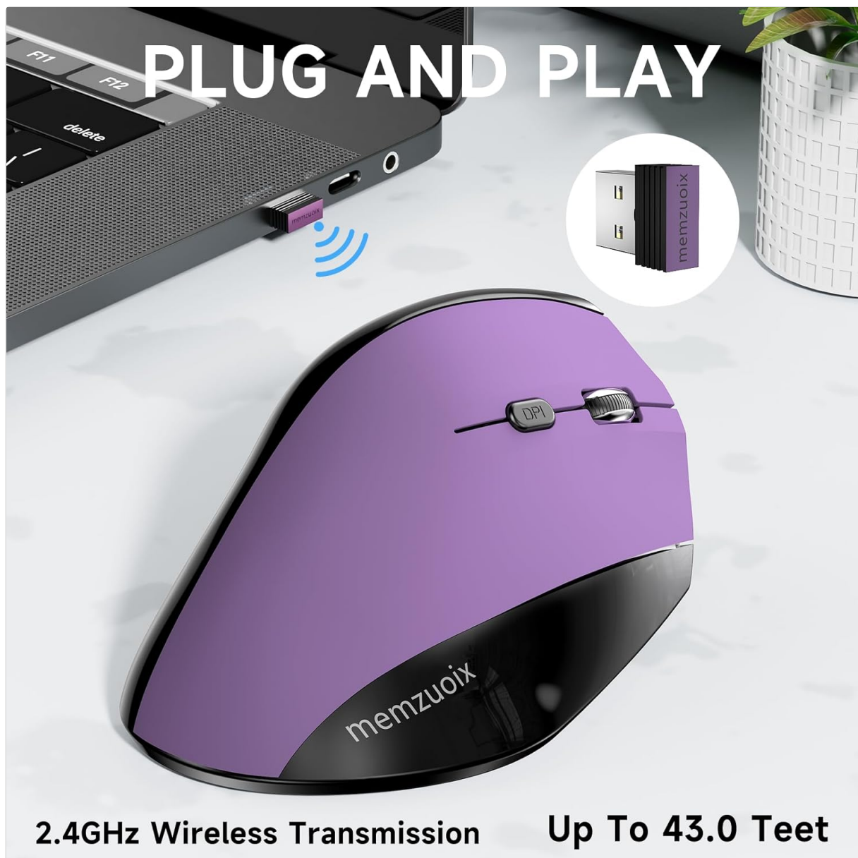
Image: The memzuoix vertical mouse positioned next to a laptop, with its USB receiver clearly shown plugged into a USB port, demonstrating the plug-and-play setup.