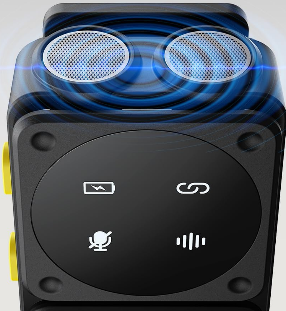
Figure 4: Intelligent Noise Cancelling for optimized sound.