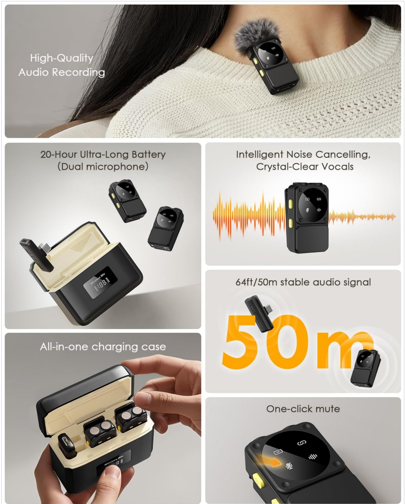
Figure 5: High-Quality Audio Recording with discreet placement.