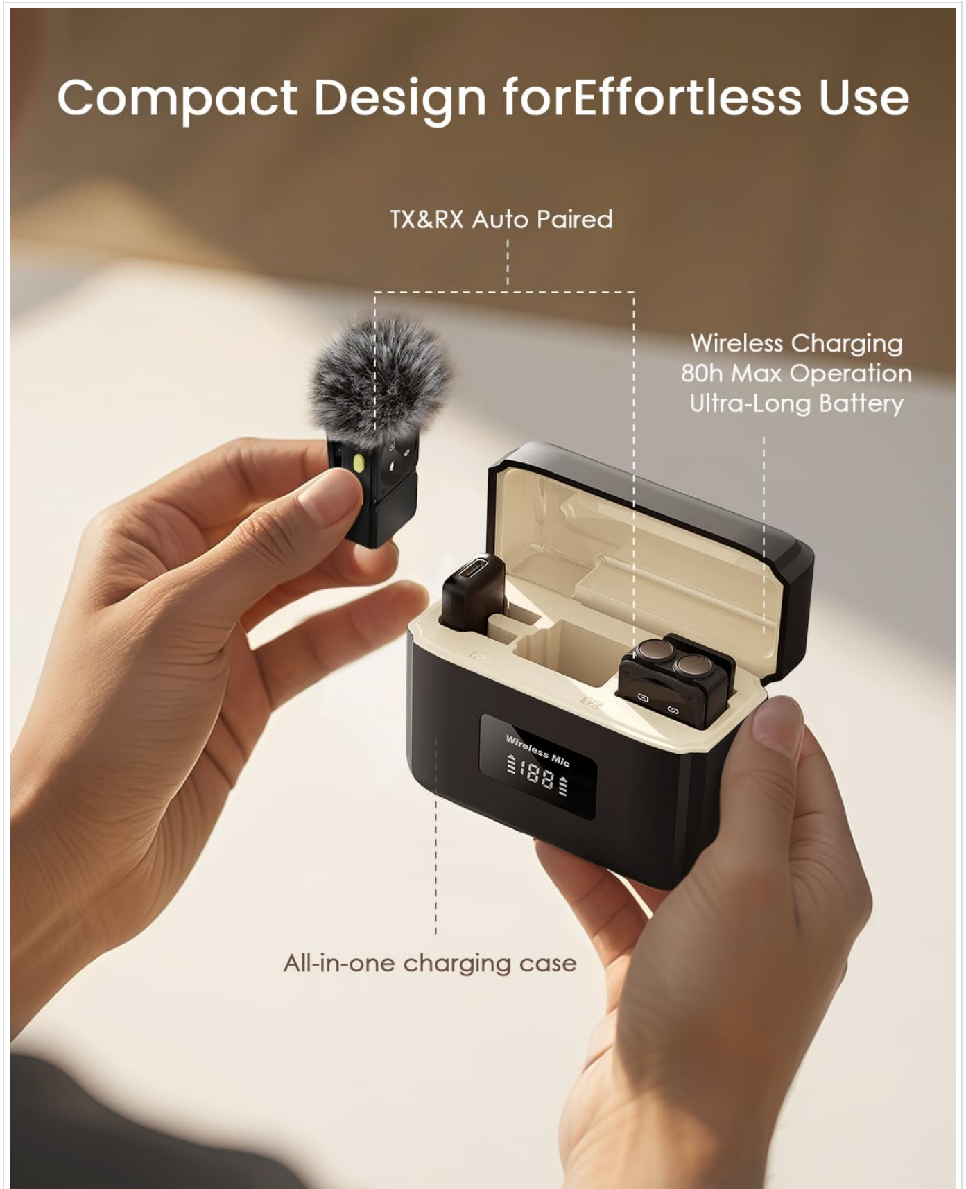
Figure 2: The compact charging case and auto-pairing feature for effortless setup.

Important Note: For optimal connection and audio quality, it is recommended to remove your device's protective case if it is thick, or use a thinner case, to ensure the receiver can be fully and securely connected to the phone's port.