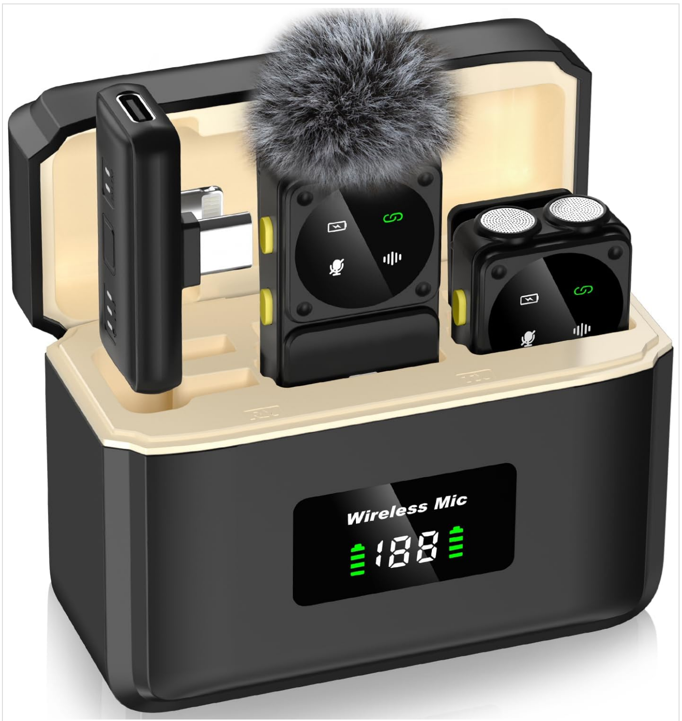
Figure 1: All components included in the PQRQP J26 Wireless Microphone package.