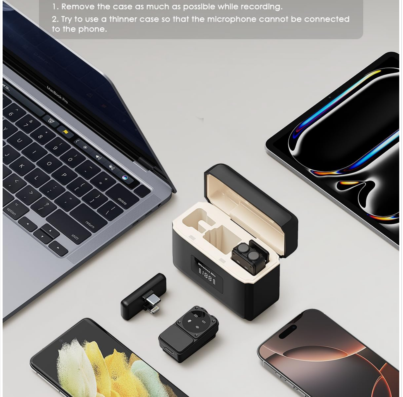
Figure 3: Demonstrating wide compatibility with USB-C and Lightning interfaces.