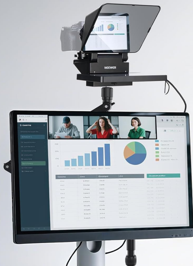
Image 4.2: Teleprompter functioning as an extended computer display.

Click (not scroll) the mirroring button on side to mirror the screen.