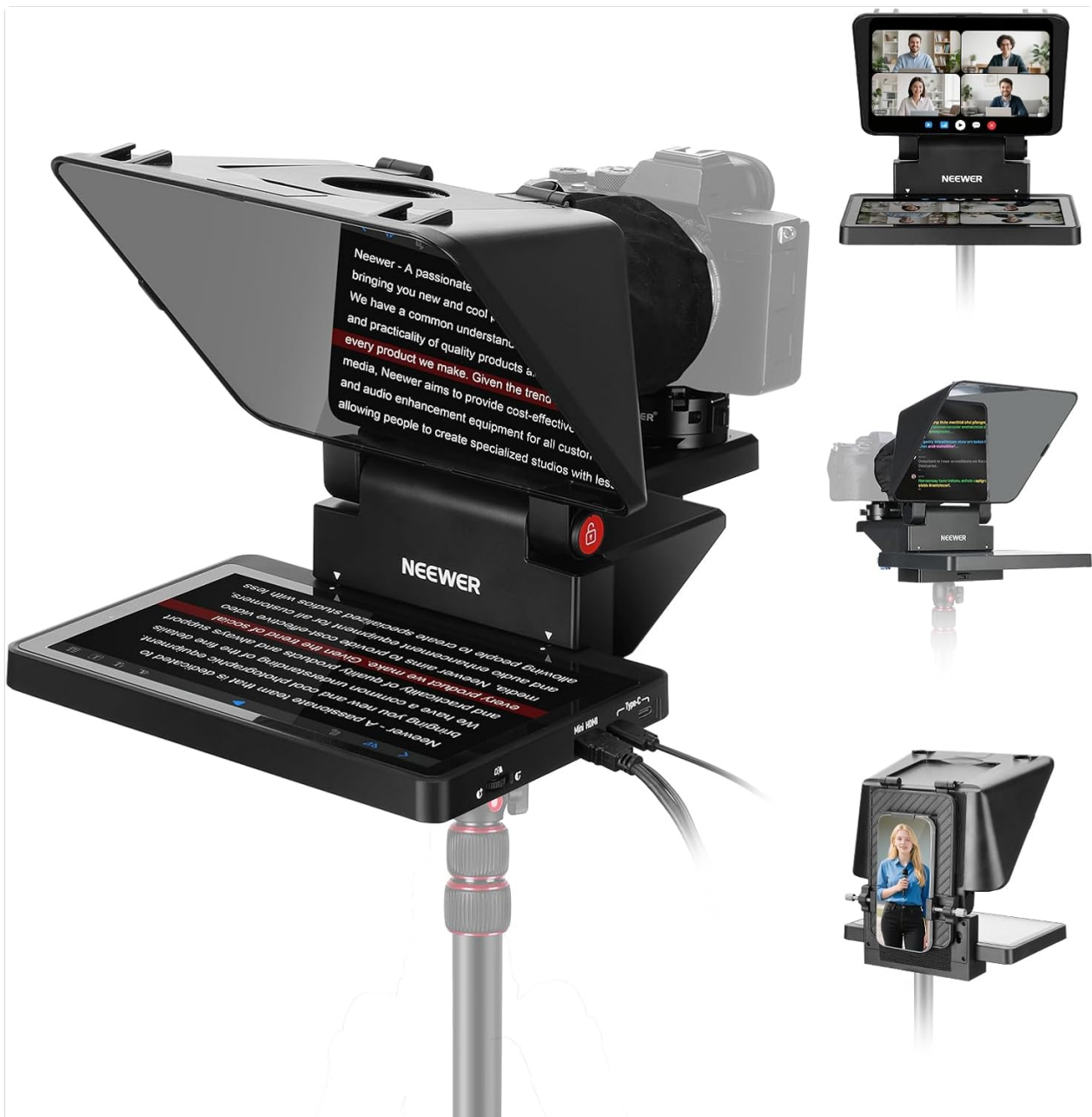
Image 1.1: NEEWER X11+TM8 Teleprompter showing different usage scenarios.