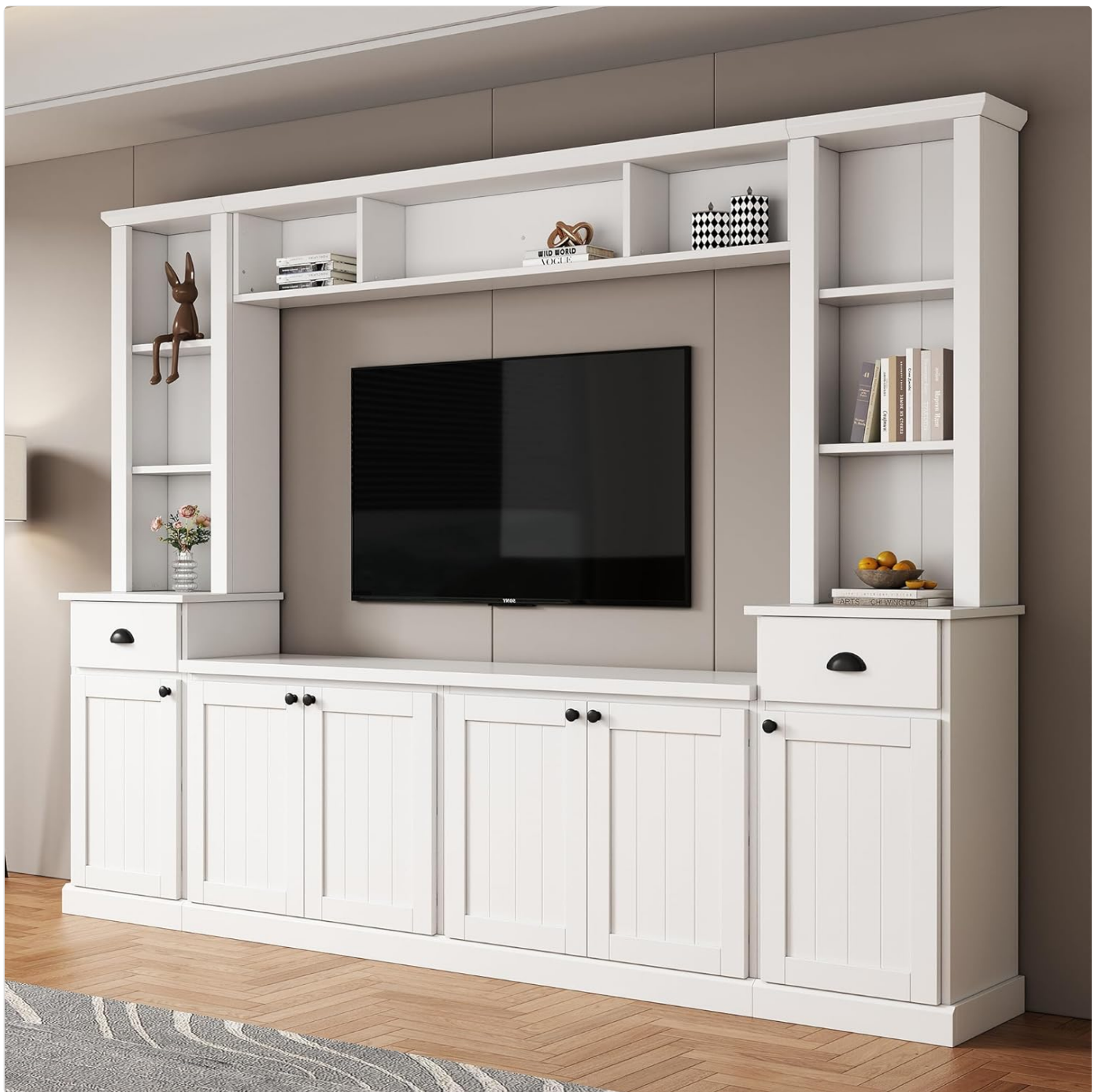
Figure 1.1: Fully assembled Merax Modern TV Stand Set in white, showcasing its integrated design with a television, books, and decorative items.

The set features a sleek modern design with clean lines, black handles, and vertical striped door panels, enhancing its aesthetic appeal. Constructed from heavy-duty particle board, it includes steel anti-dumping brackets for enhanced stability and safety.