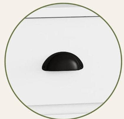
Figure 4.1: Details on the stable and durable construction, including particle board material, quality hardware, and the anti-dumping device

The addition of black handles and vertical stripe design on the door panels add a refined feeling,