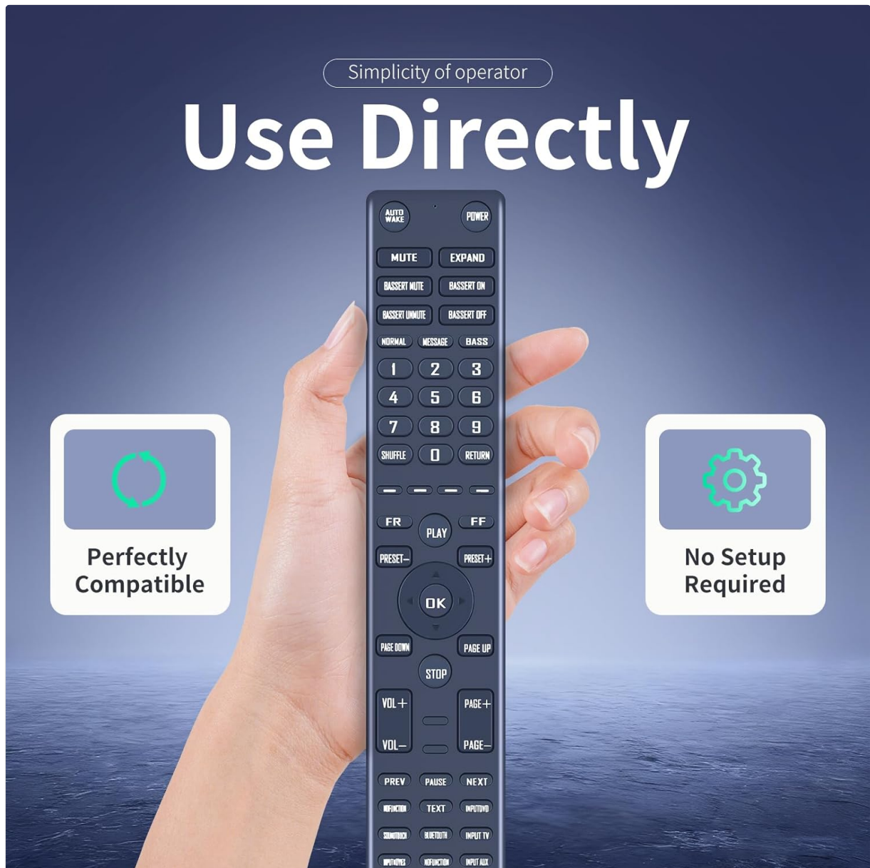
Figure 4: The remote control is ready for direct use without any setup.

The remote is designed for multi-angle induction, allowing effective control from various positions within a range of approximately 26 feet (8 meters).