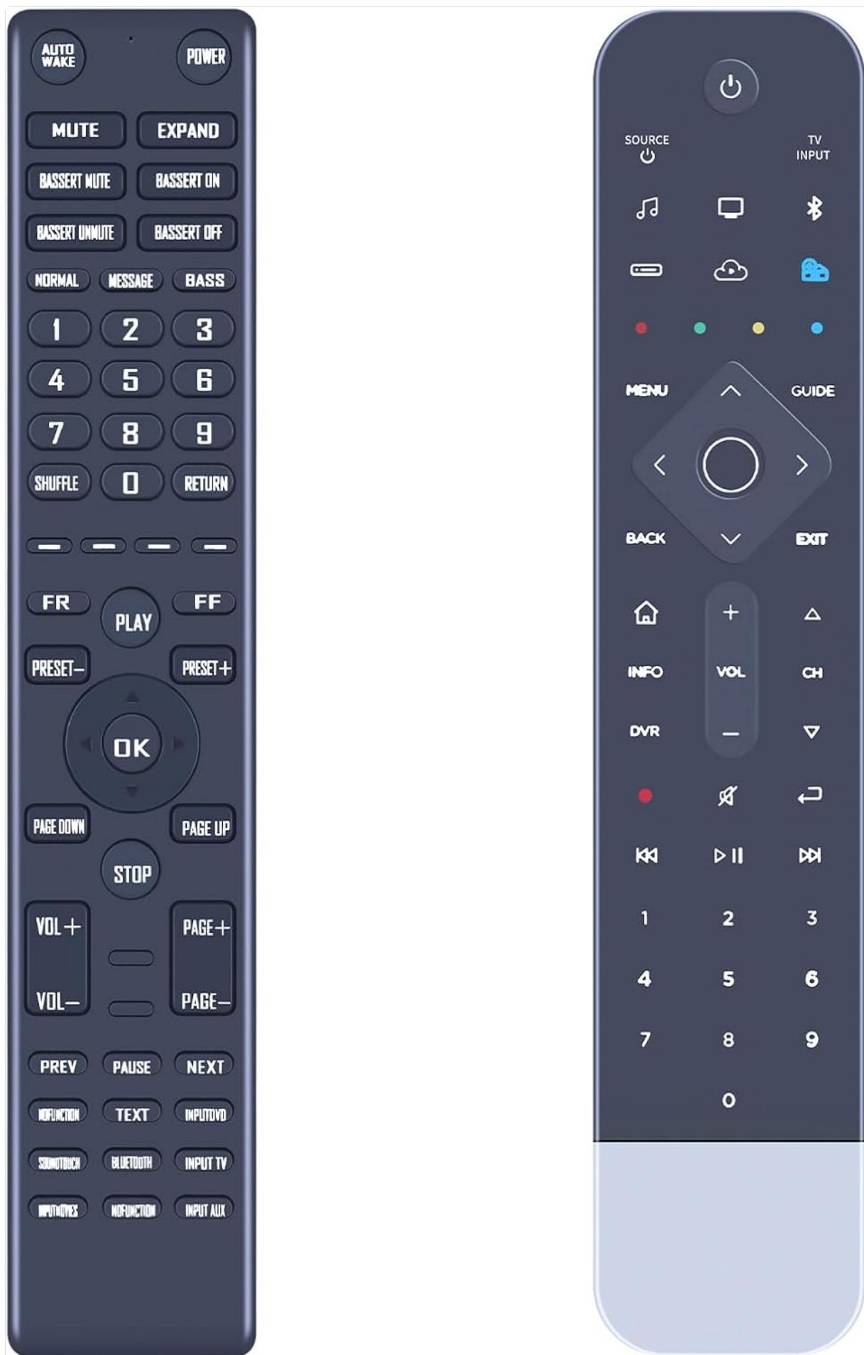
Figure 1: Front view of the ZWP Replacement Remote Control.