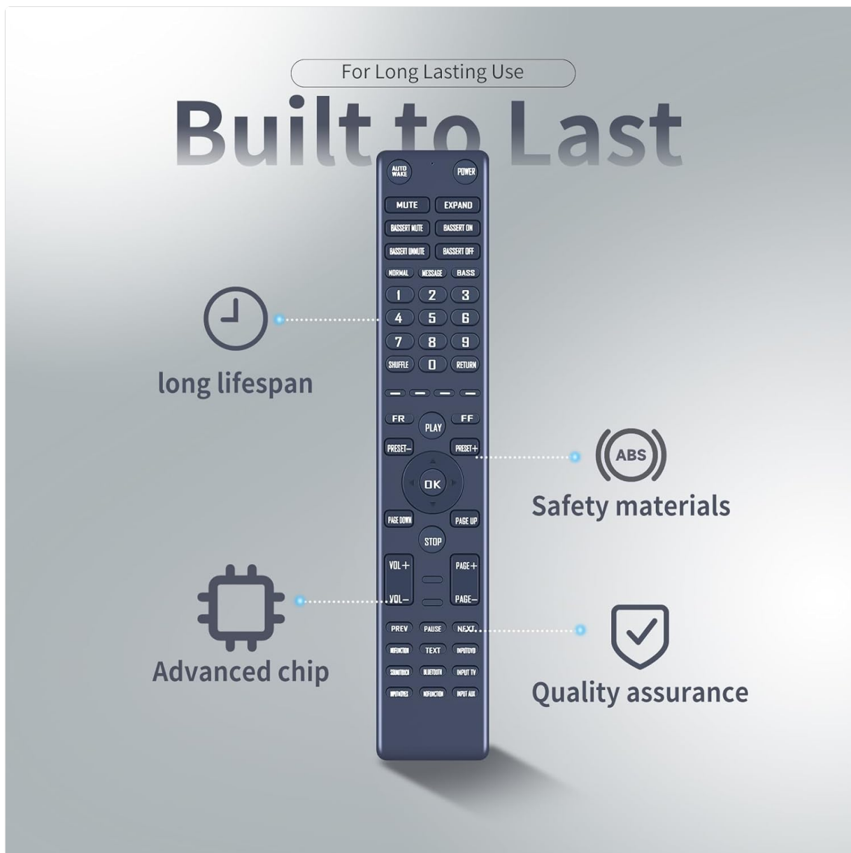
Figure 6: The remote is built with quality materials and an advanced chip for a long lifespan.