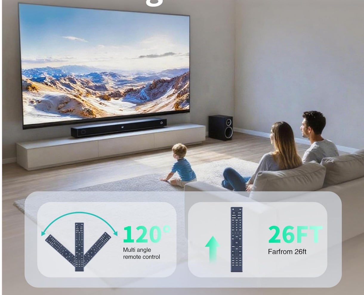
Figure 5: The remote supports multi-angle operation up to 120 degrees and has an effective range of approximately 26 feet.