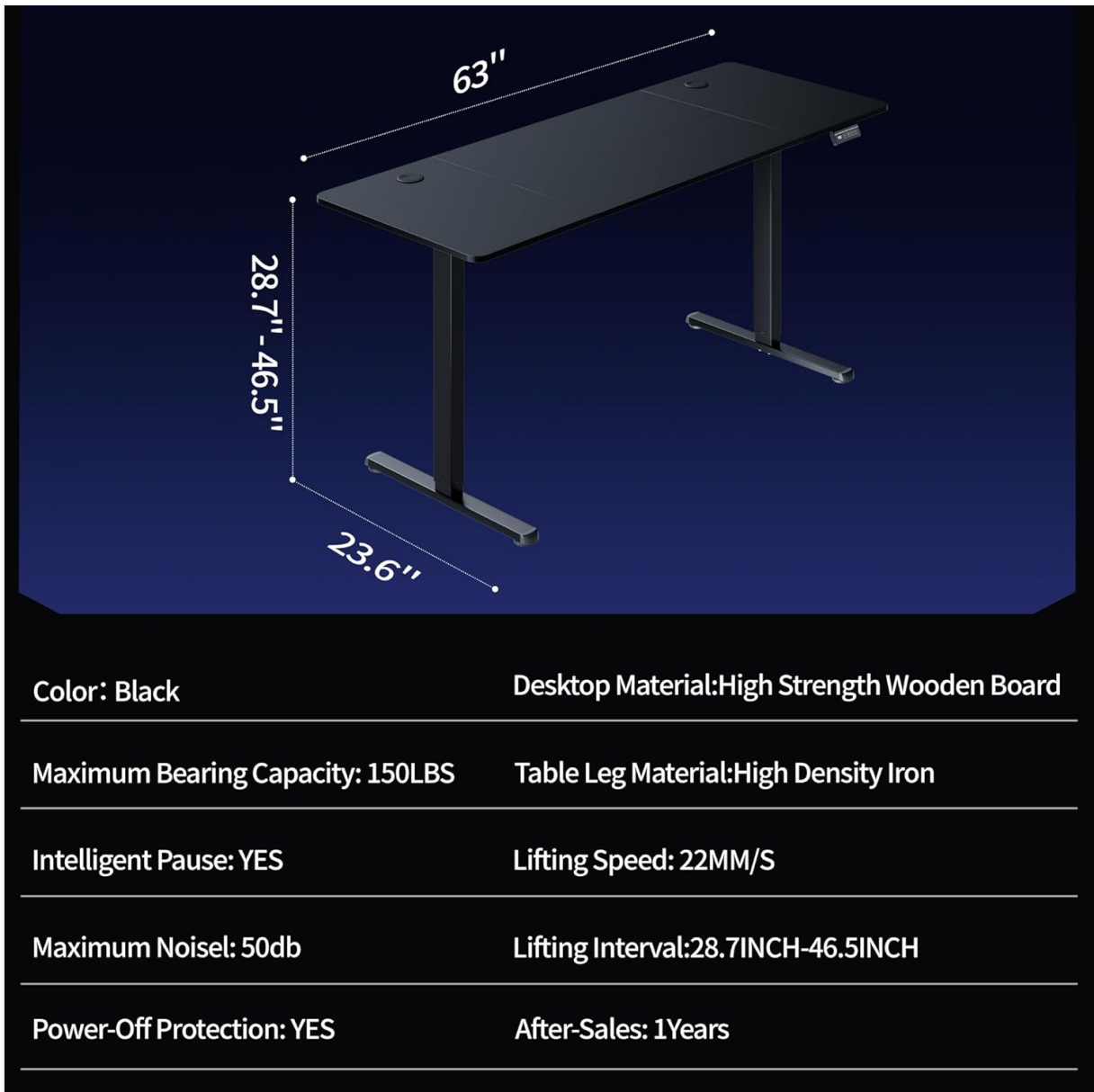
Figure 5: Desk dimensions and adjustable height range.