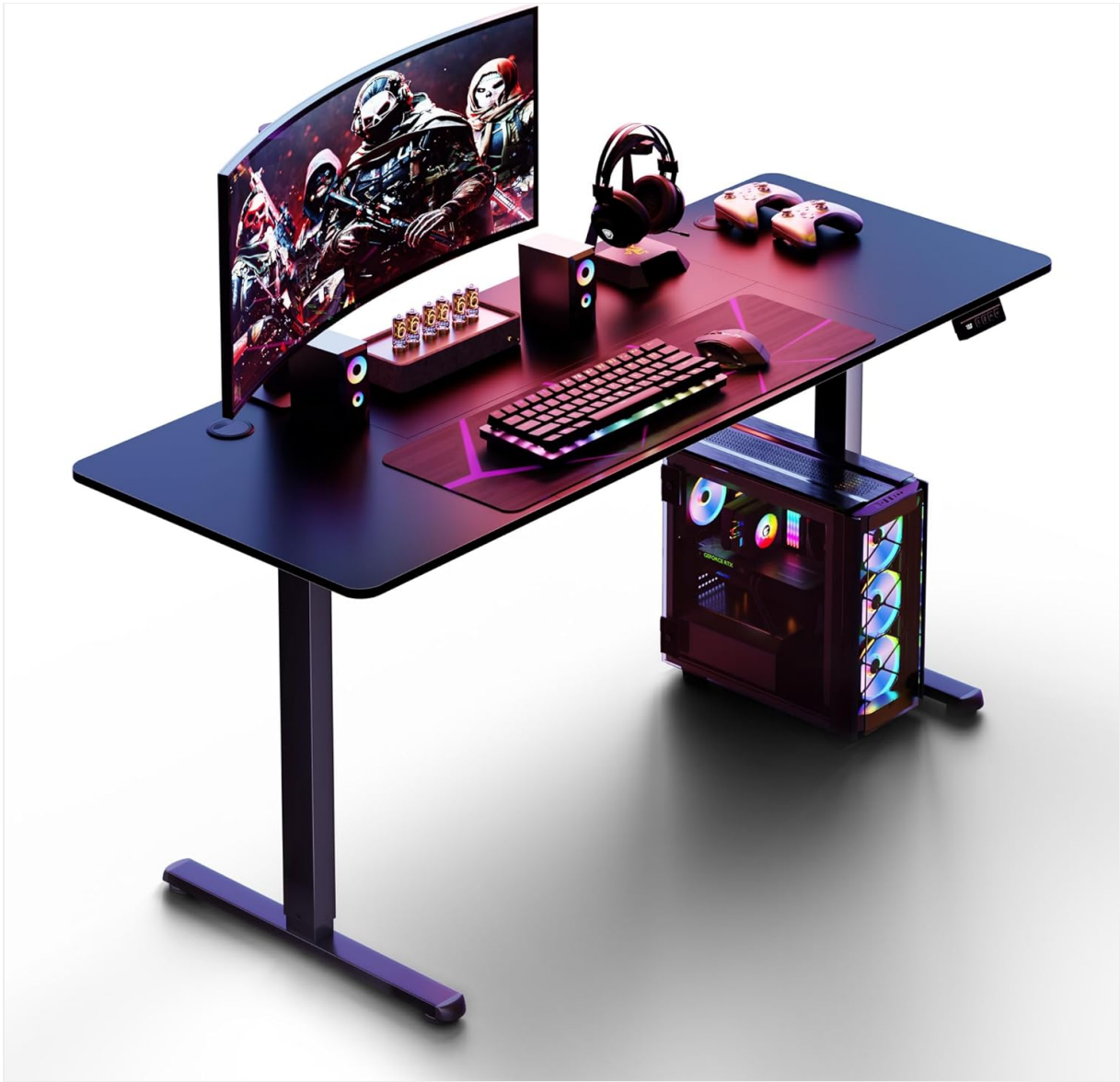
Figure 1: Shintenchi Standing Desk with a typical workstation setup.