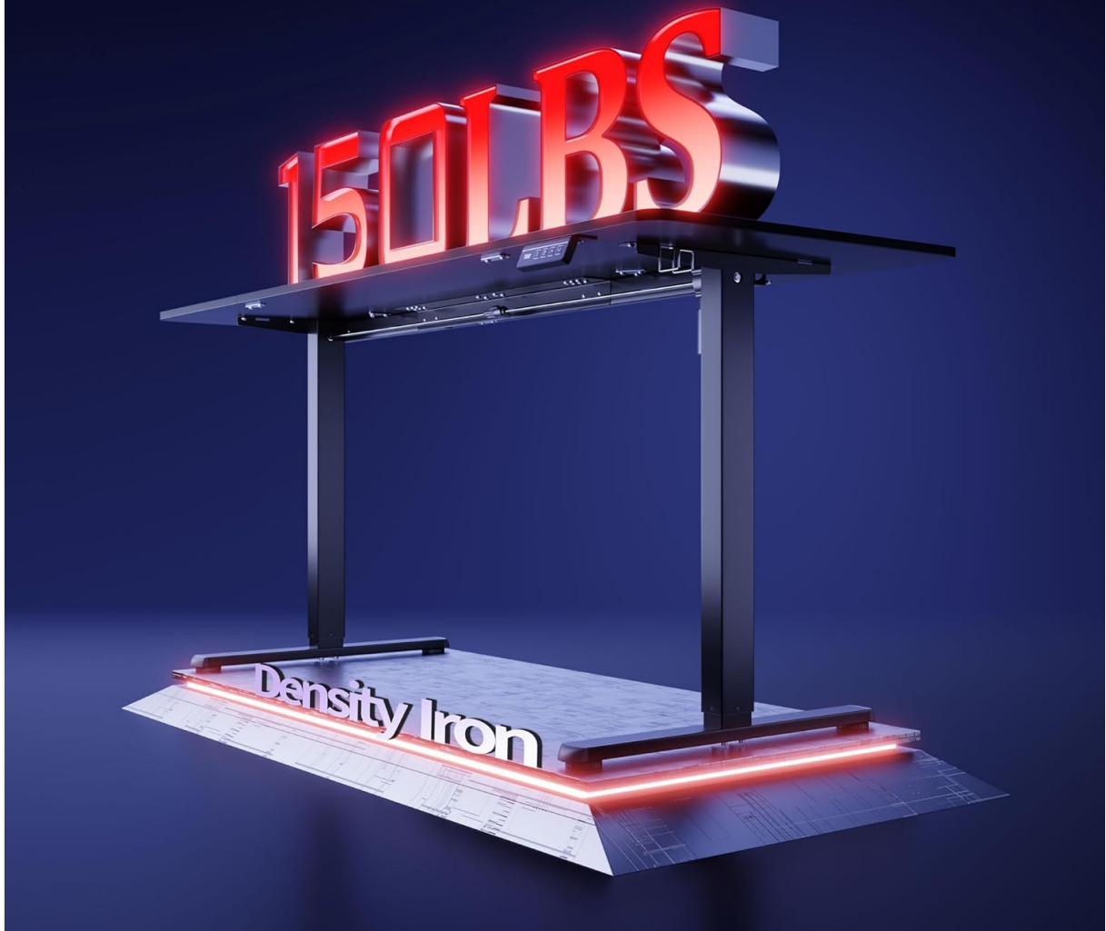
Figure 2: Side view illustrating the desk's structural components.