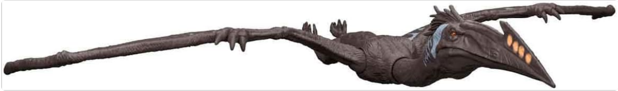
Image 2.2: Side profile of the Quetzalcoatlus action figure, highlighting its elongated wings and body structure.

The figure features movable joints. Gently articulate the wings and legs to your desired pose. Avoid excessive force to prevent damage.