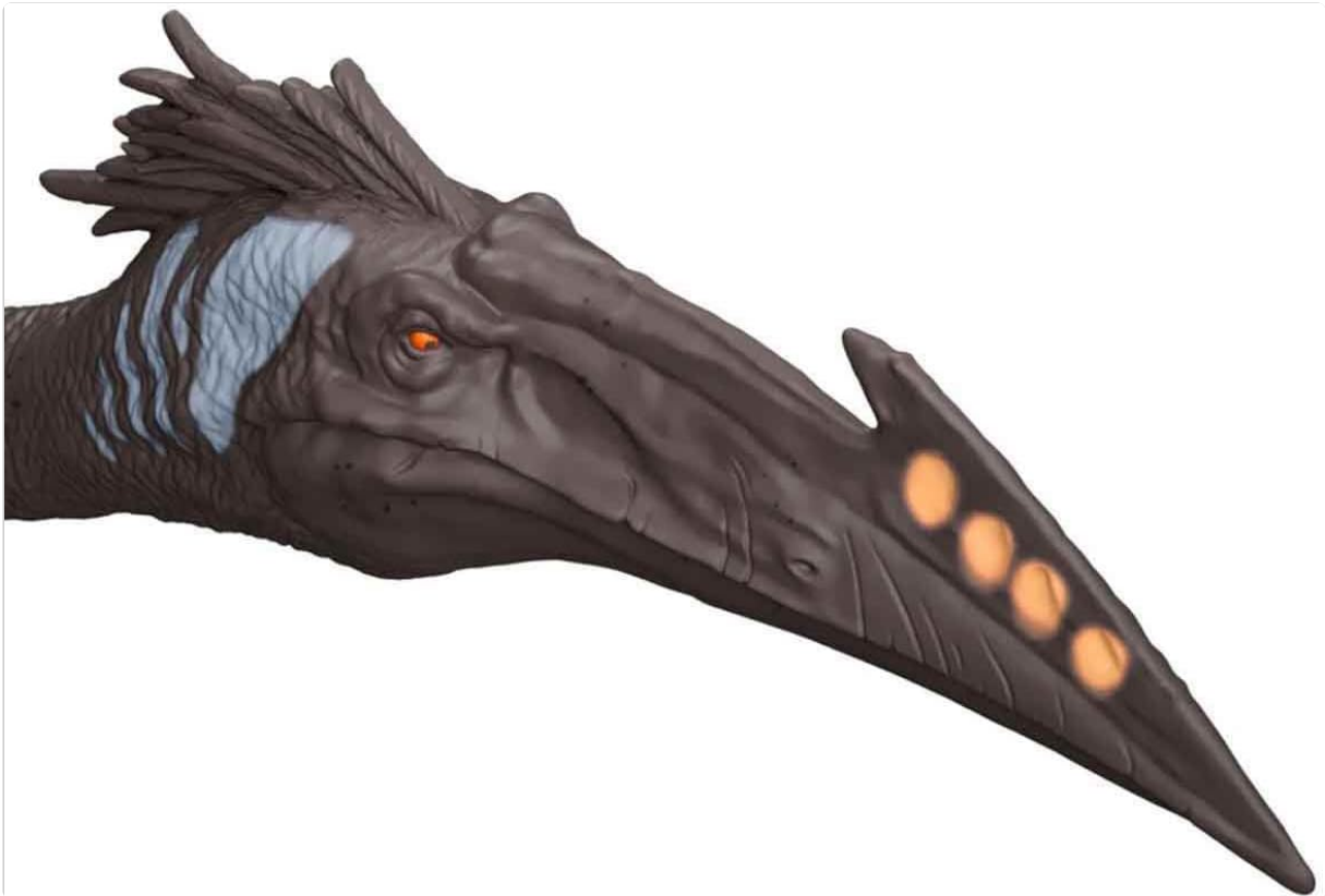
Image 3.1: A detailed close-up of the Quetzalcoatlus head, showing its distinctive beak and eye features, which can be slightly articulated.

Always move joints gently. Do not force movement beyond the natural range of motion to prevent breakage.