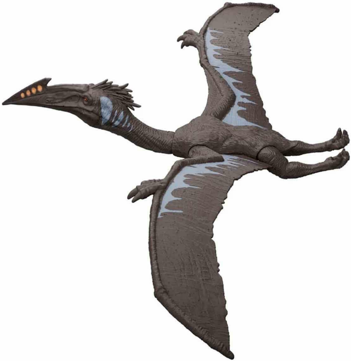
Image 1.1: The Jurassic World Rebirth Basic 12-inch Quetzalcoatlus Action Figure. This image shows the full figure with its wings extended, ready for display or play.