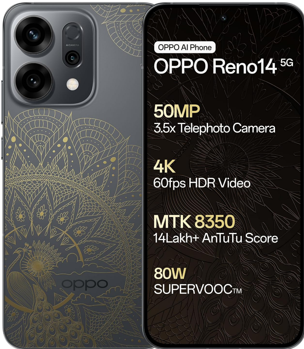
Image 1.1: Front and back view of the OPPO Reno14 5G, showcasing its design and primary specifications.