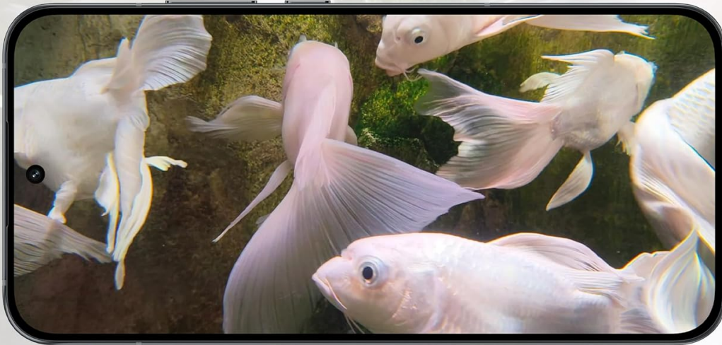
Image 4.1: The device demonstrating its water and dust resistance.