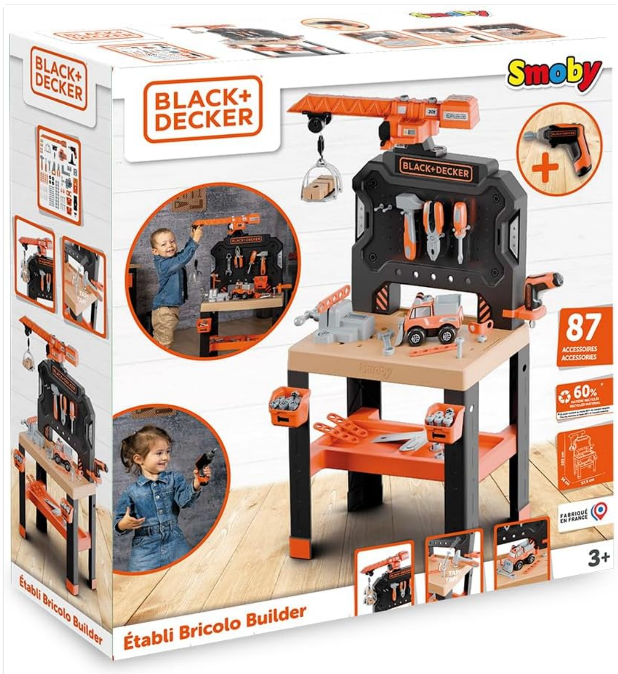
Image 4.1: A child demonstrating the use of the toy drill, an essential tool for construction play.