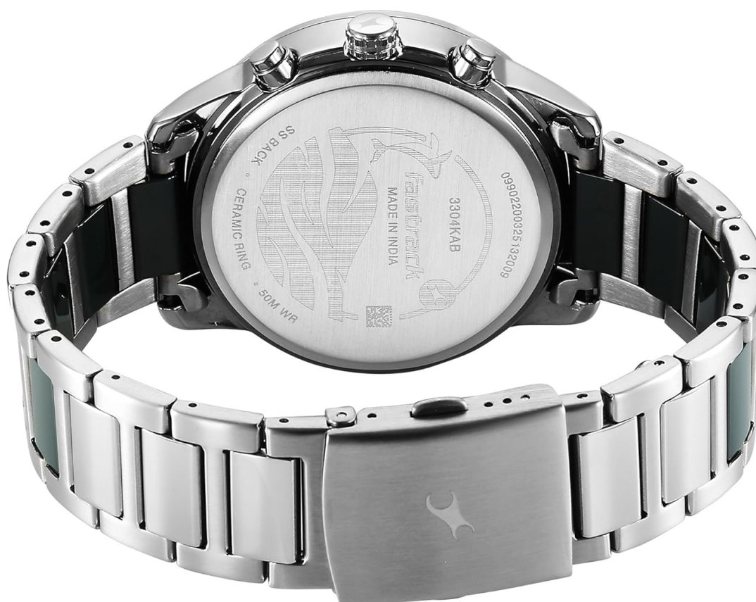
Image: Back view of the watch case, showing the "50M WR" (Water Resistant) marking.