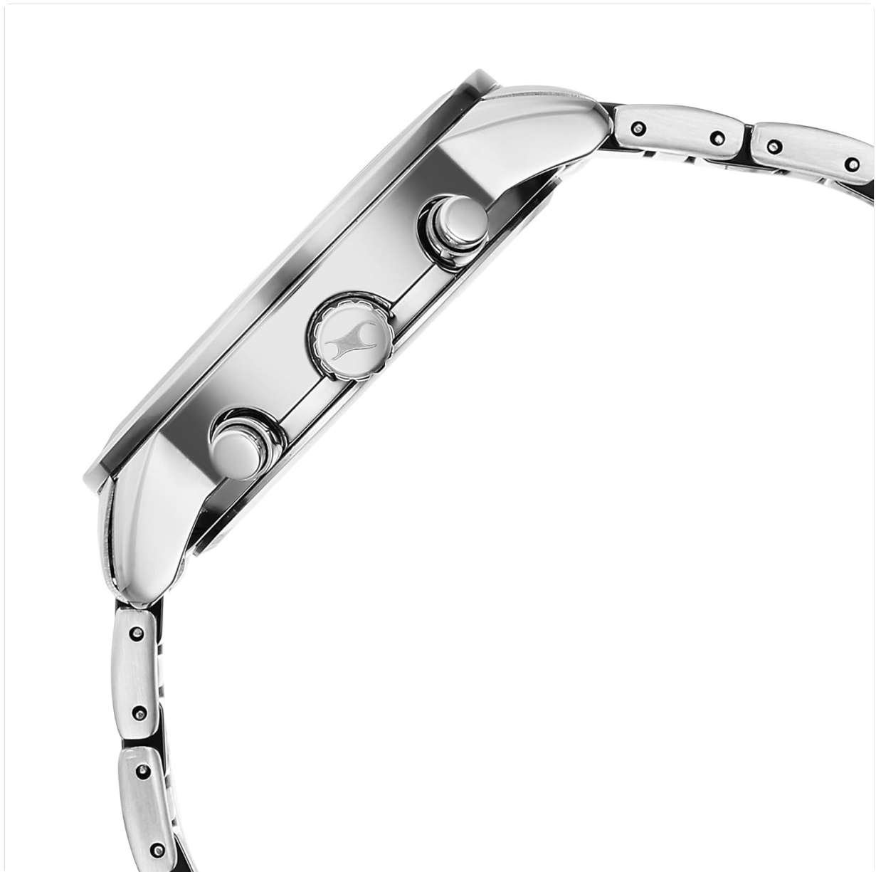
Image: Side view of the watch, highlighting the crown used for time adjustment.