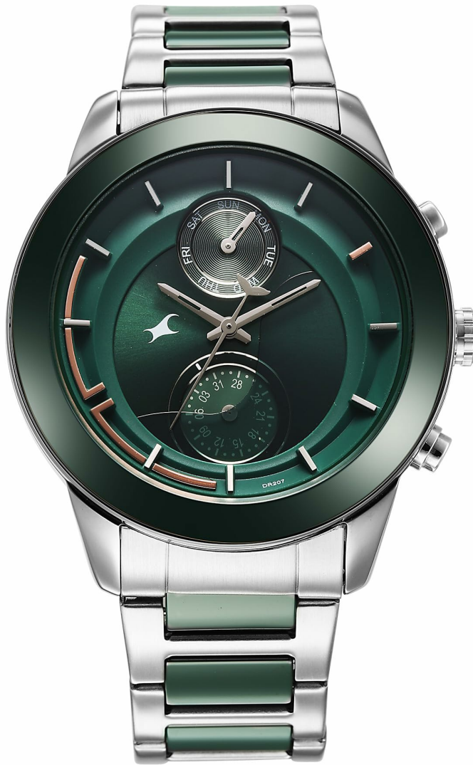
Image: Front view of the Fastrack Oceanyx-Ceramic Quartz Watch, Model 3304KD04, showcasing its green dial and ceramic strap.