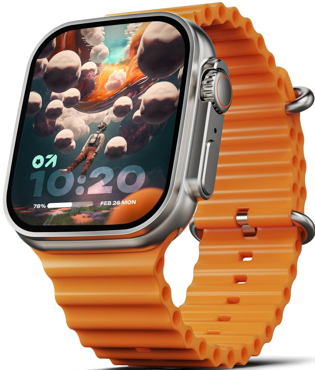
Image: The GOBOULT Crown Smart Watch, featuring a large display and an orange silicone strap.