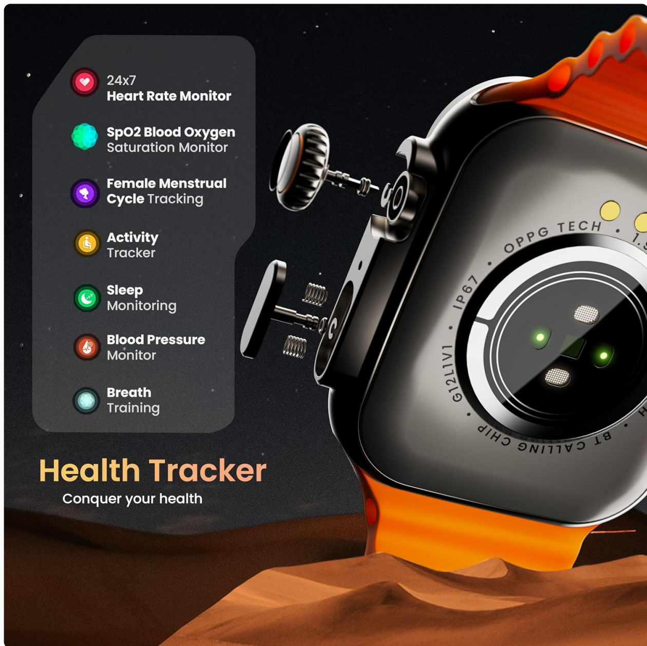
Image: An exploded view illustrating the internal mechanism of the working rotating crown, used for navigation and control.