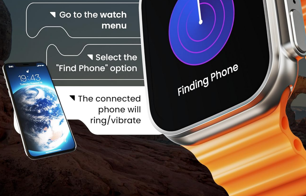
Image: The smartwatch screen illustrating the 'Find Phone' feature, with instructions on how to activate it to locate a connected smartphone.