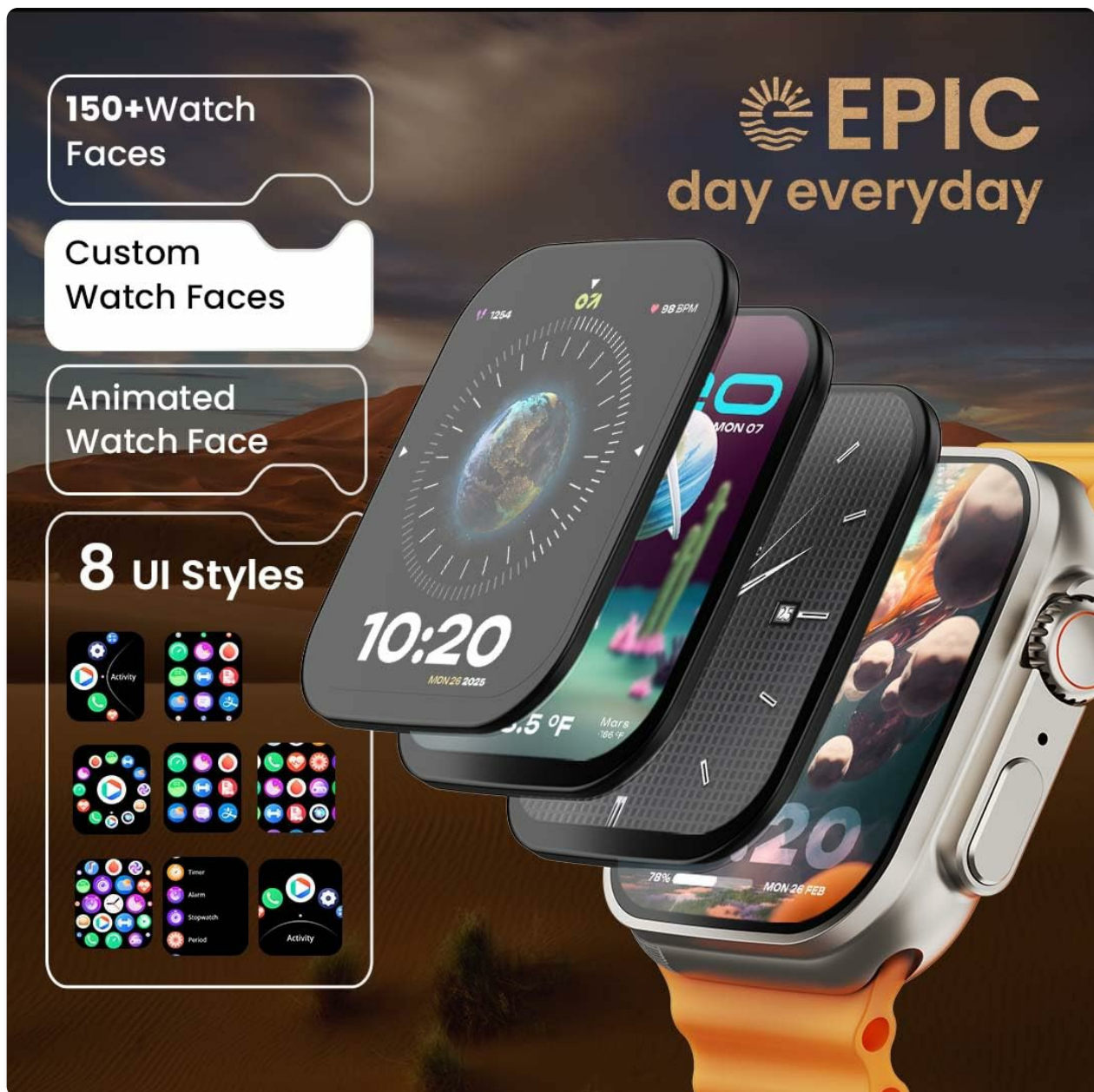
Image: A collage showcasing various watch faces, including custom and animated options, along with different UI styles available for personalization on the smartwatch.