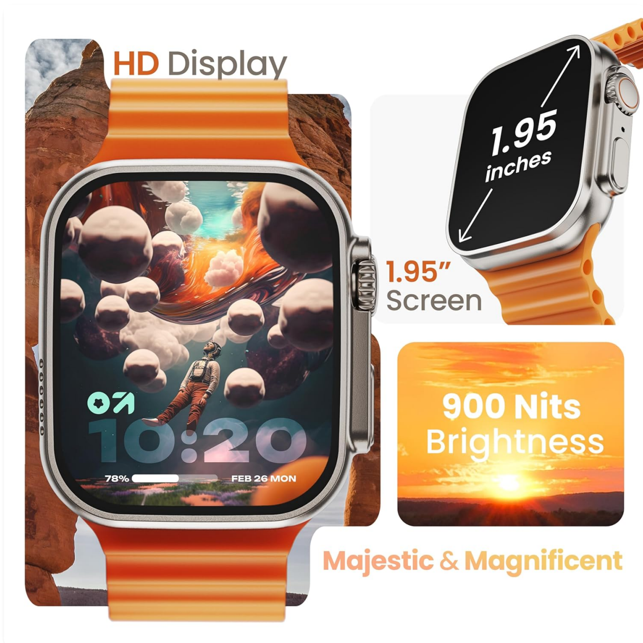
Image: Close-up of the smartwatch display, highlighting its 1.95-inch size and 900 Nits brightness for clear visibility.