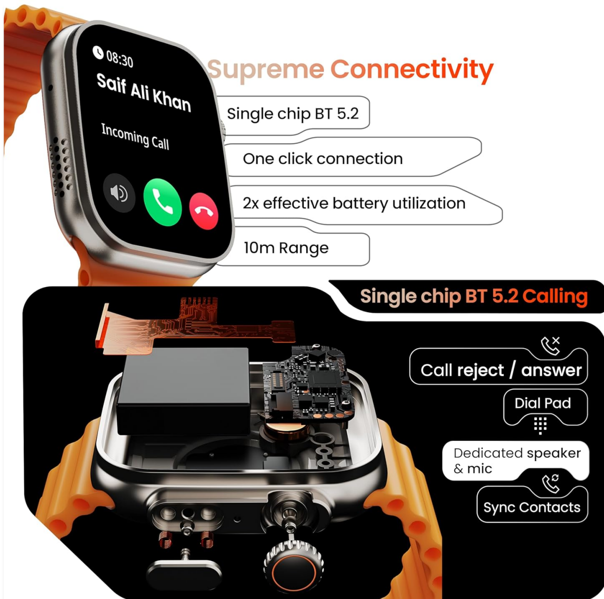
Image: The smartwatch screen showing an incoming call, alongside diagrams explaining Bluetooth 5.2 calling features like call answer/reject, dial pad, and contact sync.

The GOBOULT Crown Smart Watch supports Bluetooth Calling 5.2, allowing you to make and receive calls directly from your wrist. It features a built-in speaker and microphone for clear communication.