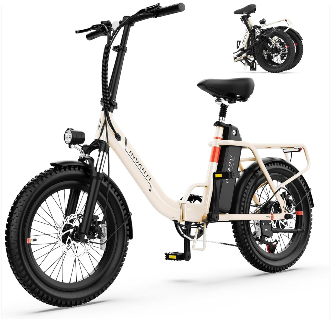
Figure 1.1: INVANTI Folding Electric Bike (Black Model)

This image displays the INVANTI Folding Electric Bike in its full, unfolded state, showcasing its robust frame, fat tires, and integrated rear rack. The bike is presented in a black finish, highlighting its sleek design.