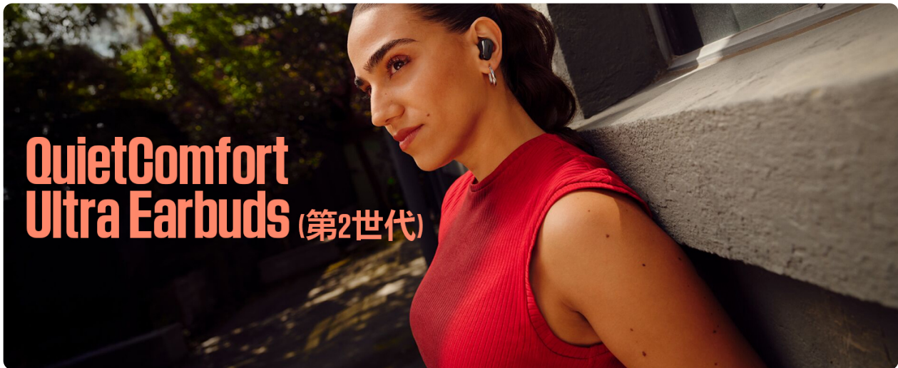
Image: A woman with her eyes closed, deeply engrossed in music while wearing the Bose QuietComfort Ultra Earbuds, symbolizing the immersive audio experience.