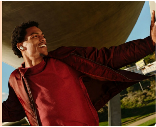
Image: A man using the Bose QuietComfort Ultra Earbuds for a phone call, highlighting the clear voice transmission feature.

パーソナライズされた最高のオーディオ、ワールドクラスのノイズキャンセリング、そして複数デバイス間でもシームレスな切り替えと接続。音楽がコアとなる時に欠かせないこれらの機能をすべて実現する、究極のワイヤレスイヤホンです。