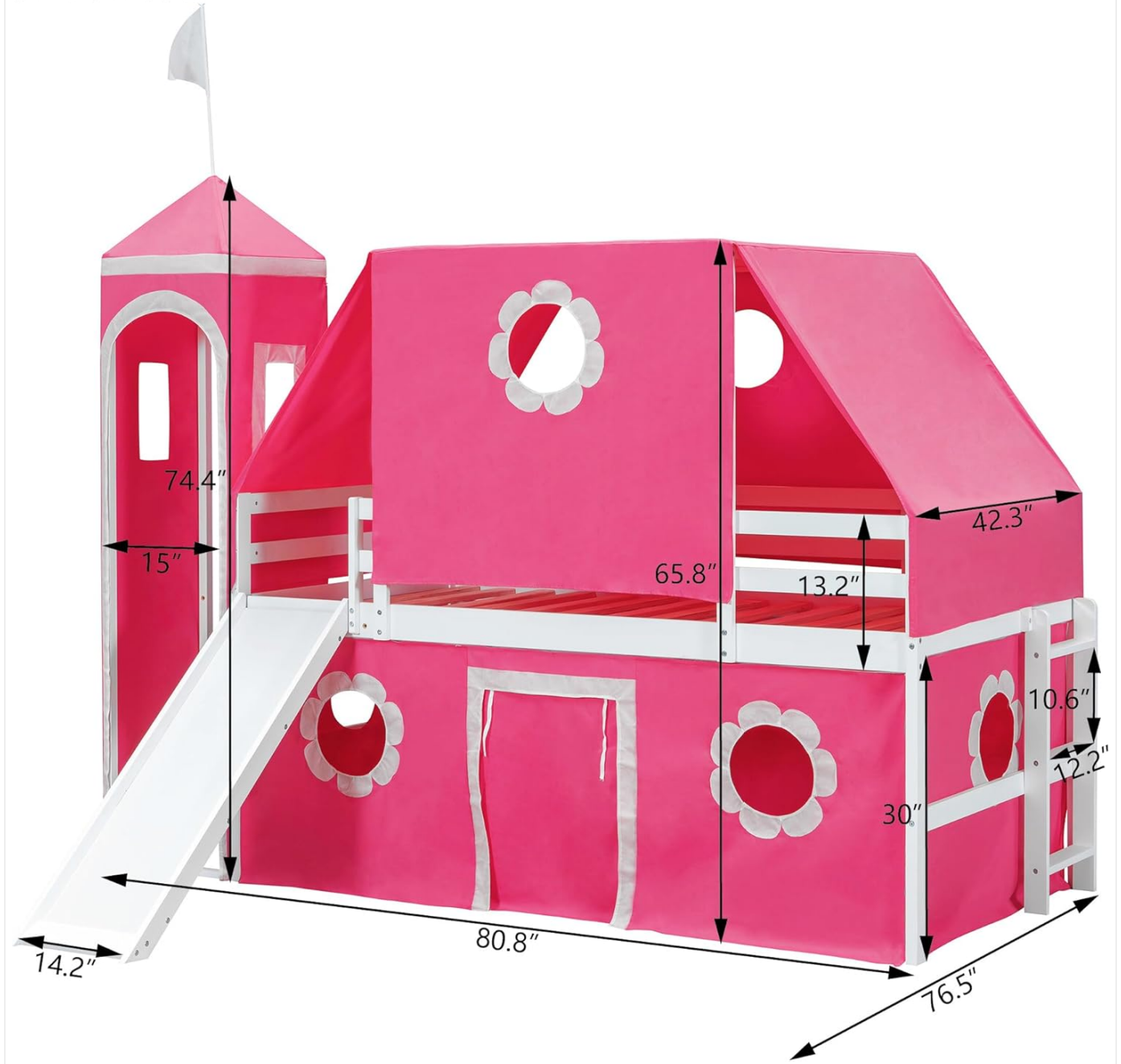
Image 1: Overall dimensions of the Polibi Castle Loft Bed. The bed measures approximately 80.8 inches in length, 76.5 inches in width (including the slide), and 74.4 inches in height (to the top of the tower flag). The sleeping platform is 65.8 inches long and 13.2 inches high from the base of the bed frame. The slide extends 14.2 inches from the bed frame.