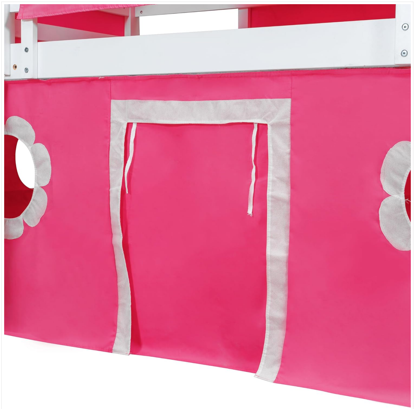
Image 5: A detailed view of the tent door for the under-bed play area, showing the ties for securing it open or closed.