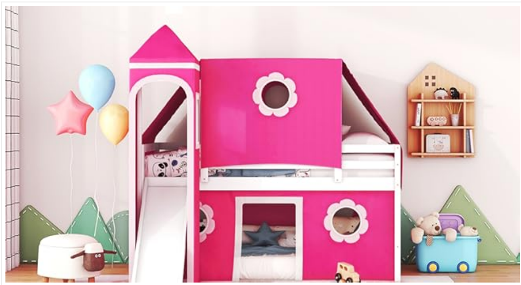
Image 3: A view of the assembled Polibi Castle Loft Bed, showcasing the slide and tower components. The tent fabric is installed, creating the castle aesthetic.