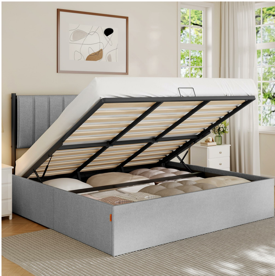
Image: The VASAGLE King Size Hydraulic Lift-Up Storage Bed Frame, showcasing its upholstered headboard and sleek design.