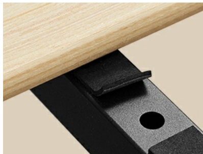
Image: The snap-on design of the slats ensures quick and secure installation into the bed frame.

Image: High-quality wooden slats provide robust support for your mattress, eliminating the need for a box spring.