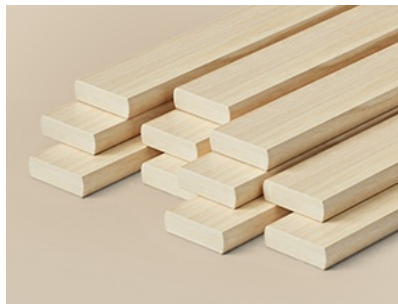
Image: High-quality wooden slats provide robust support for your mattress, eliminating the need for a box spring.

Install the wooden slats into the bed frame. The snap-on design allows for easy and secure placement. Ensure all slats are evenly spaced and firmly seated in their holders.