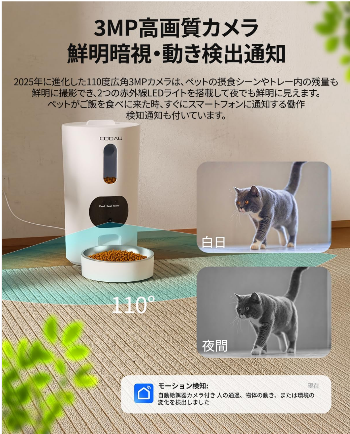
Image: The camera provides clear vision both during the day and at night.