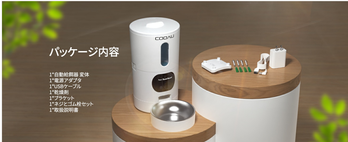
Image: All components included in the package.