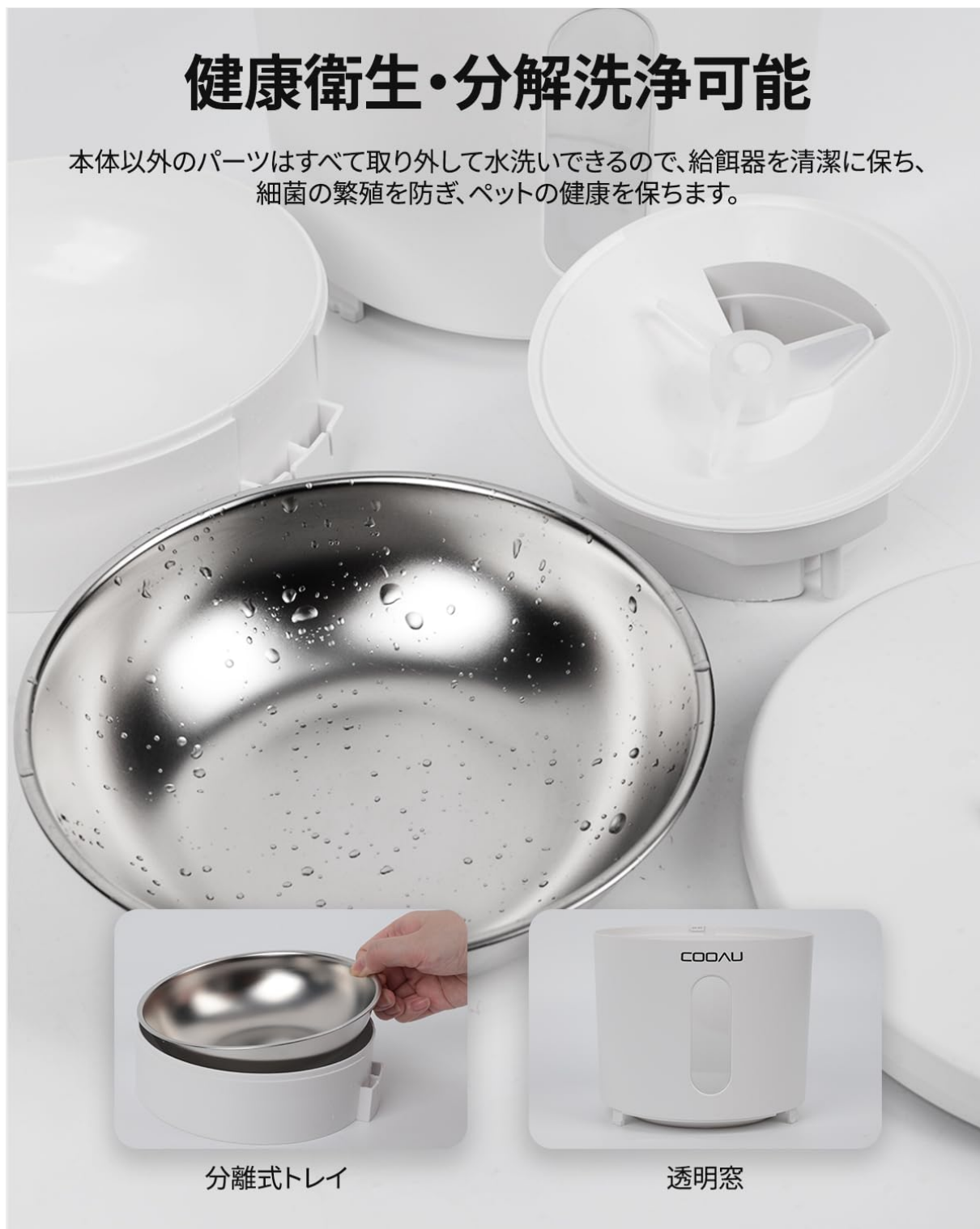
Image: The feeder's components are designed for easy disassembly and cleaning.

本体以外のパーツはすべて取り外して水洗いできるので、給餌器を清潔に保ち、細菌の繁殖を防ぎ、ペットの健康を保ちます。