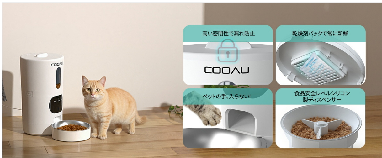
Image: The desiccant pocket helps maintain food freshness.