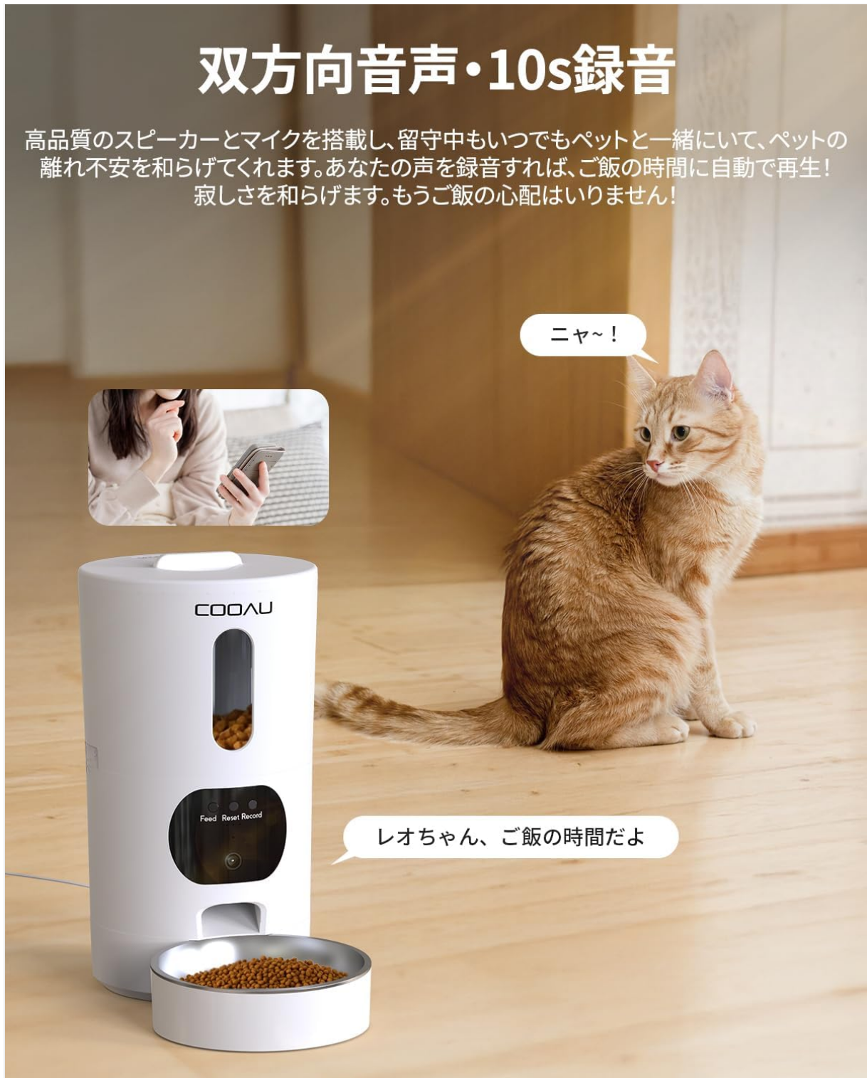
Image: The two-way audio feature allows you to interact with your pet remotely.