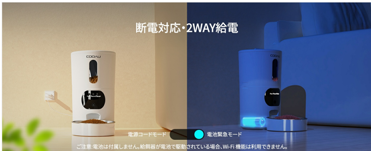
Image: The feeder can be powered by AC adapter or D-cell batteries for backup.