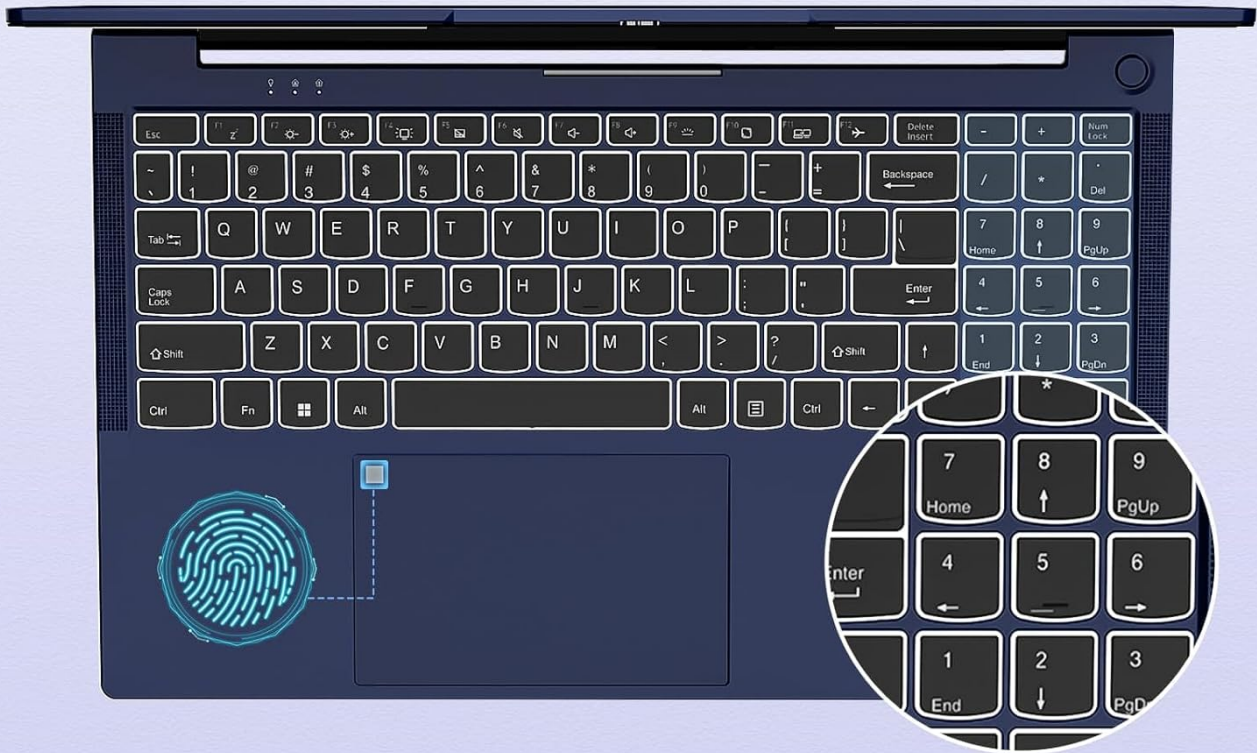
Image: Close-up of the laptop's keyboard, highlighting the fingerprint reader and backlit keys.