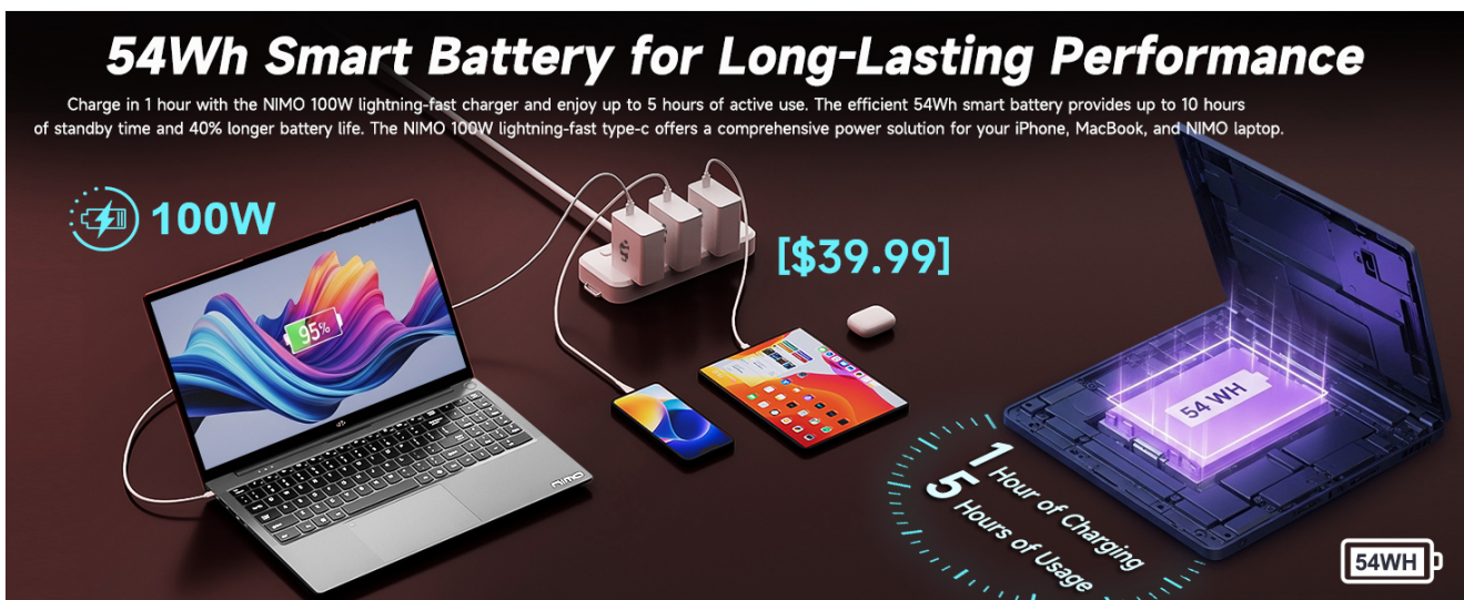
Image: The NIMO laptop displaying a vibrant image on its 15.6-inch FHD IPS screen.

The 15.6-inch FHD IPS anti-glare display (1920x1080 resolution) provides clear visuals. Adjust display settings such as brightness and resolution through Windows Display Settings.