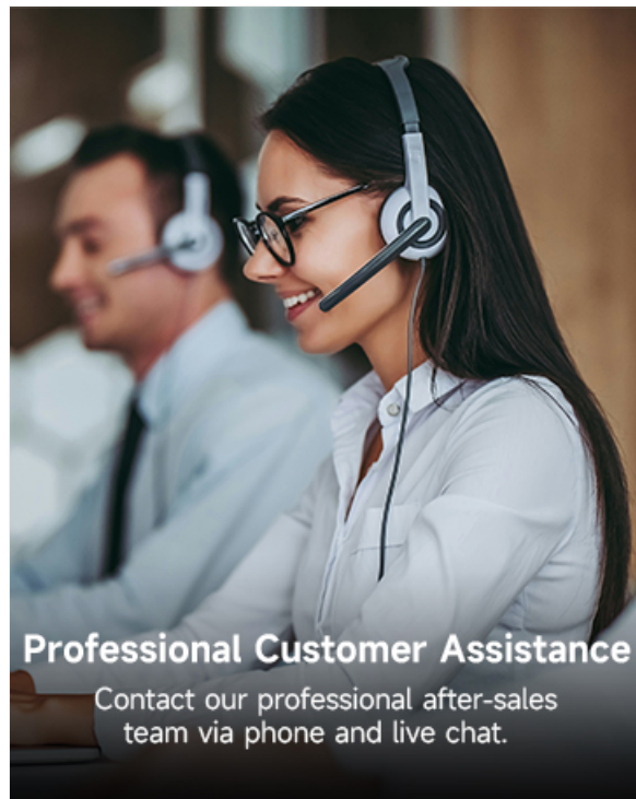
Image: NIMO customer service representatives ready to assist.