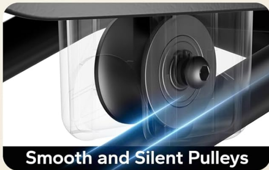
Smooth and Silent Pulleys