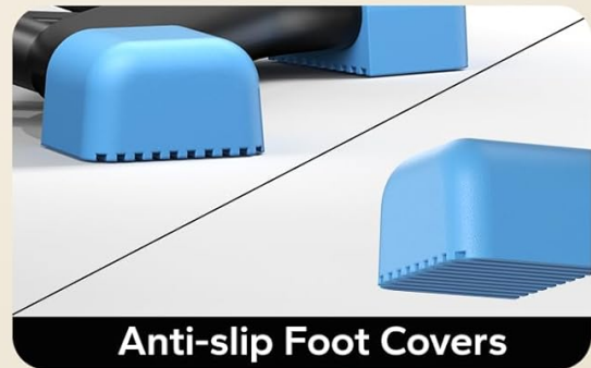
Anti-slip Foot Covers

Humanized Design: Features smooth and silent pulleys for fluid motion and anti-slip foot covers for enhanced stability during use.