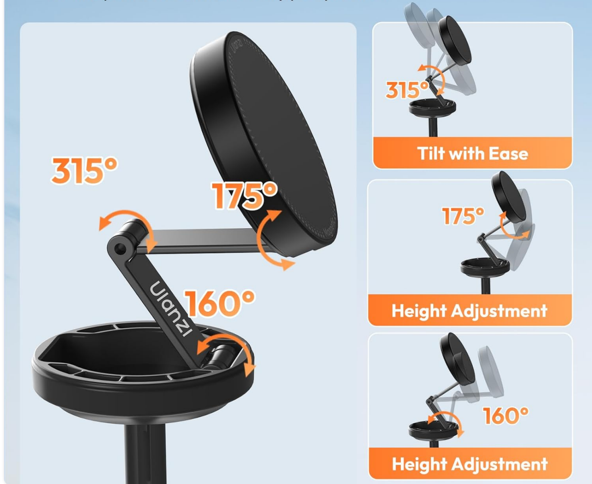
Image: Diagrams illustrating the multi-axis adjustability of the ULANZI MT85, including 315° tilt, 175° height adjustment, and 160° rotation to achieve various shooting angles.

With multi-axis folding and rotation, adjust to any angle you need for the perfect shot from every perspective.