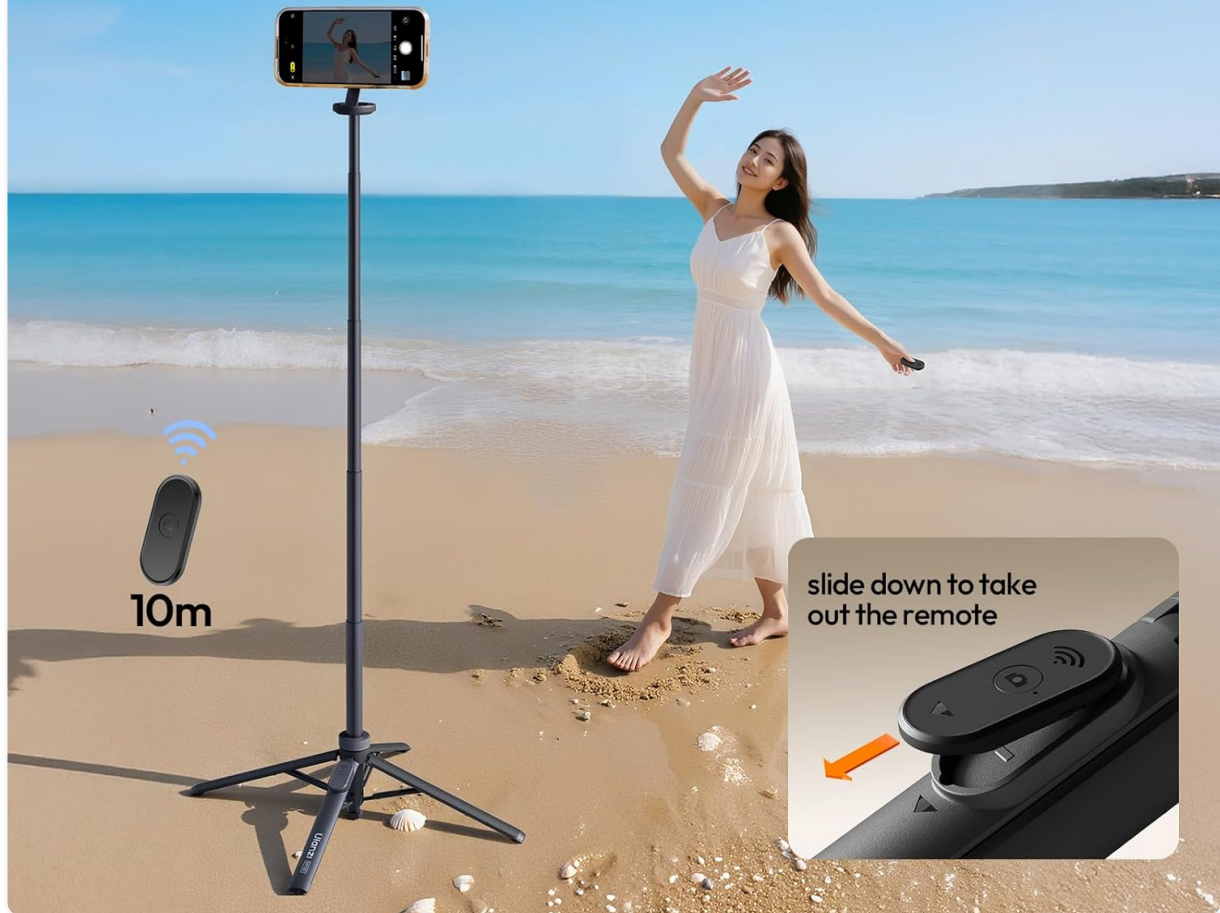
Image: The ULANZI MT85 in tripod mode with a phone mounted, showing the detachable Bluetooth remote control and its 10m range for capturing photos or videos.

Control your shots effortlessly with the Bluetooth remote. With up to 10m range, you can capture photos or videos from a distance