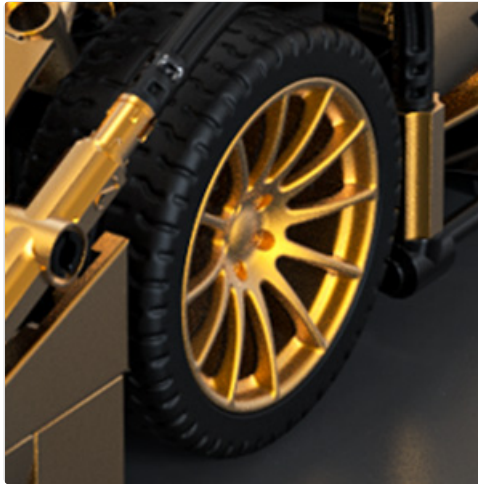
A close-up image focusing on one of the wheels of the RiceBlock RB0067 sports car model, showing the intricate spoke design and tire detail.

Avoid applying excessive force to any movable parts to prevent damage.