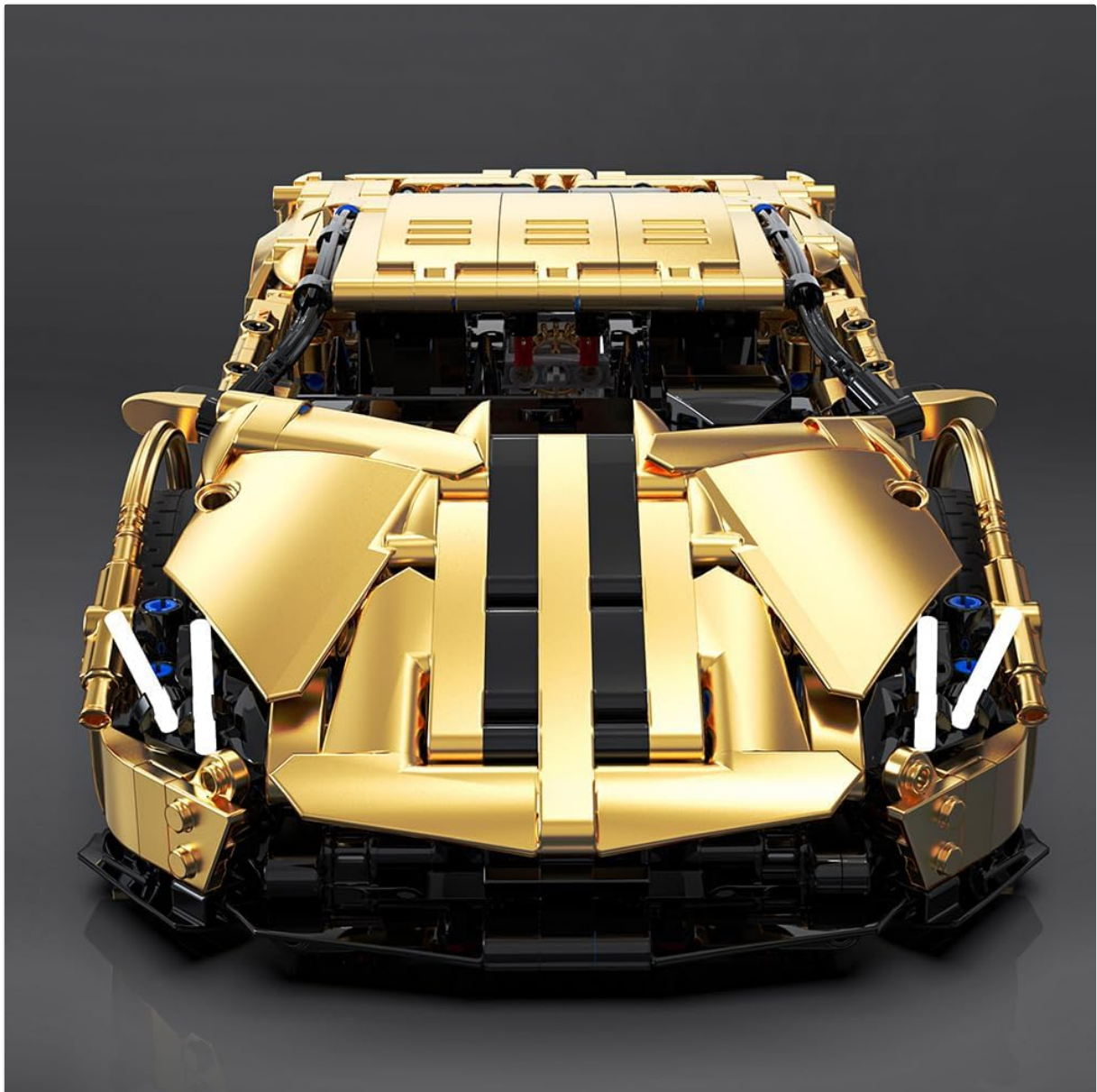
A direct front view of the RiceBlock RB0067 sports car model, highlighting the intricate front grille, headlights, and aerodynamic lines. The gold and black color scheme is prominent.