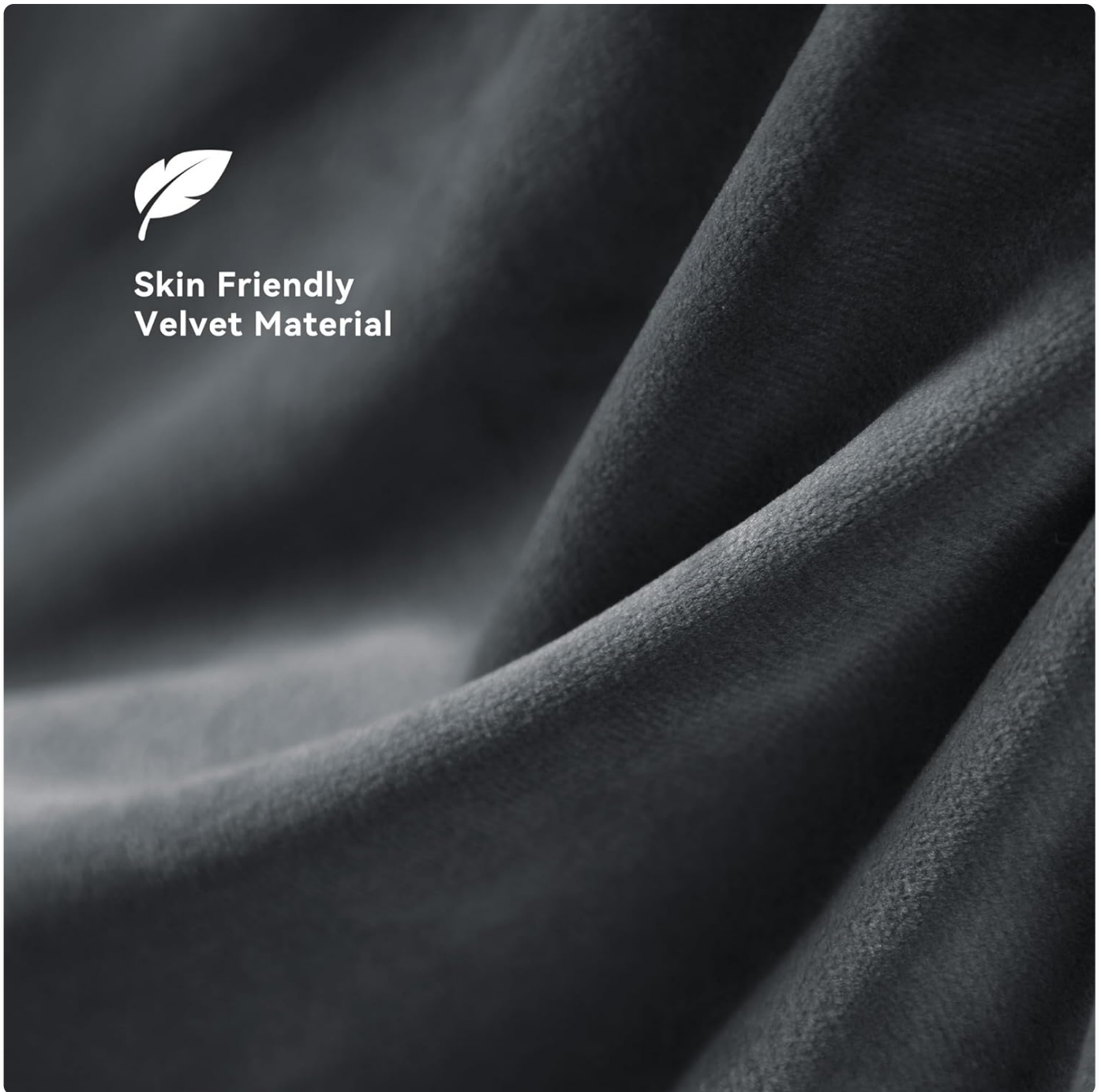
Image 2.6: A close-up view of the velvet fabric, emphasizing its skin-friendly quality.