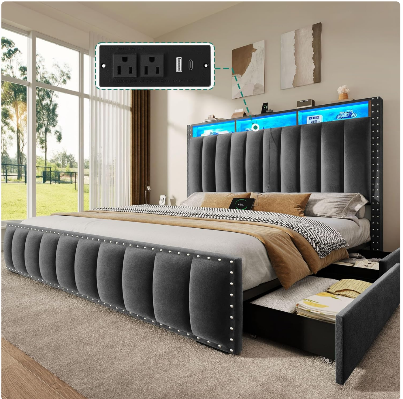
Image 1.1: Overview of the DWVO Queen Size Bed Frame, highlighting the integrated charging station in the headboard.