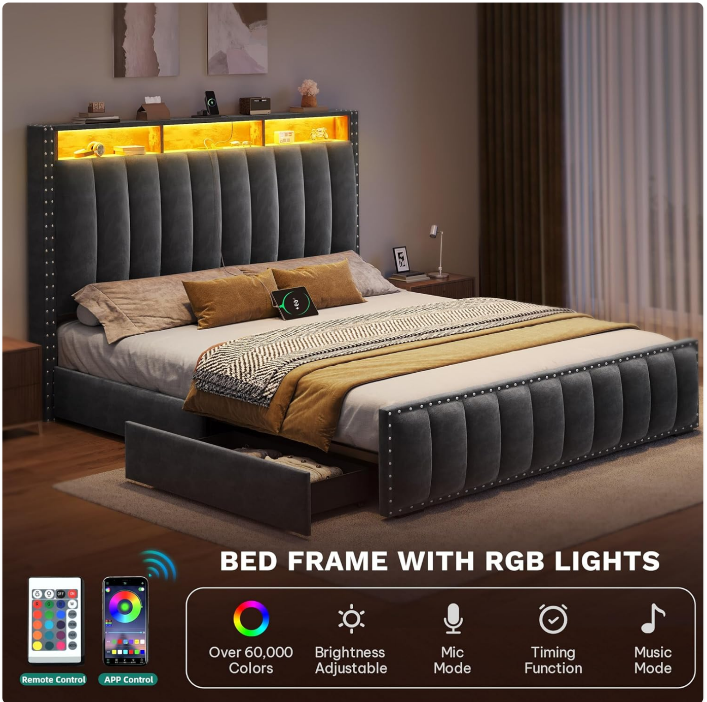
Image 2.2: The bed frame illuminated by RGB LED lights, illustrating control methods and features like color options and music sync.