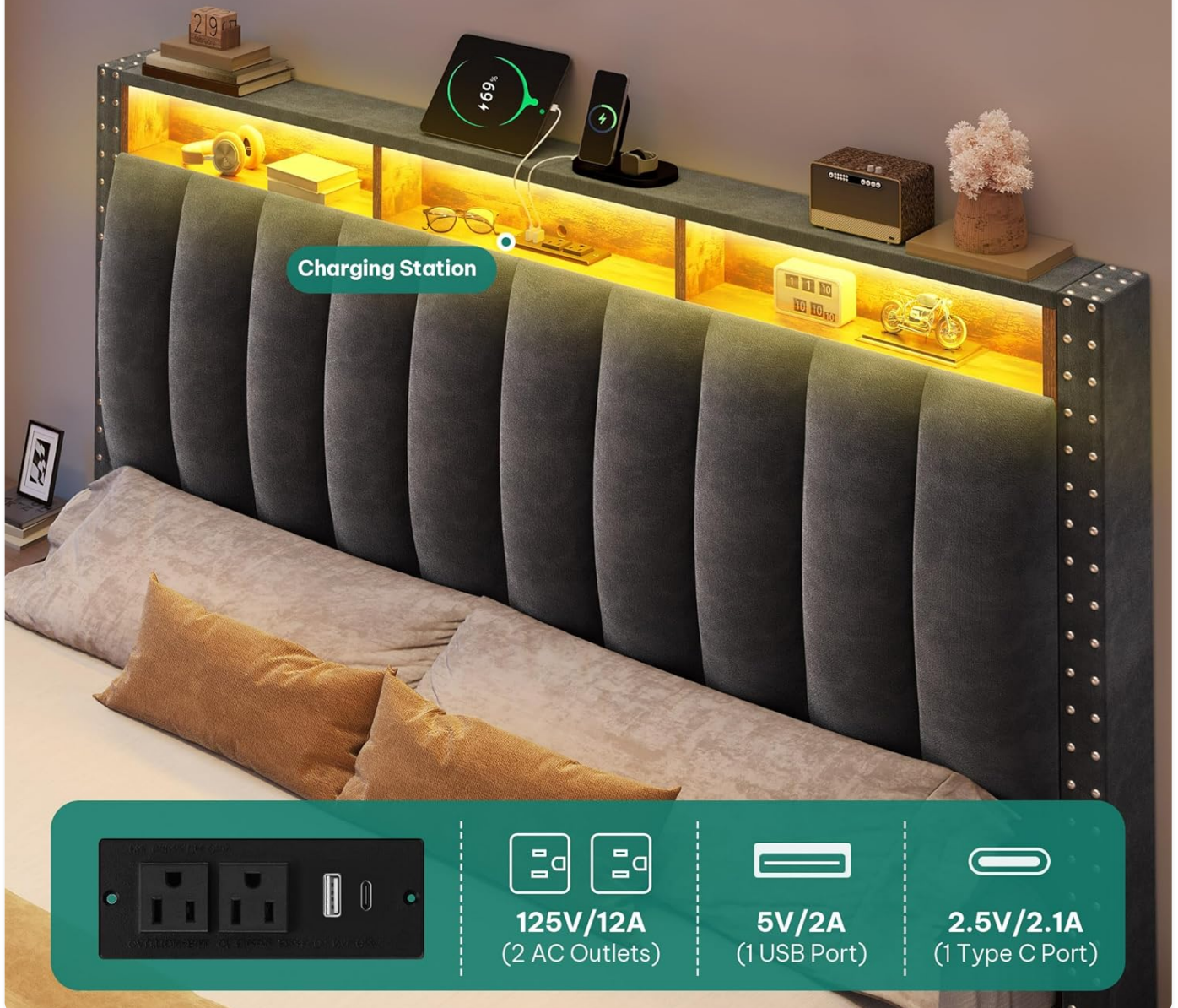
Image 2.1: Detailed view of the headboard's storage shelves and integrated charging station ports.