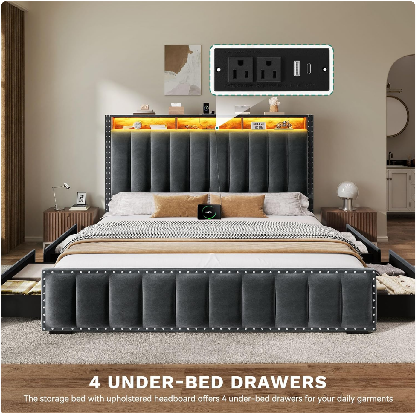
Image 2.3: The bed frame with all four storage drawers extended, demonstrating their capacity.