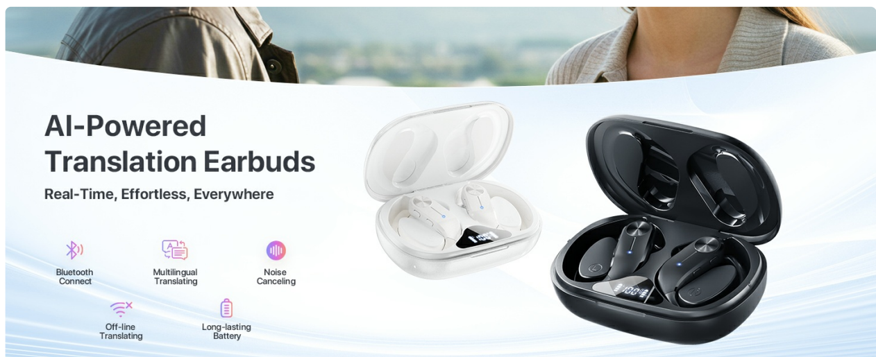
Image: Parfesod Q28S AI Translation Earbuds in white and black, highlighting key features.

Thank you for choosing the Parfesod Q28S AI Translation Earbuds. These earbuds are designed to facilitate seamless communication across language barriers, offering real-time translation, noise cancellation, and extended battery life. This manual provides detailed instructions for setup, operation, and maintenance to ensure optimal performance and user experience.