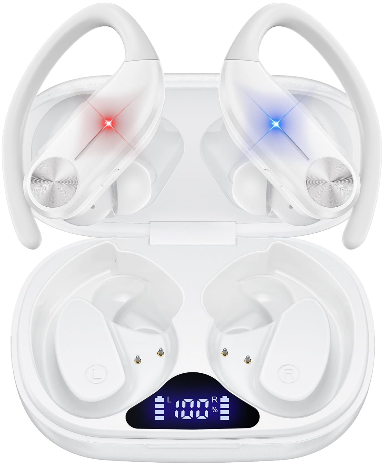
Image: Parfesod Q28S AI Translation Earbuds in their charging case.