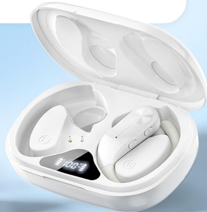
Image: Overview of available translation modes.