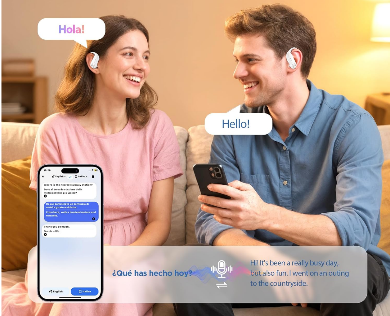
Image: Real-time translation in action.