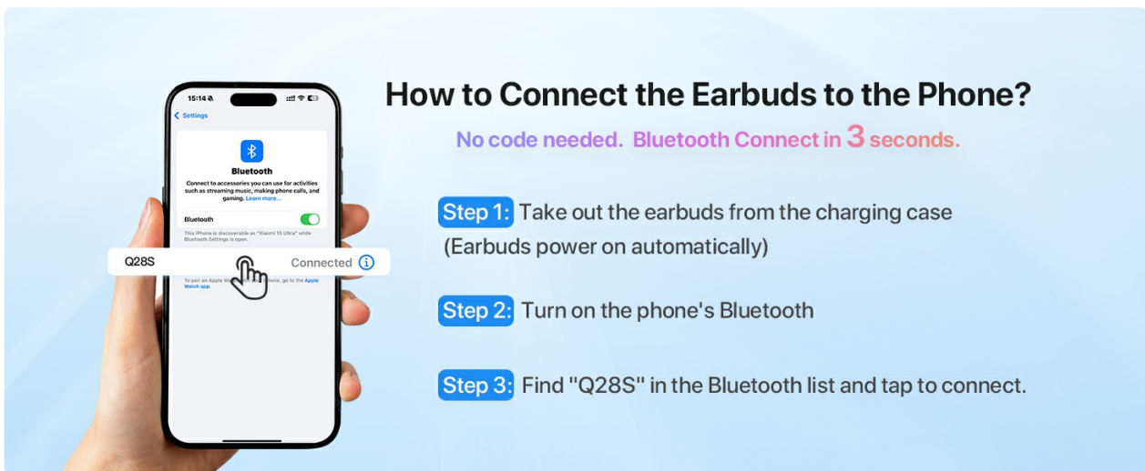
Image: Bluetooth pairing instructions.