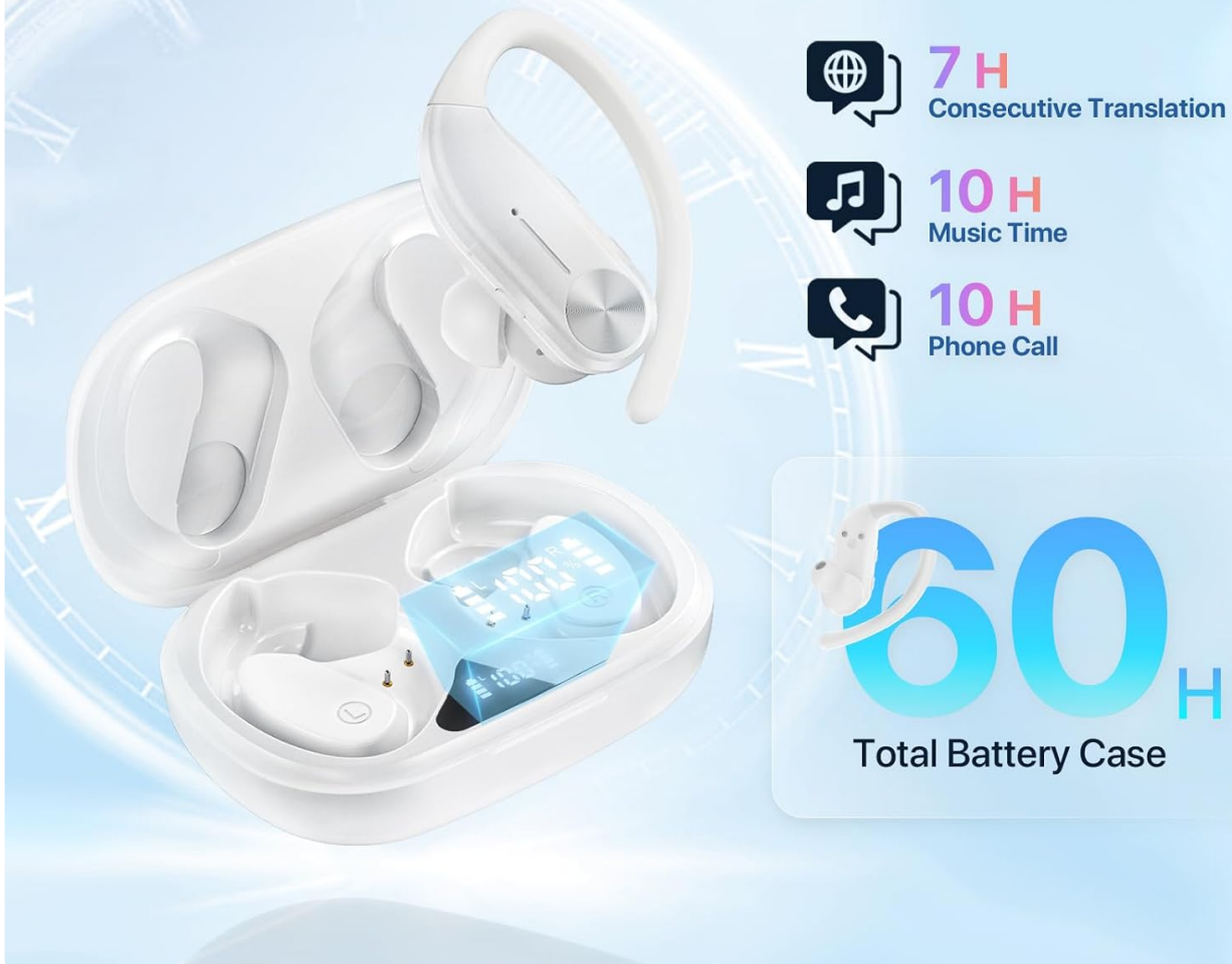
Image: Battery life indicators for the Parfesod Q28S earbuds and charging case.

No Interruptions for Consecutive Translation