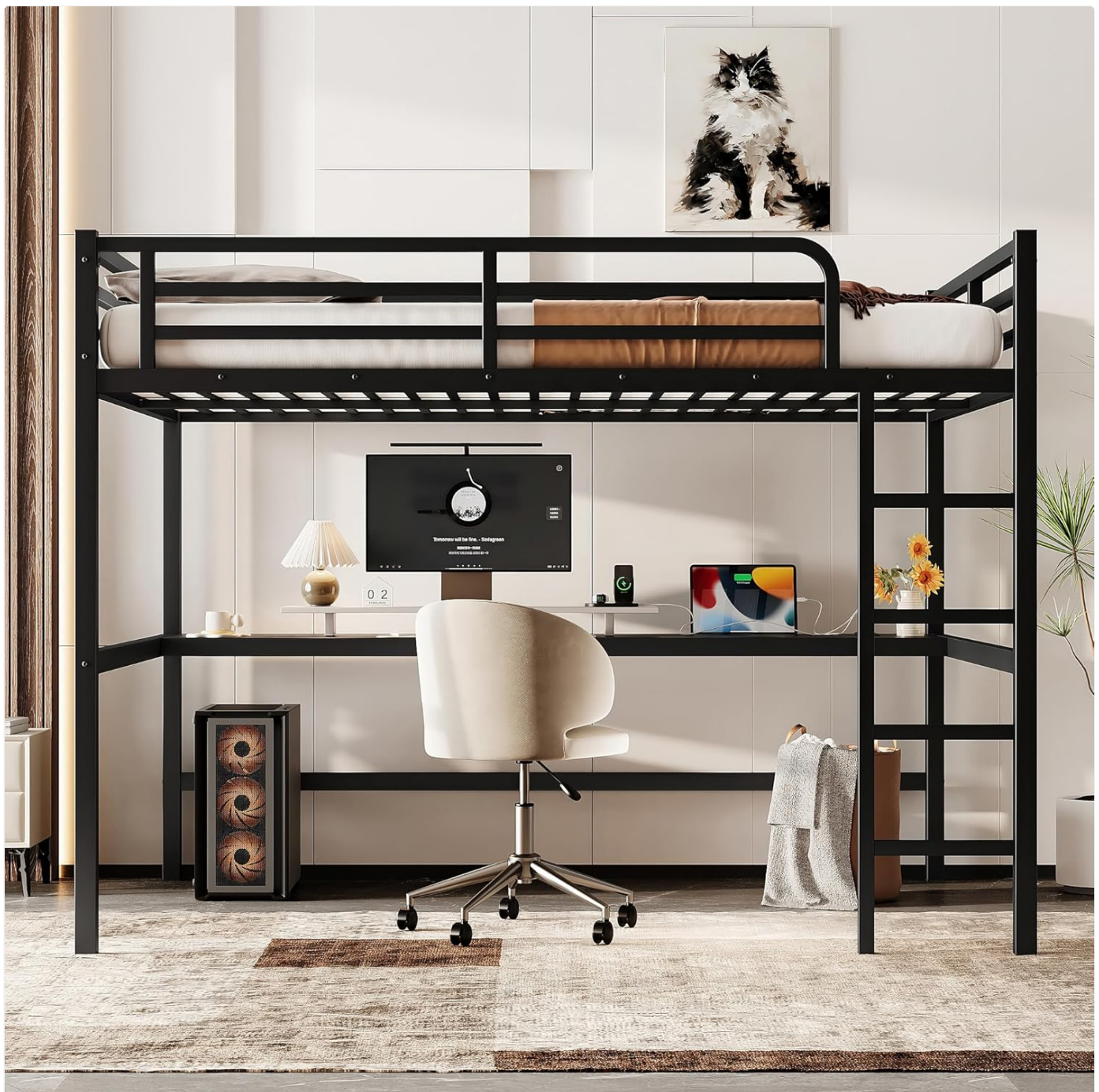
Figure 2.1: Overall dimensions and key components of the loft bed. This diagram illustrates the full structure, including the bed frame, desk, and ladder, with measurements in inches.