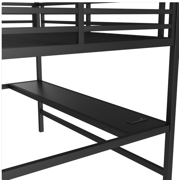
Figure 3.3: Detail of the desk surface, highlighting the built-in power outlets for convenient device charging. This image focuses on the functionality of the integrated workstation.