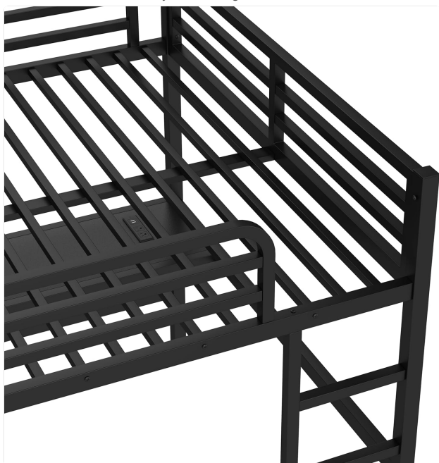
Figure 3.4: Detail of the metal bed slats and the secure guardrail, illustrating the bed's robust construction and safety features. This view emphasizes the support structure for the mattress.