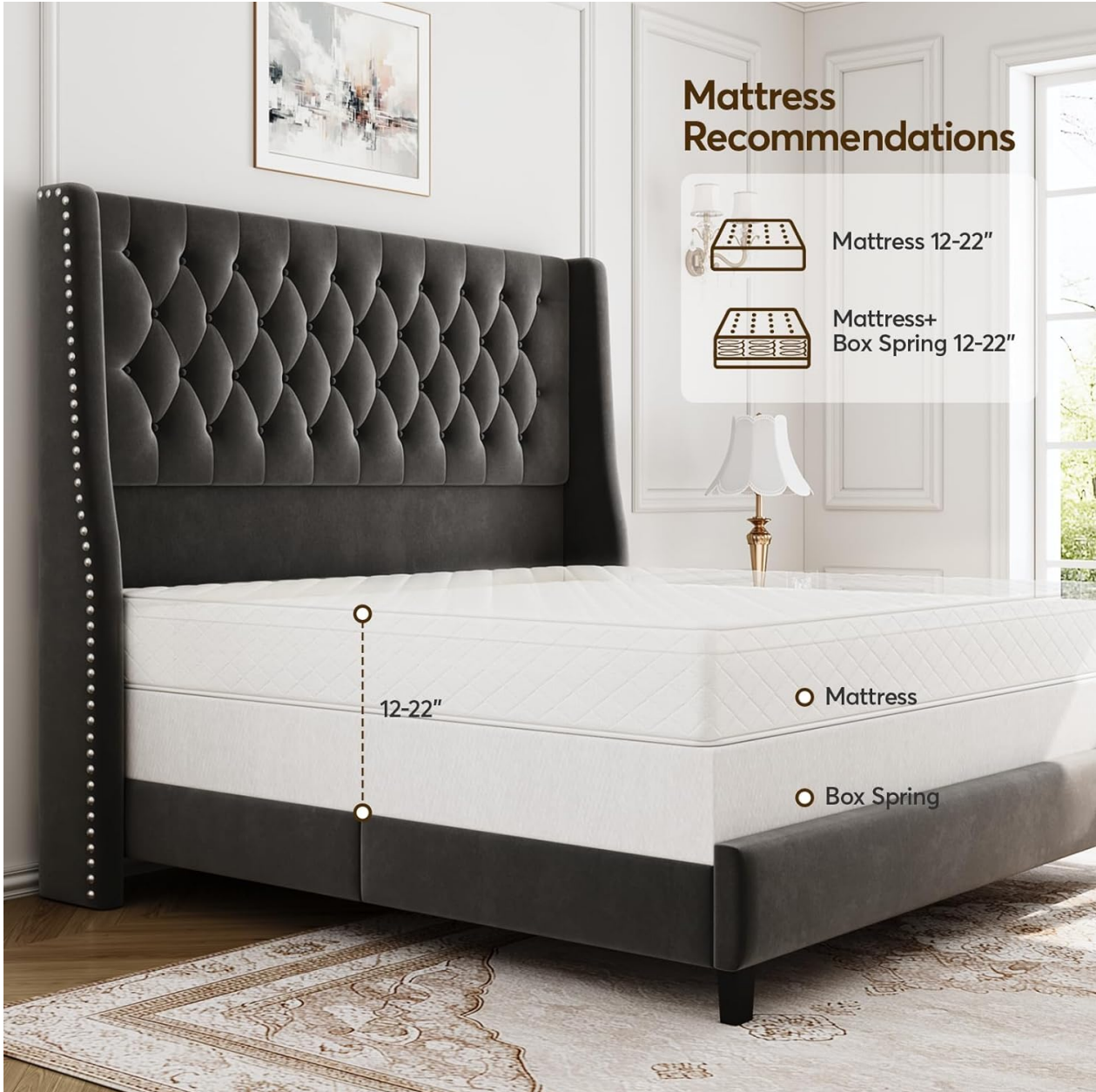
Image 4: Visual guide for recommended mattress heights (12-22 inches) and options for using a box spring.

The 55.4-inch tall headboard accommodates various mattress thicknesses. You can use a mattress between 12-22 inches for optimal comfort and aesthetic. If you prefer a higher bed profile, a mattress and box spring combination (totaling 12-22 inches in height) can also be used.