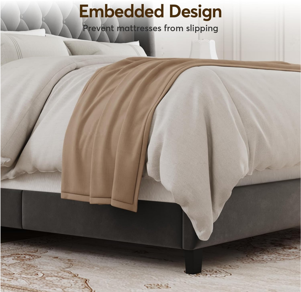
Image 5: Detail of the embedded frame design, which secures the mattress and prevents movement.