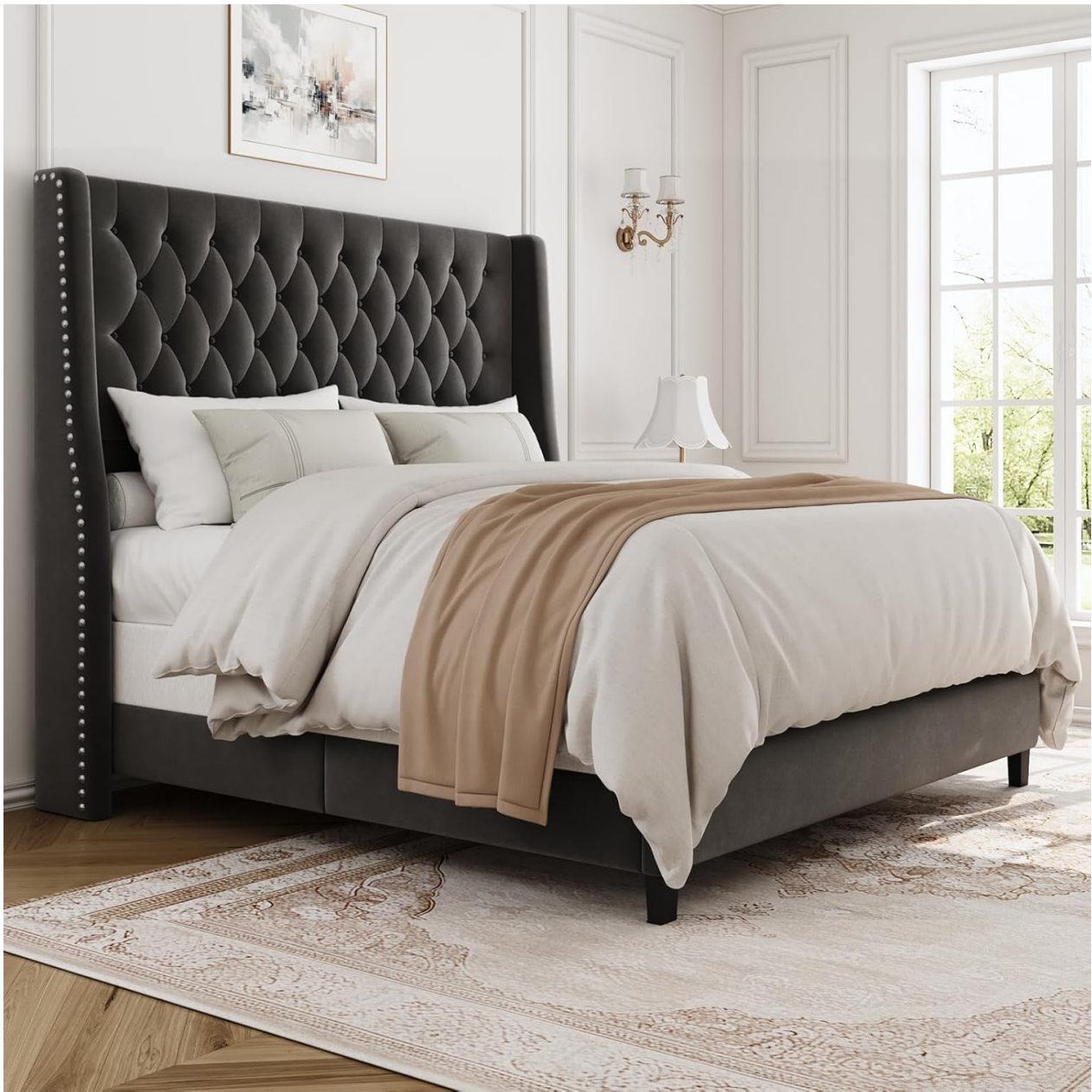
Image 1: The SEREINEY BH2310F Full Upholstered Platform Bed Frame, showcasing its tall headboard and elegant design.