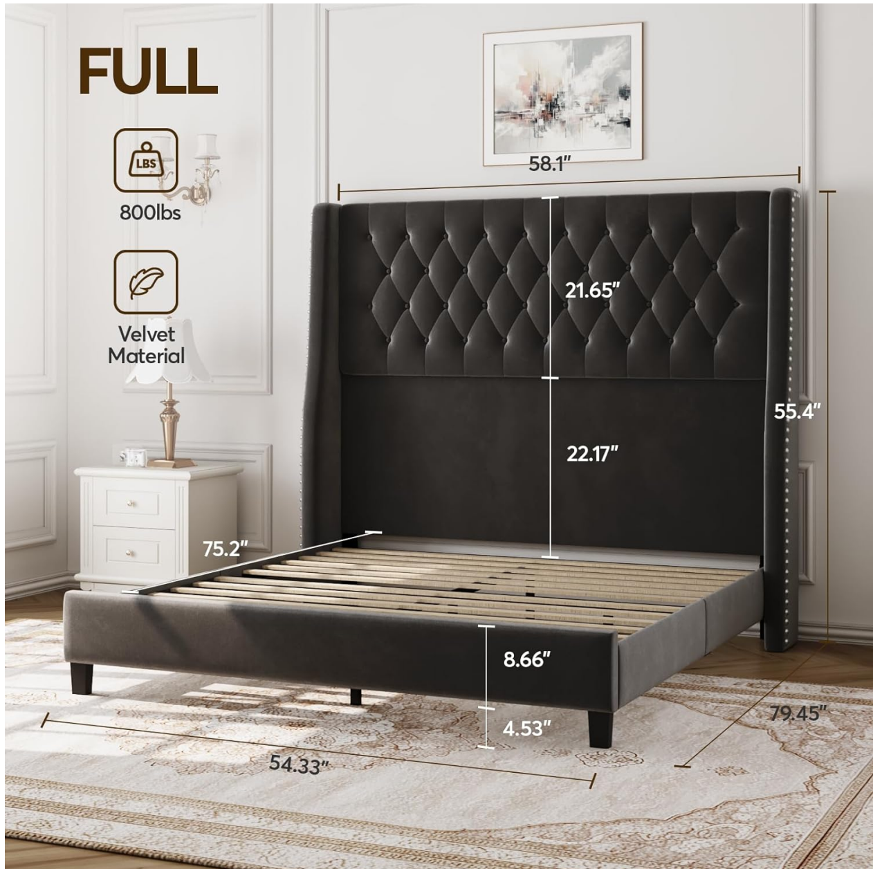
Image 2: Detailed dimensions of the Full bed frame, including headboard height and overall length/width.

The bed frame components are designed to fit together intuitively. Begin by laying out all parts and identifying them using the provided labels. Attach the side rails to the headboard and footboard, then install the support slats. Ensure all connections are firm.