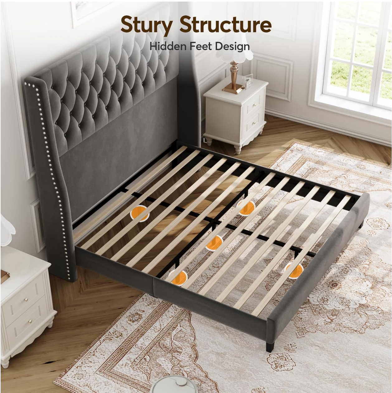
Image 3: View of the sturdy internal structure, highlighting the metal frame and wooden slats for mattress support.