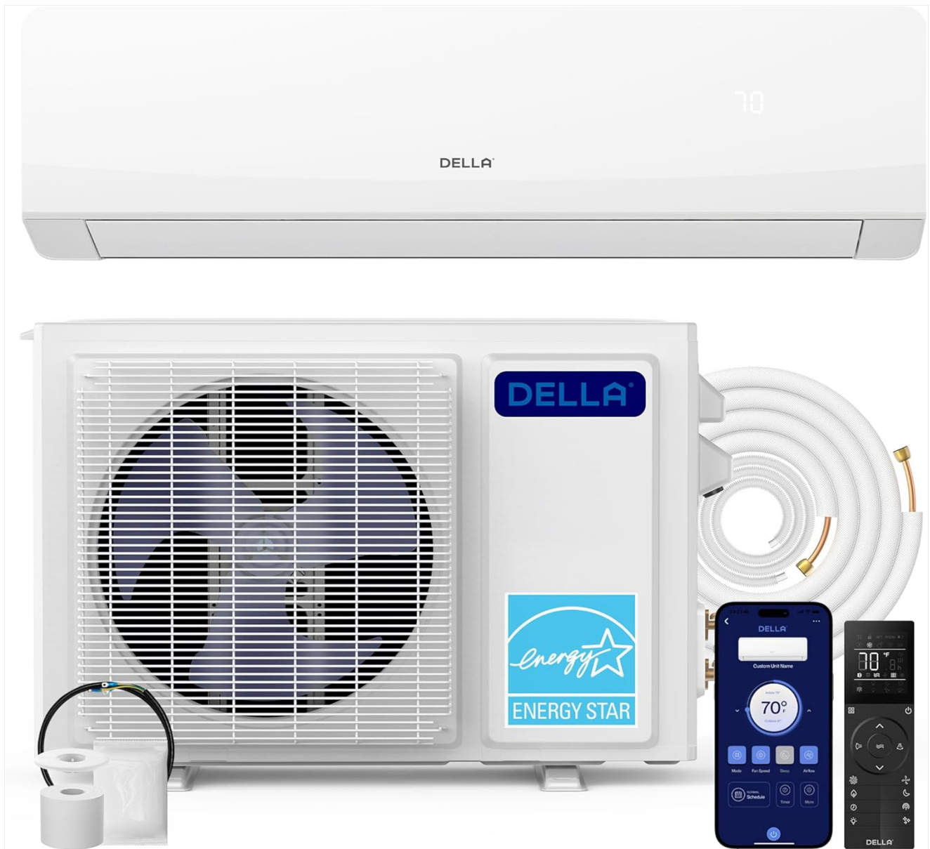
Image 1: DELLA Serena 12000 BTU Mini Split AC and Heat Pump system.