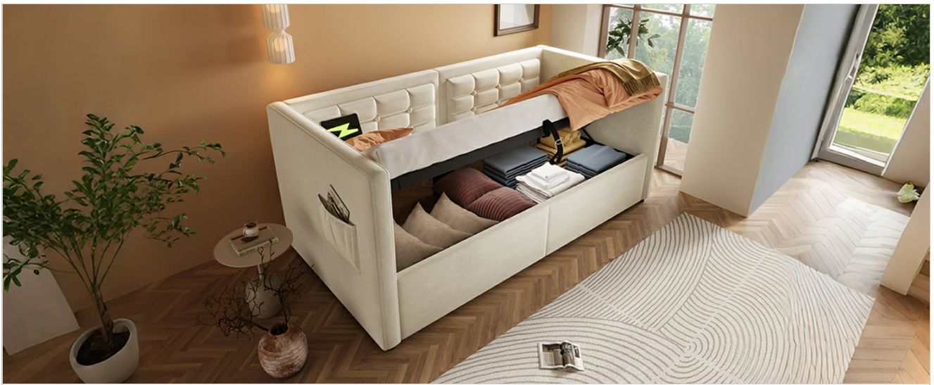
Image: Bed frame with hydraulic storage lifted, showing internal storage space.