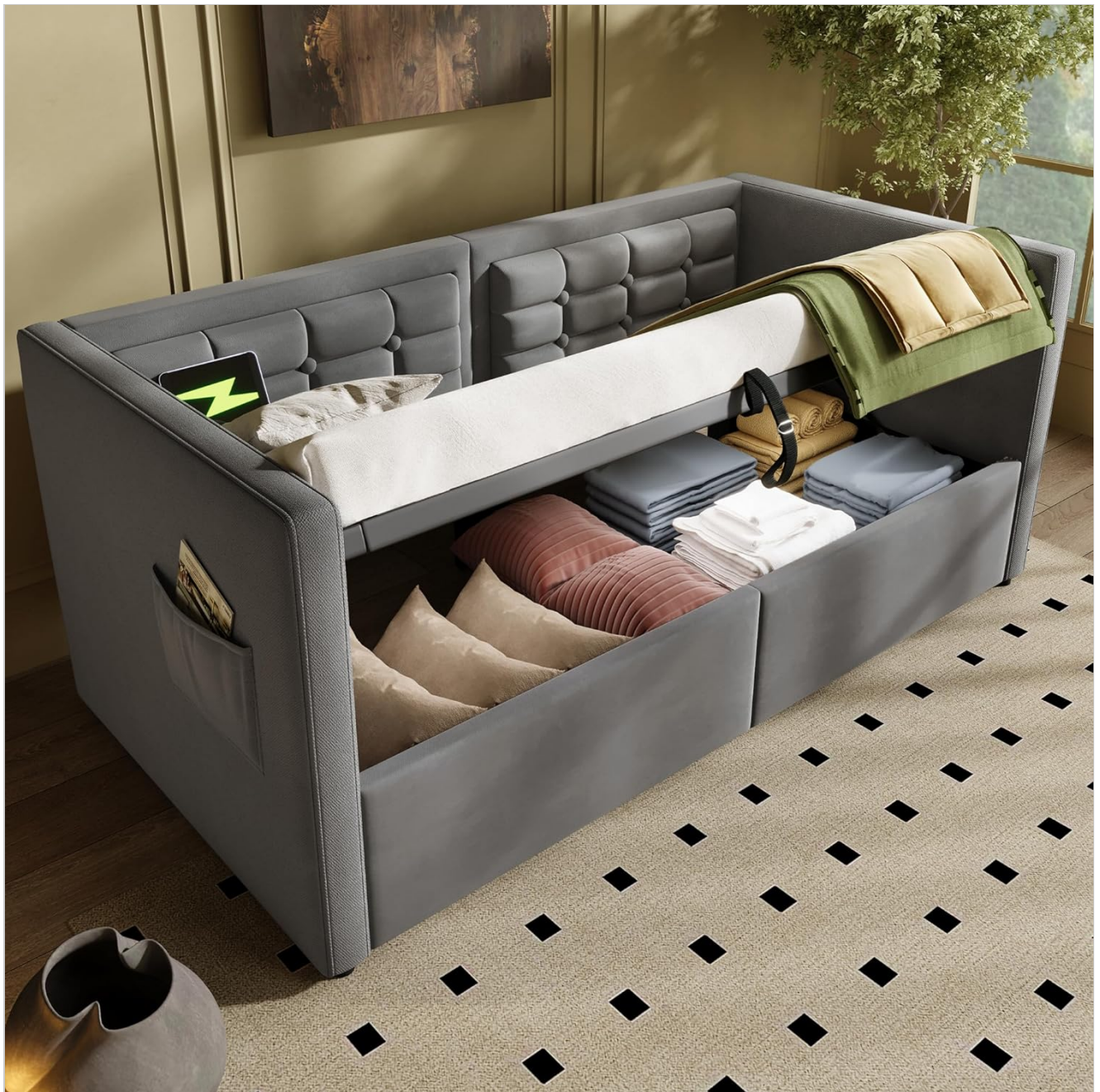
Image: Overview of the Polibi Hydraulic Storage Twin Bed Frame with storage visible.