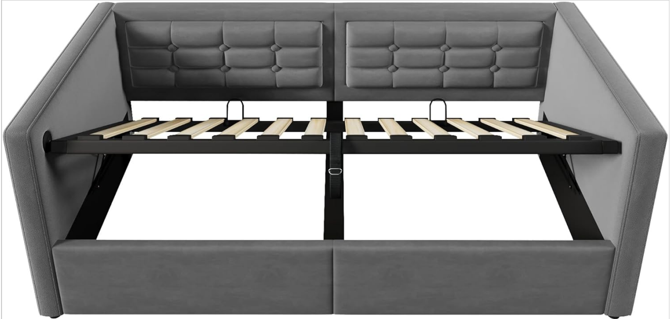
Image: Internal frame structure with wooden slats and hydraulic components.