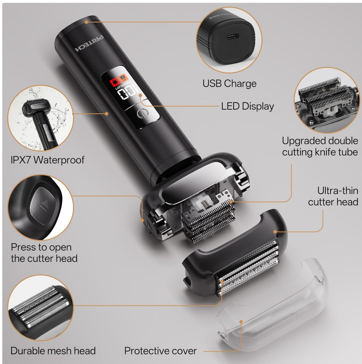
Image: Shaver connected for USB-C charging, illustrating battery life.