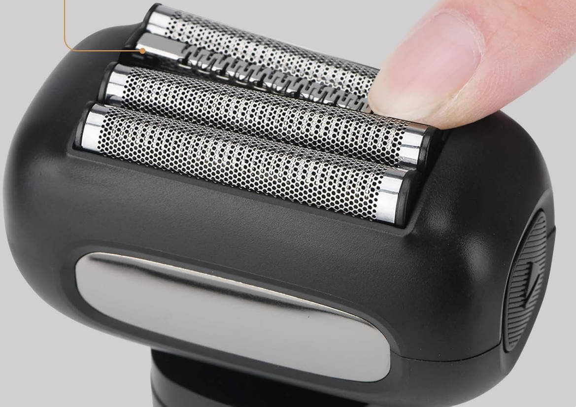
Image: Detail of the 4 floating blades and their pressure-sensitive design.

Pressure sensitive blades retract to protect your skin