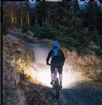
Outdoor activities at night