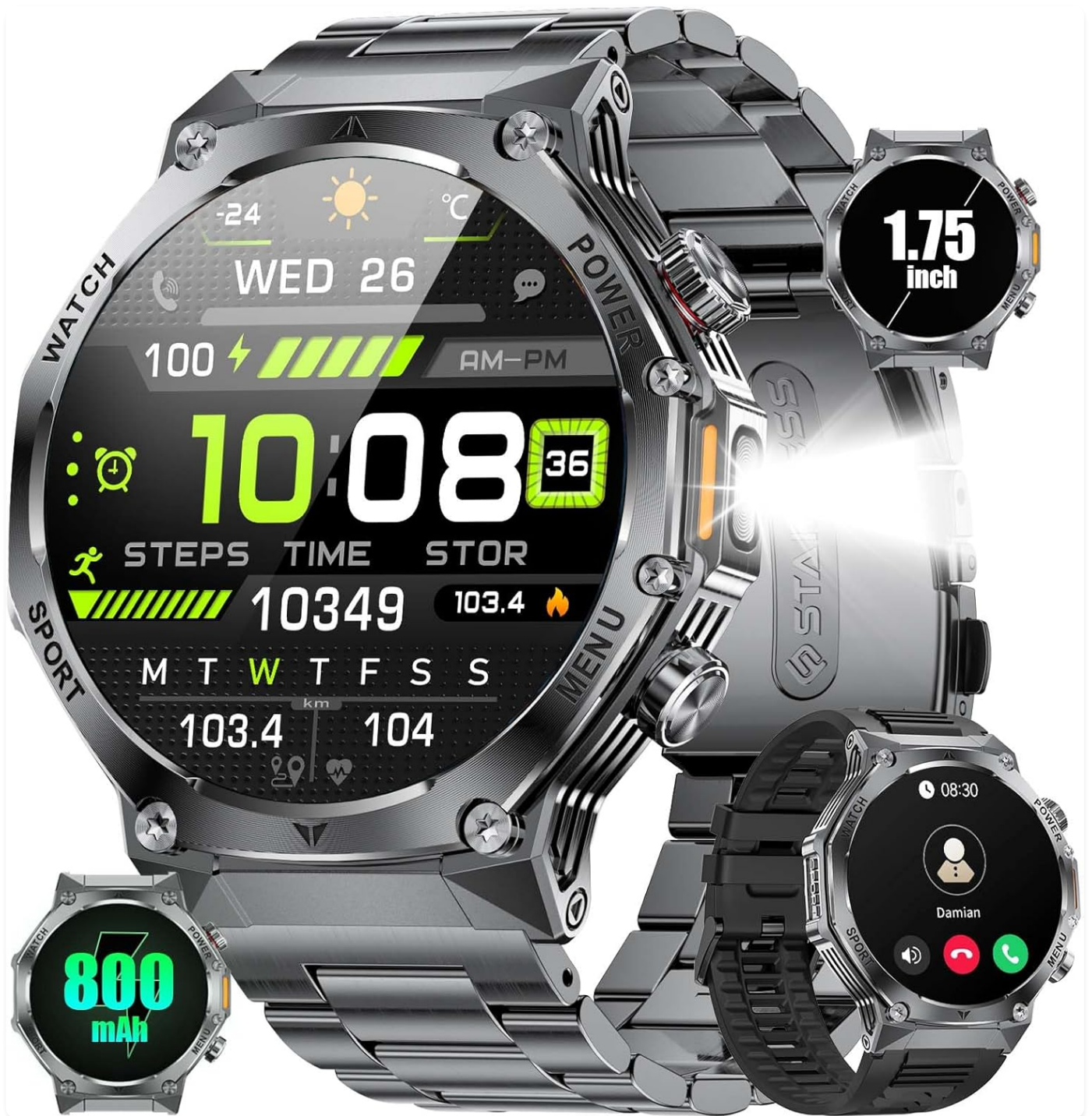
The SUNKTA EF15 Military Smart Watch, showcasing its robust design and key functionalities like the 1.75-inch HD display, 800mAh battery, and integrated LED flashlight.