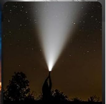
High Light Mode

The integrated LED flashlight provides practical illumination in various situations.