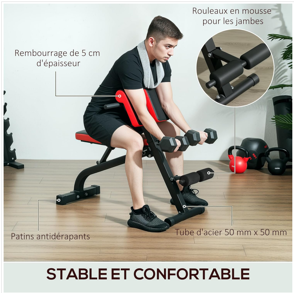
Image: A user seated on the bench, with callouts pointing to key features such as 5 cm thick padding, foam rollers for legs, anti-slip feet, and the robust 50x50 mm steel tube frame, emphasizing stability and comfort.