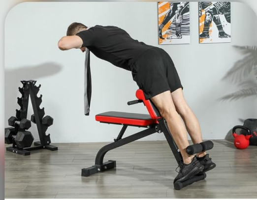
Extension du dos