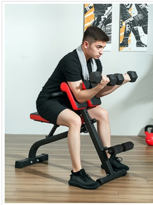
Image: A user performing bicep curls with dumbbells while seated on the bench, demonstrating its use for arm exercises.