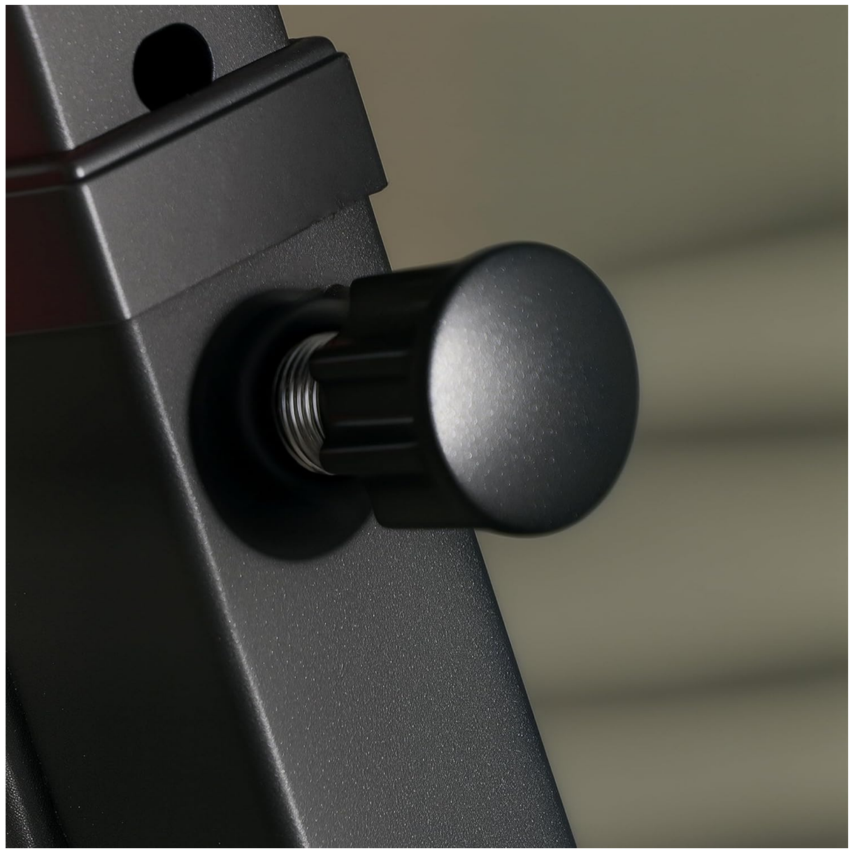
Image: A detailed view of the secure adjustment knob used to lock the cushion into one of its 8 positions, ensuring stability during workouts.