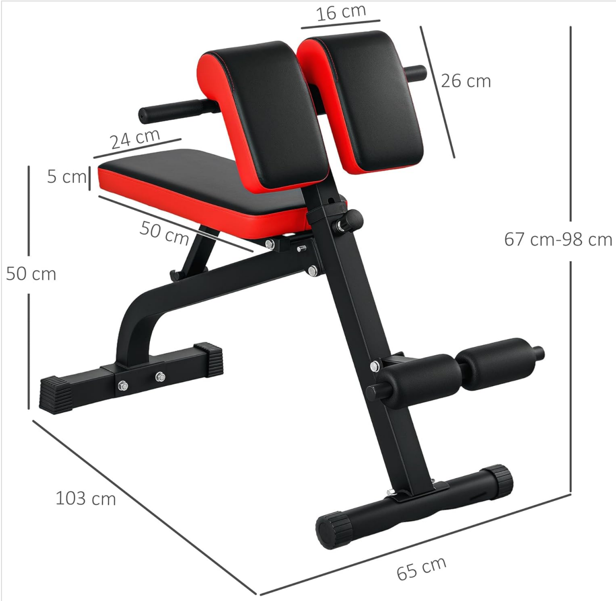
Image: Technical drawing showing the detailed dimensions of the bench, including seat width (24 cm), seat length (50 cm), backrest width (26 cm), backrest length (16 cm), overall length (103 cm), width (65 cm), and adjustable height (67-98 cm).