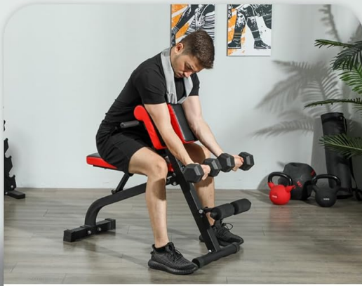
Entraînement avec haltères