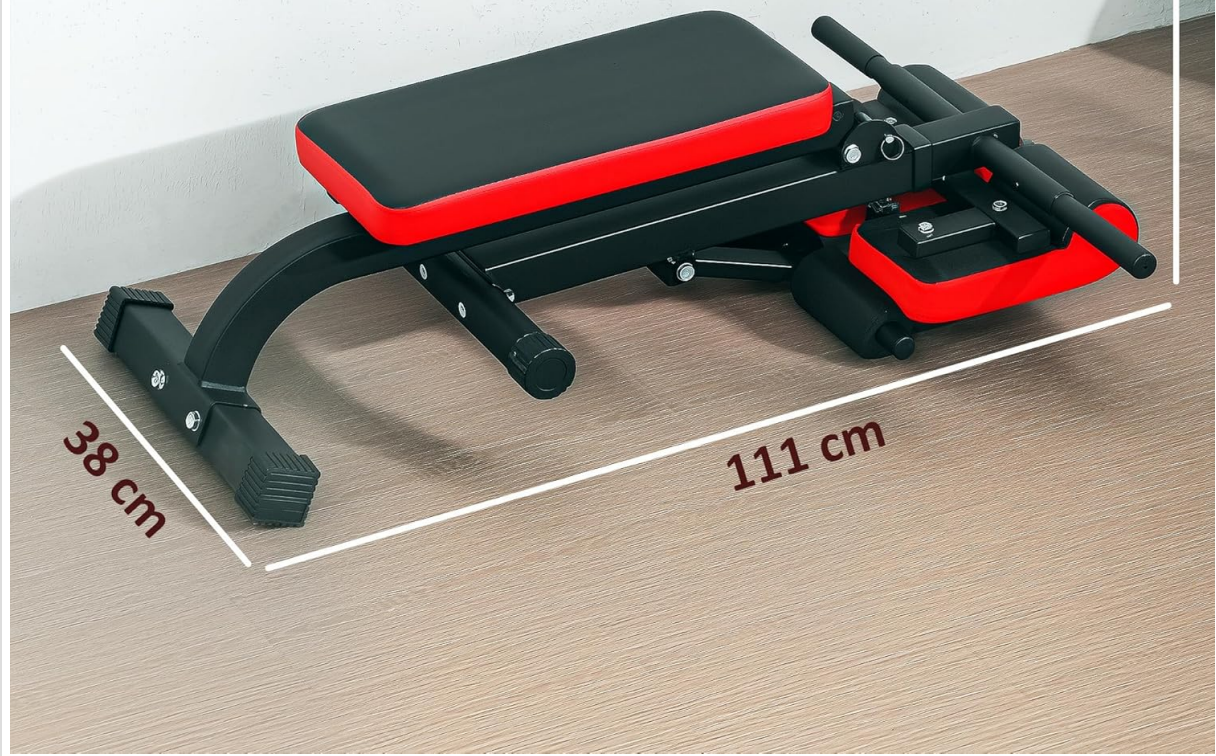
Image: The bench in its folded state, highlighting its compact dimensions (111 cm length, 38 cm width, 18 cm height) for space-saving storage.