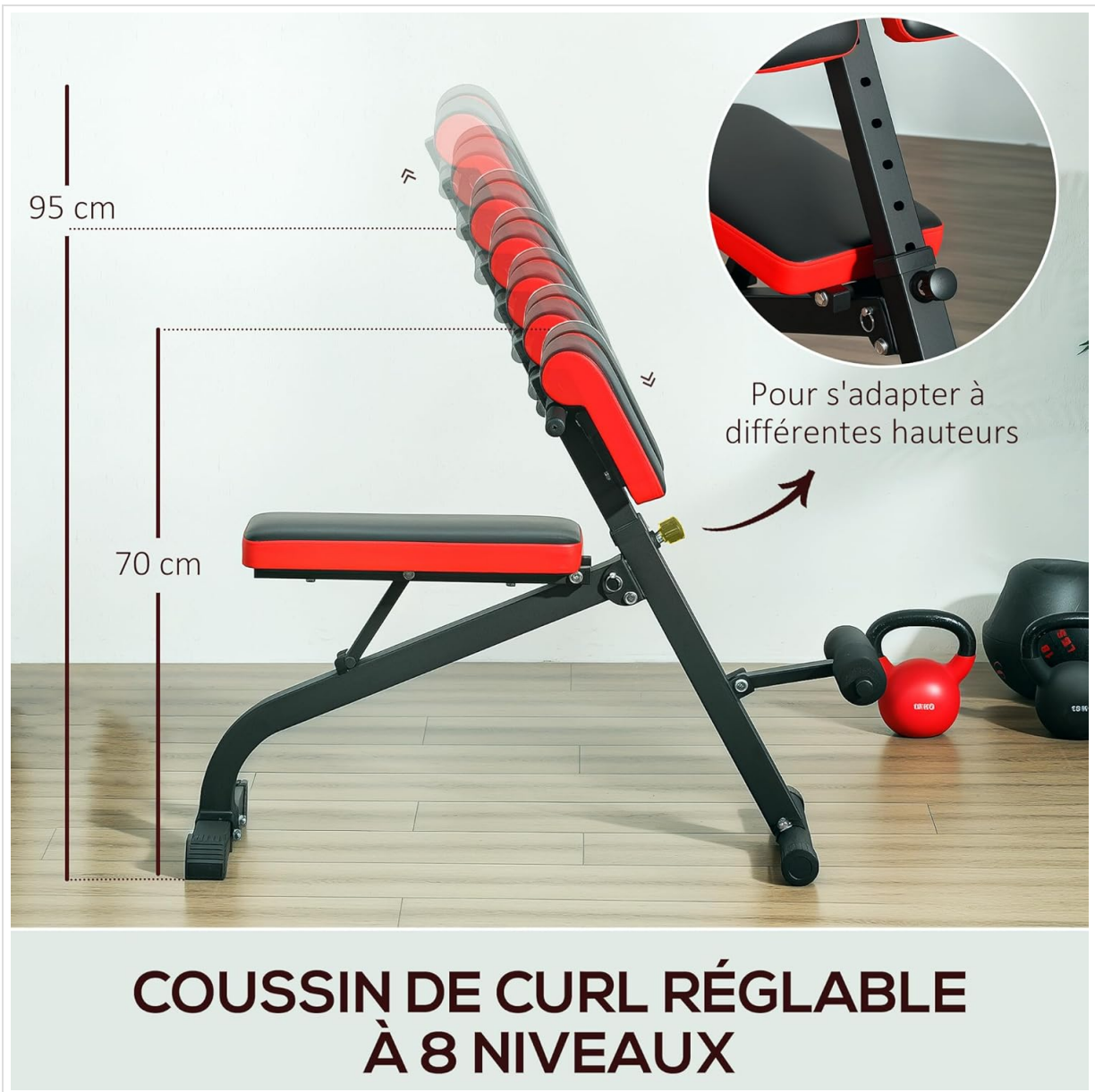
Image: Illustration of the 8-level adjustable cushion, demonstrating how the backrest can be set to different heights (from 70 cm to 95 cm) to accommodate various exercises and user heights.