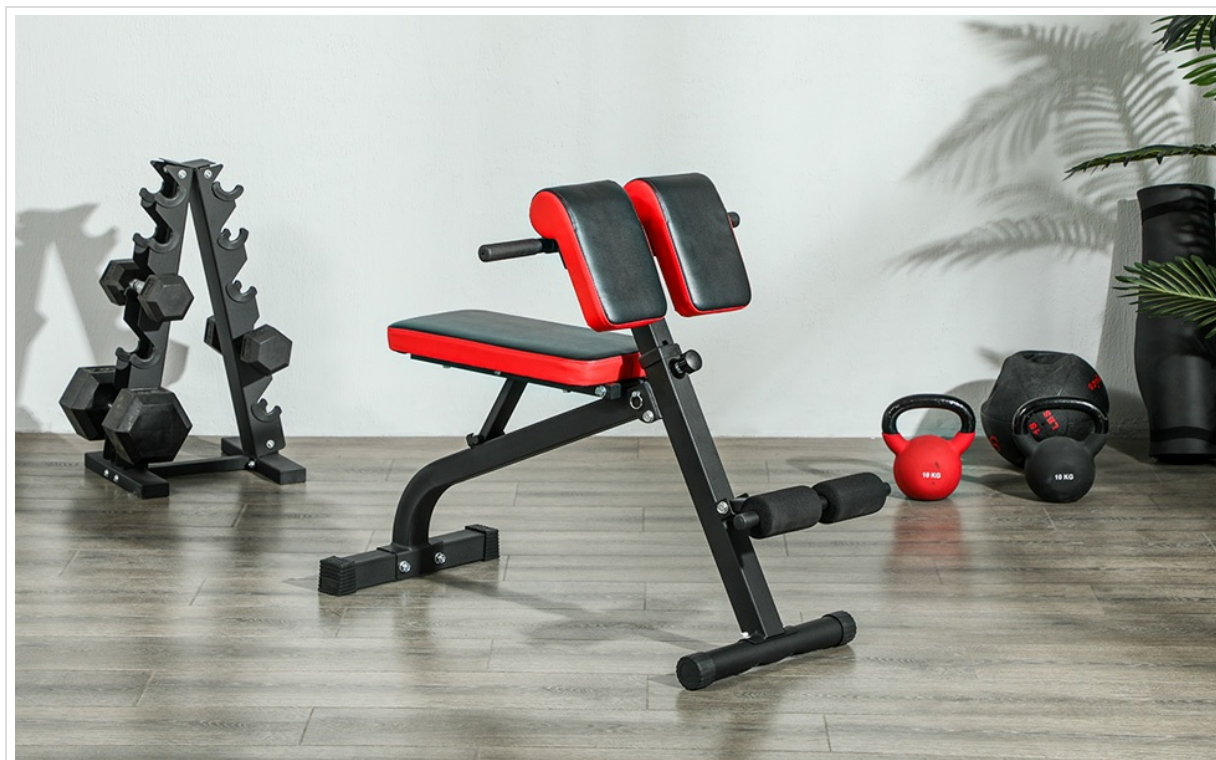
Image: The SPORTNOW Multi-Function Foldable Weight Bench displayed in a home gym environment, showcasing its design and potential use.

Upon opening the package, verify that all components are present and undamaged. If any parts are missing or damaged, please contact customer support.