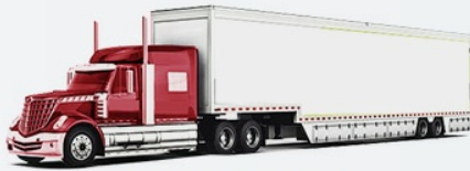
Heavy duty truck