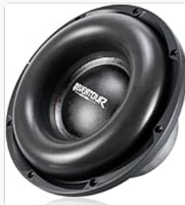
Figure 9.1: Seventour Customer Service Support Information.