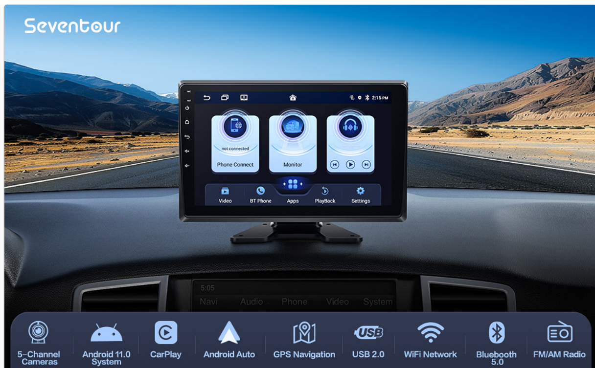
Figure 3.1: The 10.2-inch monitor interface with integrated CarPlay and Android Auto.