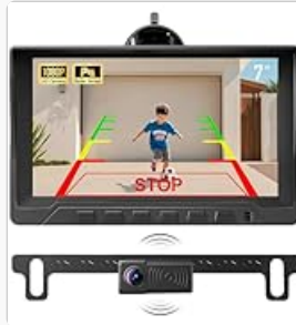
Figure 4.2: Dashboard and Overhead mounting options for the monitor.

The 10.2-inch monitor can be mounted on the dashboard using the provided bracket and adhesive, or screwed into the overhead console, depending on your vehicle's layout and preference for optimal viewing.