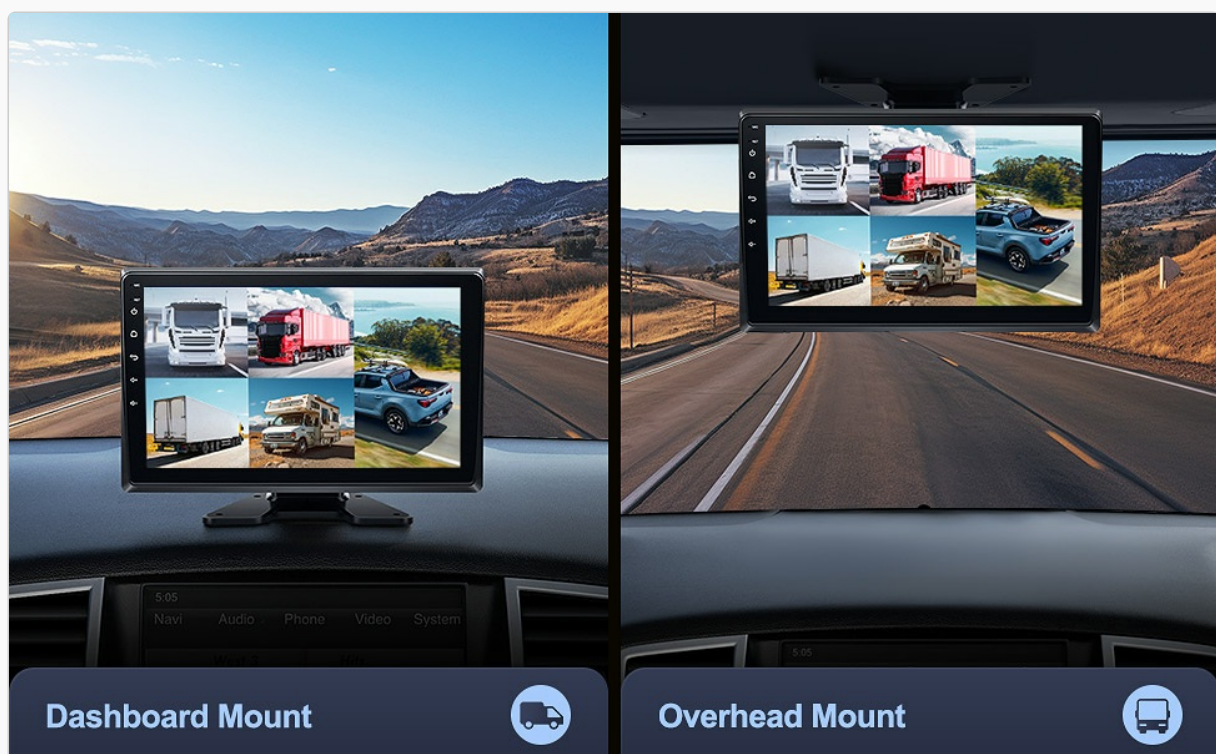
Figure 3.2: Overview of the 5-Channel Dash Cam's recording and monitoring capabilities.