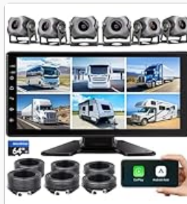
Figure 4.3: Vehicle compatibility and power supply options.

The system is compatible with 12V-24V cigarette lighter power or can be hardwired to the vehicle's ACC power supply. Ensure the power source is stable and provides adequate voltage for optimal performance.