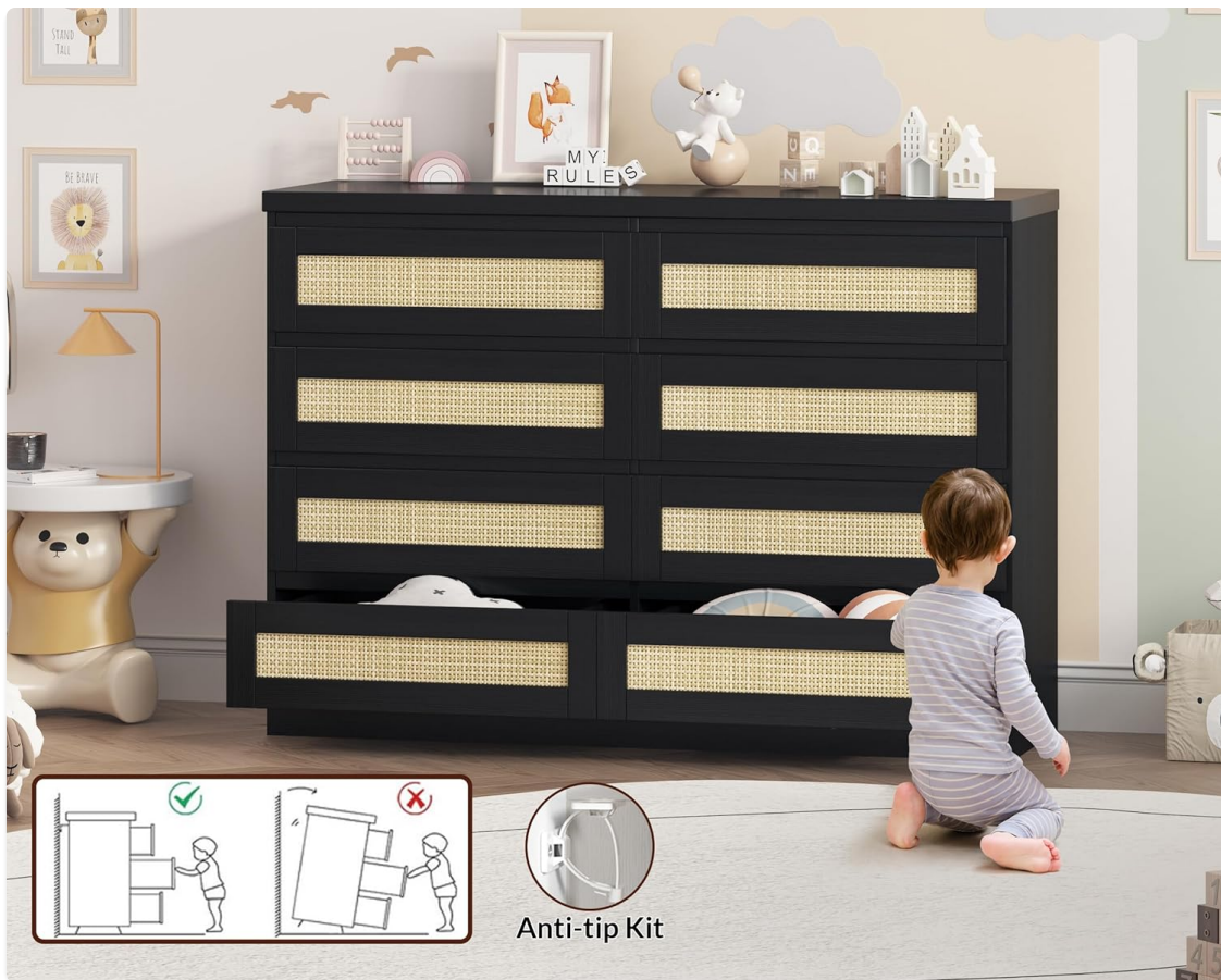
Image: A diagram illustrating the correct installation of an anti-tip kit, showing the dresser secured to the wall, and a child safely interacting with the dresser. An inset shows the anti-tip bracket.