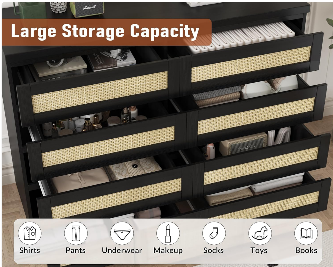
Image: The GarveeHome 8-drawer dresser with several drawers partially open, revealing organized contents such as folded clothes, accessories, and small personal items. Icons below suggest storage for shirts, pants, underwear, makeup, socks, toys, and books.