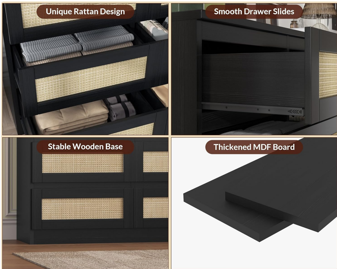
Image: A collage of four images highlighting key features: a close-up of the unique rattan drawer front, a view of smooth metal drawer slides, the stable wooden base of the dresser, and a sample of the thickened MDF board material.