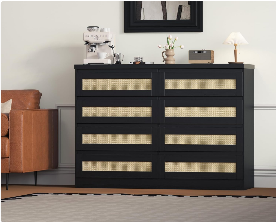
Image: The GarveeHome Rattan 8-Drawer Dresser, black with natural rattan drawer fronts, positioned in a modern living space next to a brown sofa, with decorative items on top.