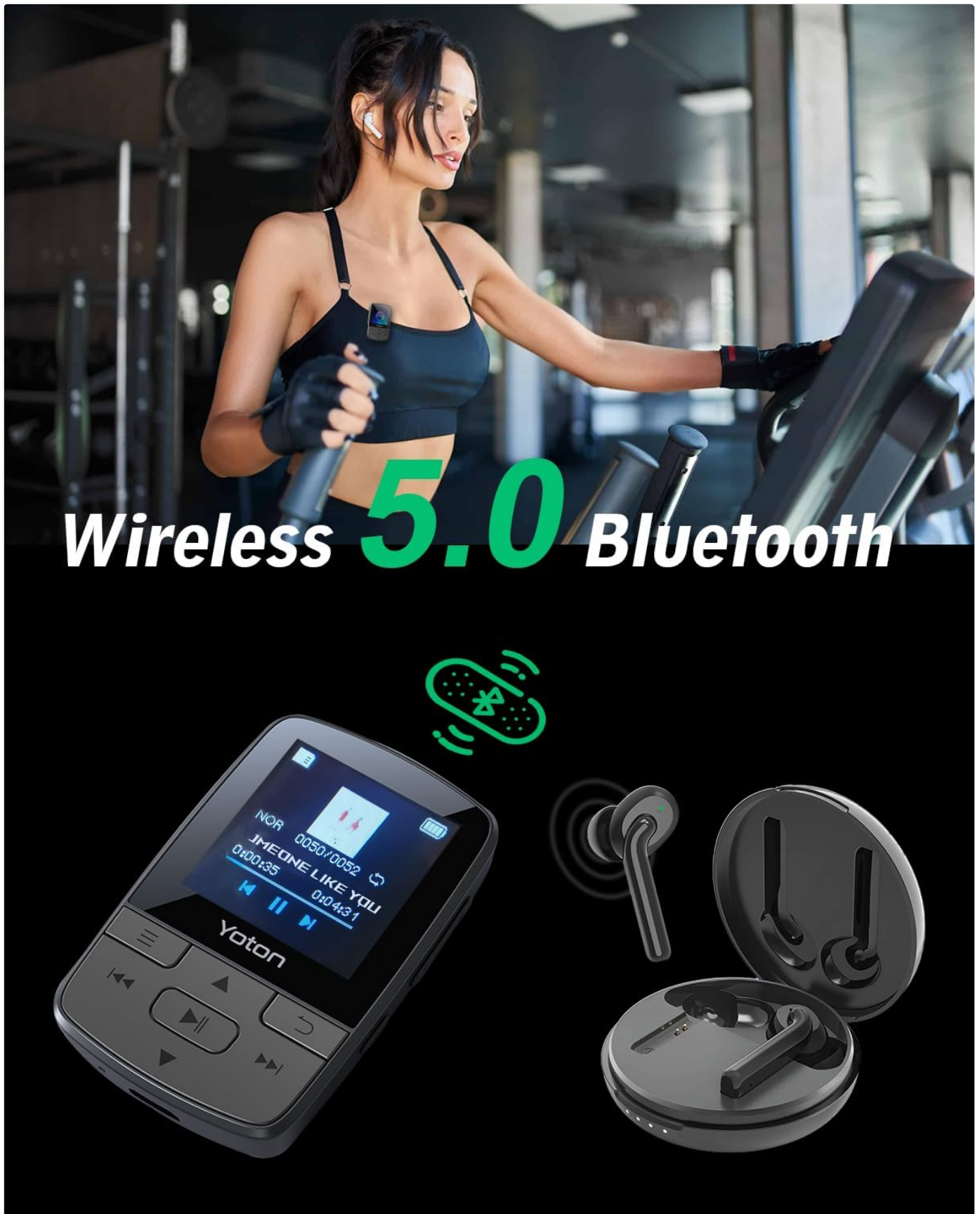
Figure 3.2: YOTON MP3 Player (YM07 model) featuring a clip-on design. This image illustrates the compact form factor and the integrated clip, making it suitable for active use.