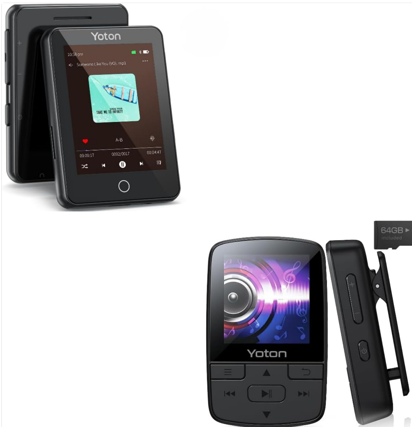
Figure 3.1: Front and side view of the YOTON MP3 Player. This image displays the device's main screen, navigation buttons, and side-mounted volume controls, highlighting its sleek, rectangular design.