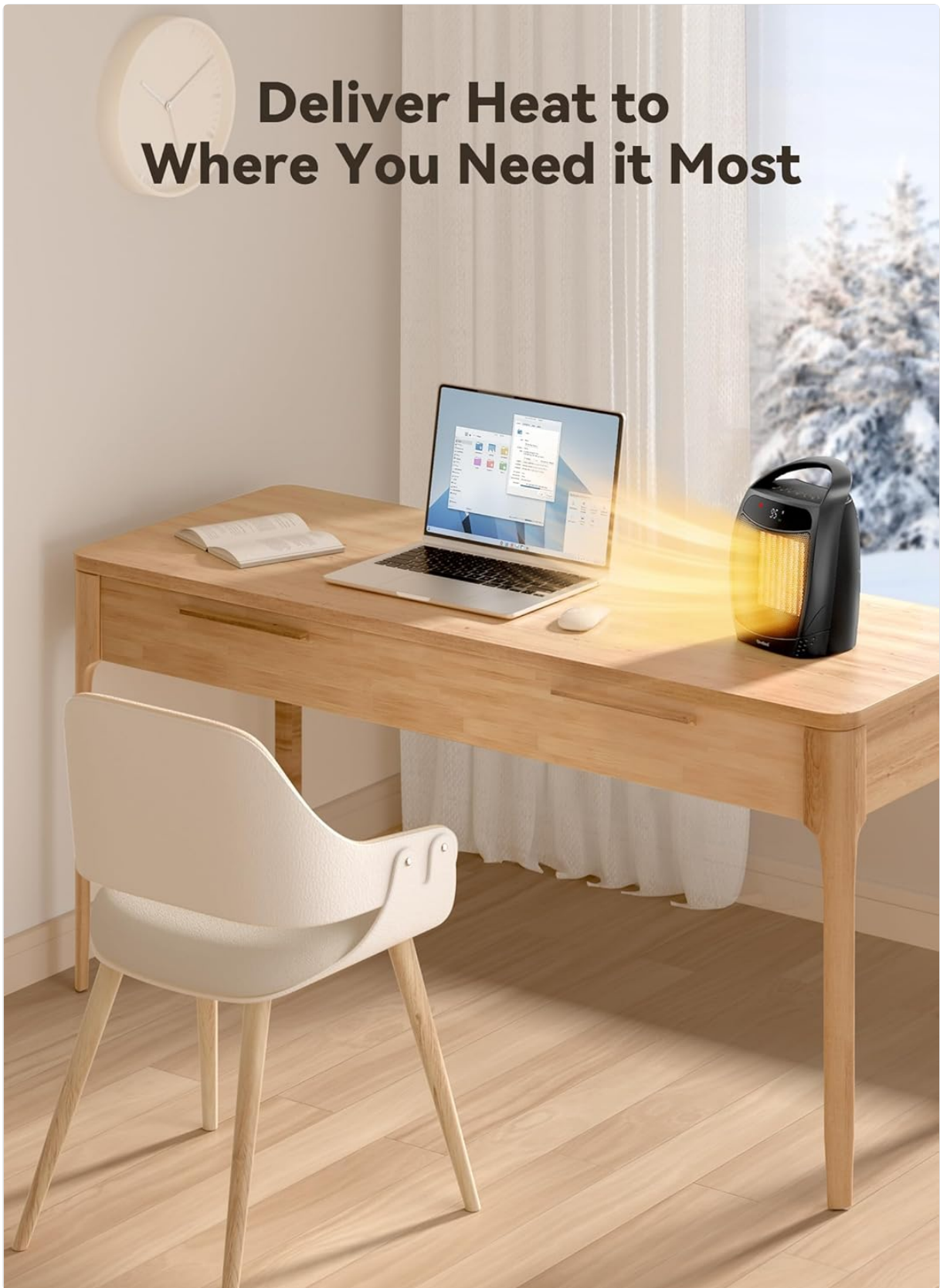
Figure 6: Heater positioned on a desk for personal warmth.