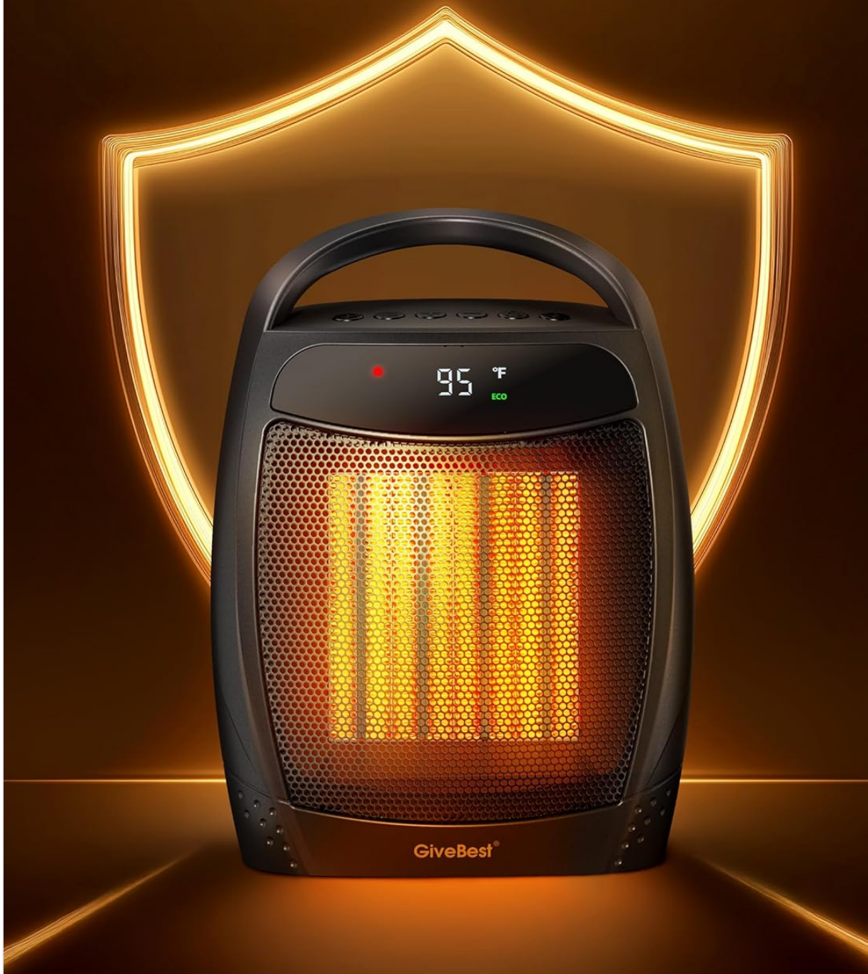
Figure 2: Top control panel and handle for easy portability.