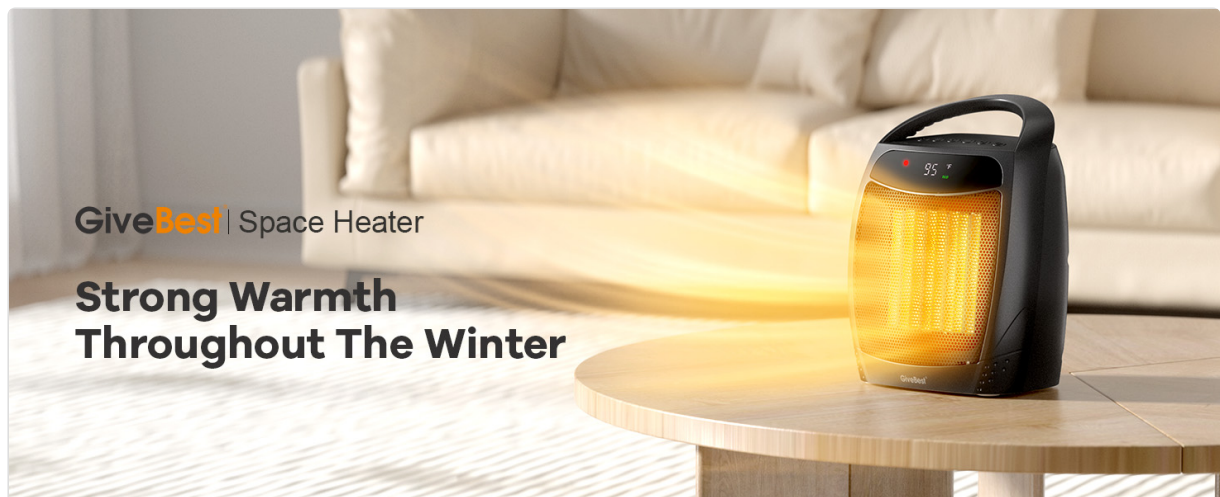
Figure 3: Illustration of the heater's rapid heating capability.

Powered by 1500W and PTC ceramic technology, this portable heater delivers instant, efficient warmth up to 200 sq.ft. Experience quick and comfortable heat exactly when you need it.