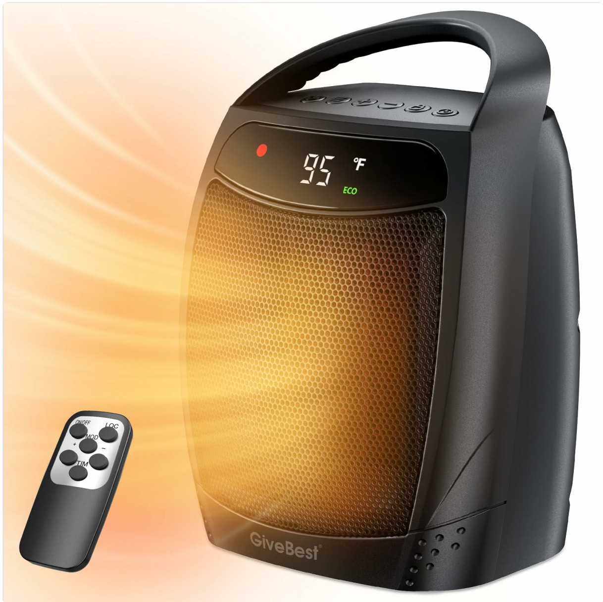
Figure 1: Front view of the GiveBest 906ES Portable Ceramic Space Heater.