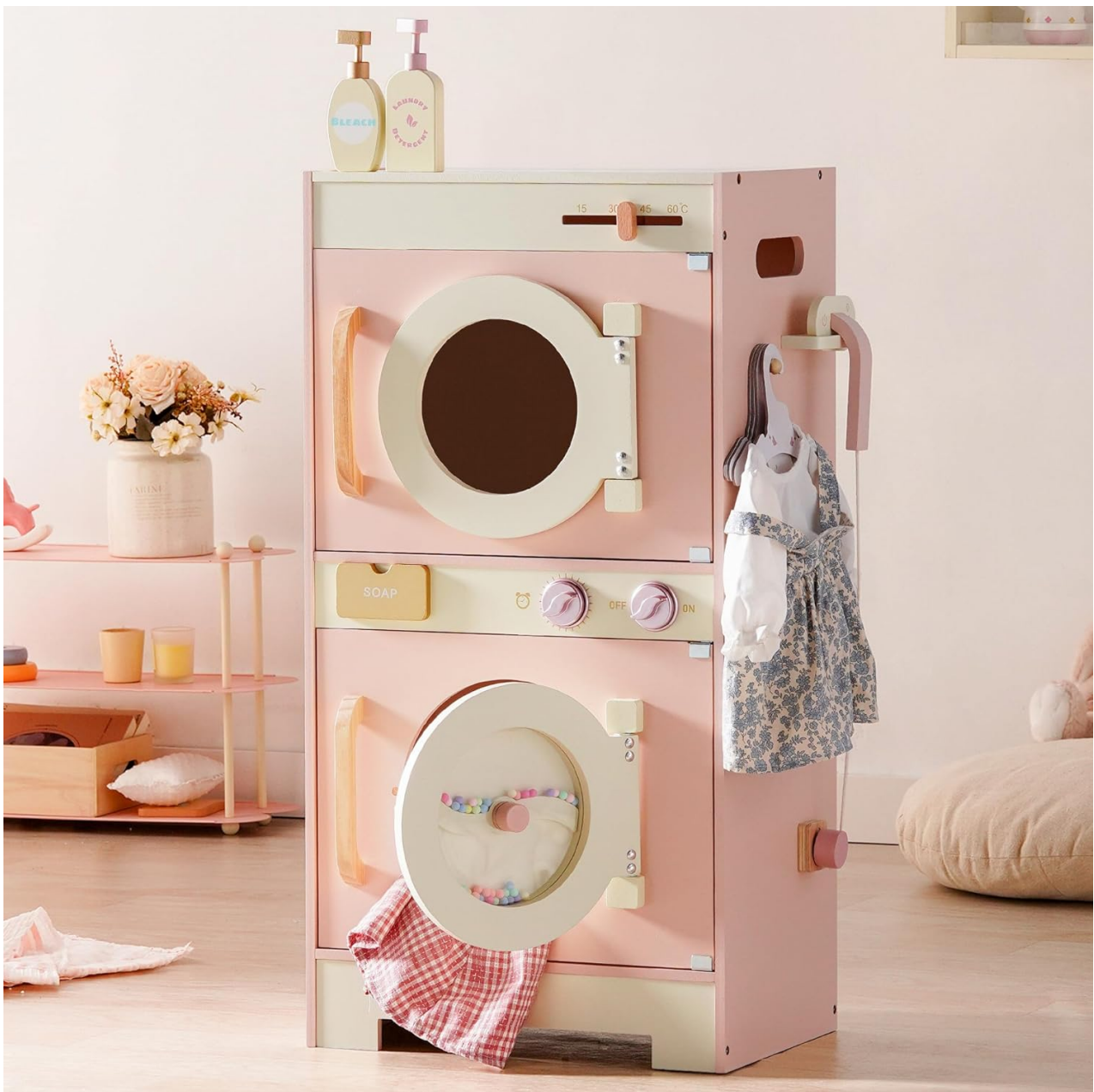
Image 1.1: Front view of the assembled ROBOTIME WCF49 Kids Wooden Washer and Dryer Playset.