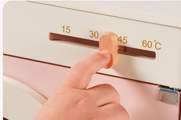
Adjust the Temperature