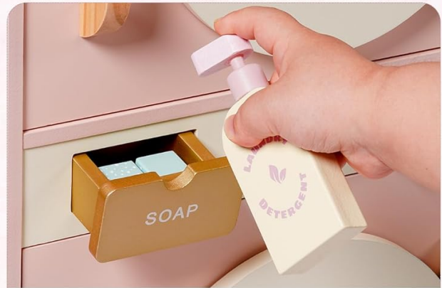
Soap Storage Box