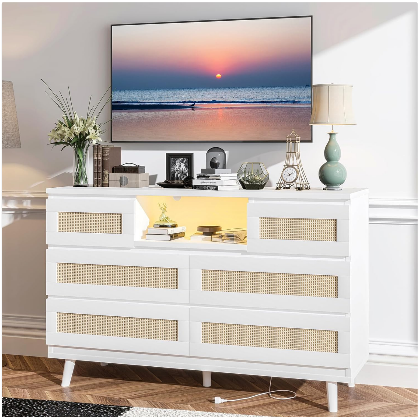
Image: The GarveeHome Rattan Dresser, a white dresser with natural rattan drawer fronts, featuring an illuminated central shelf and a flat-screen TV mounted above it, showcasing its elegant design and functionality in a living space.