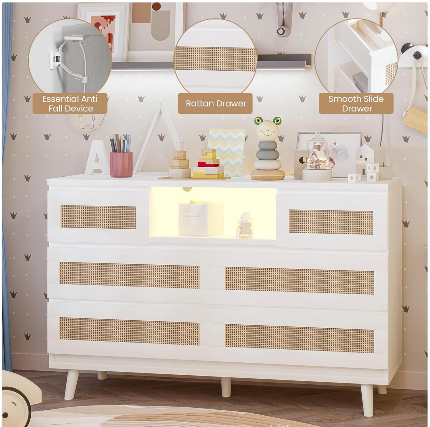
Image: A detailed view highlighting key features of the dresser: an "Essential Anti Fall Device" attached to the wall, a close-up of the "Rattan Drawer" texture, and an illustration of a "Smooth Slide Drawer" mechanism, emphasizing safety and quality.