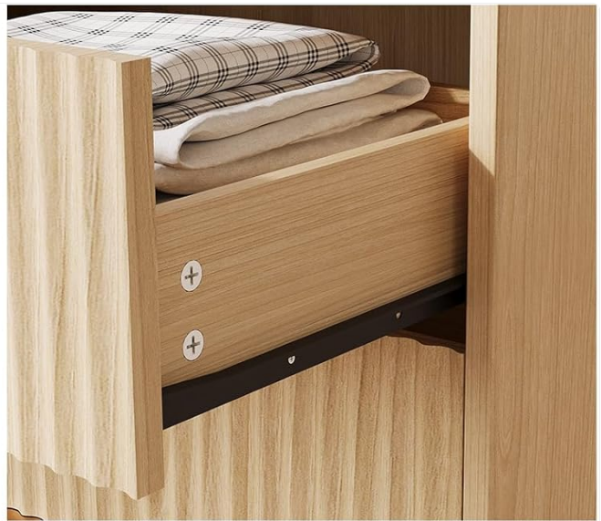
Fluted Panel Design & Blister Molded Surfaces