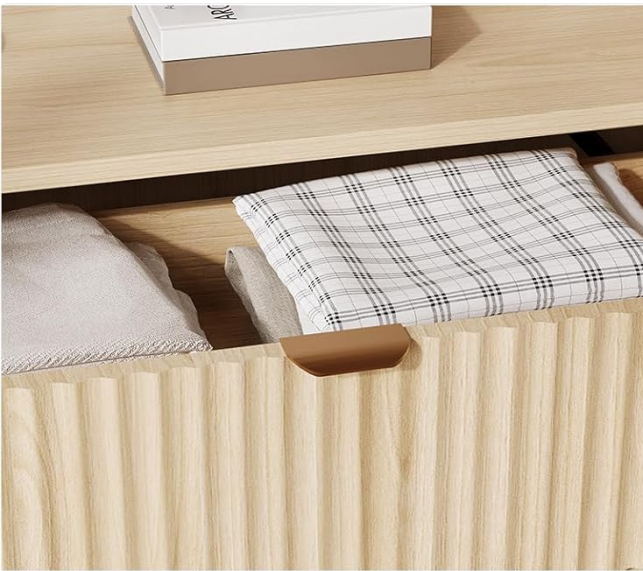
Chic Metal Handle