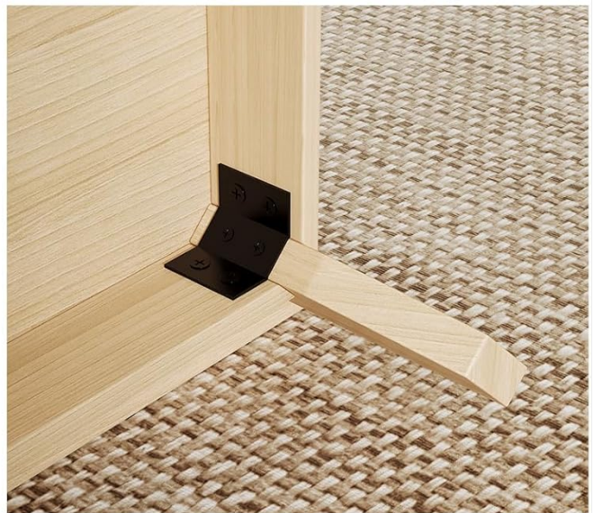
Bottom Reinforced with Steel

Image: Dresser in use, demonstrating its storage capacity.