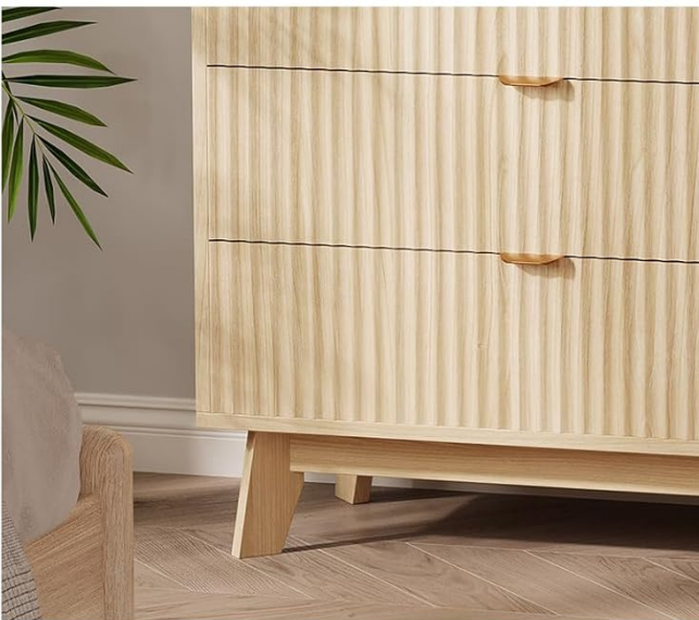
Sturdy Wood Legs