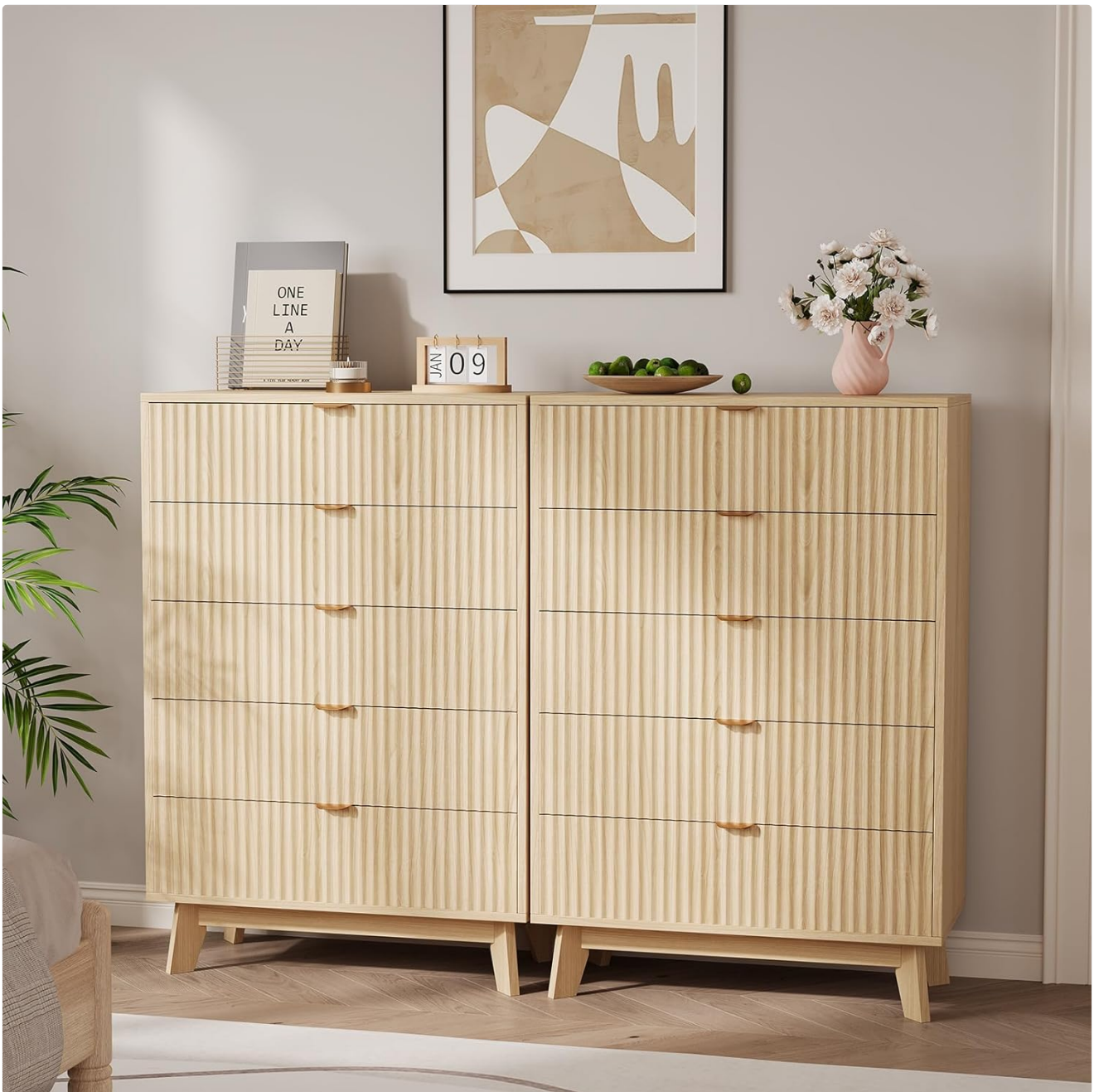
Image: Two Garvee 5-Drawer Dressers, demonstrating their elegant design and how they can be paired.