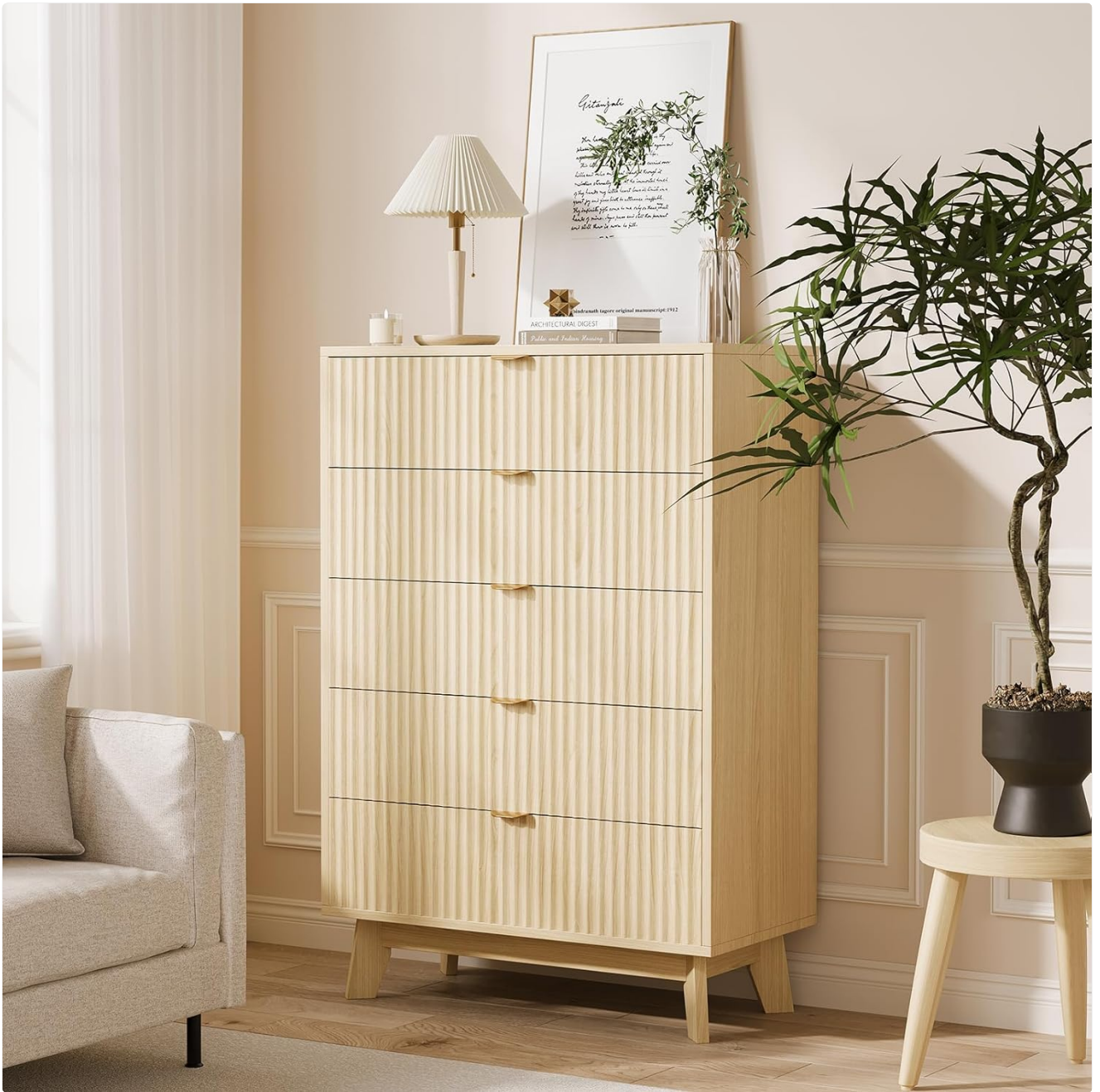
Image: Garvee 5-Drawer Dresser integrated into a living room environment.