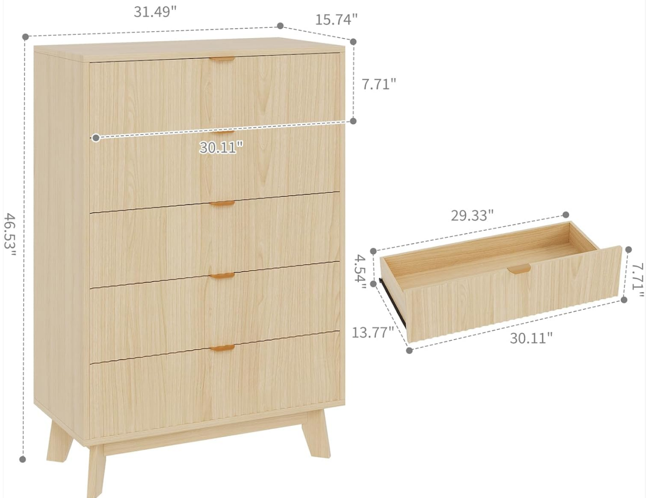
Image: Comprehensive dimensions of the dresser and its drawers.