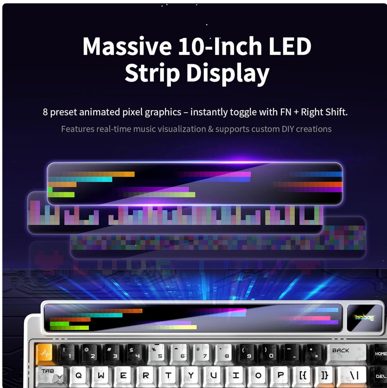
Figure 5: The large LED strip display for animations and music visualization.