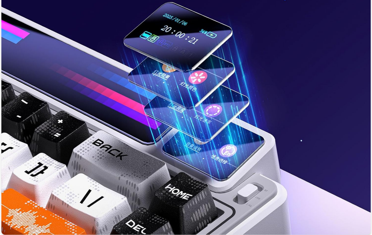
Figure 6: The smart digital screen displaying various keyboard statuses.

*Play Your Style*: Upload custom GIFs to showcase personality while you work or game.