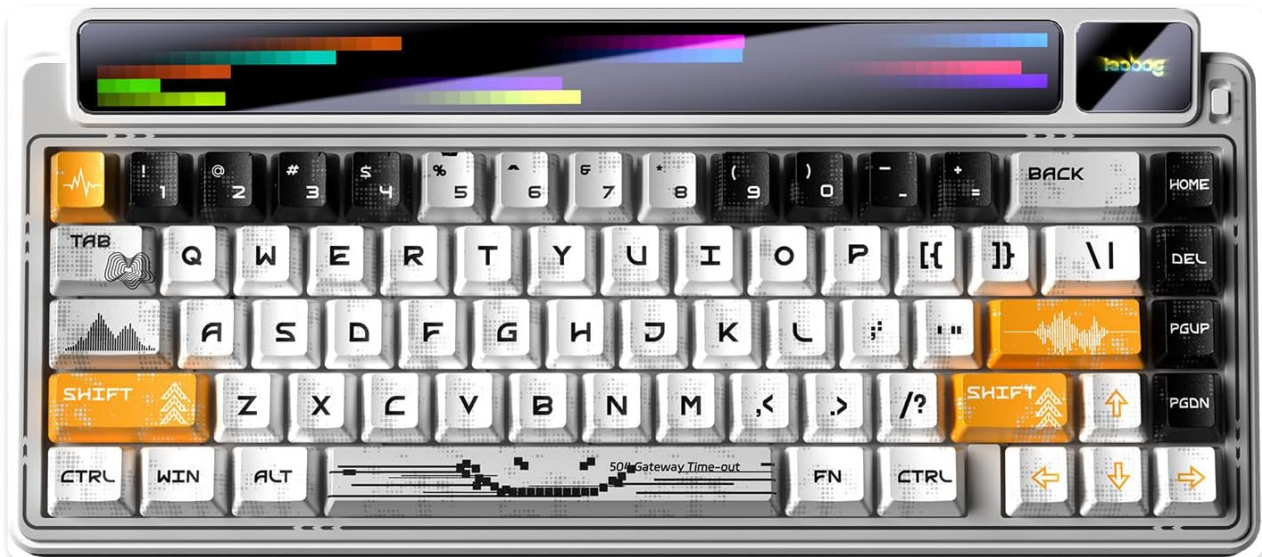
Figure 1: LEOBOG AMG65 Mechanical Gaming Keyboard Overview.

The LEOBOG AMG65 is a high-performance 65% mechanical gaming keyboard designed for enthusiasts and gamers seeking advanced features and customization. It boasts a unique dual-screen display, versatile tri-mode connectivity, hot-swappable switches, and dynamic RGB backlighting, providing a superior typing and gaming experience across various platforms.