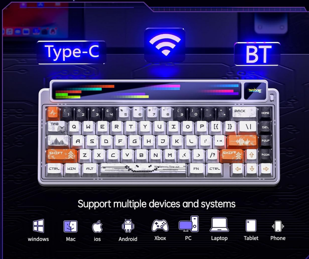
Figure 4: Visual representation of the three connection modes.

BT5.0/2.4G/Type-C Wired, Up to 5 Devices