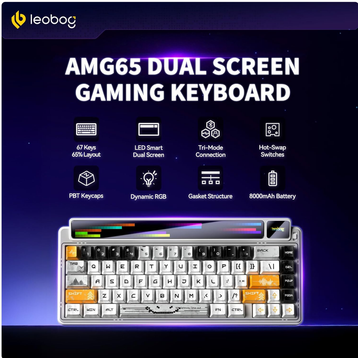
Figure 2: Included components with the LEOBOG AMG65 keyboard.