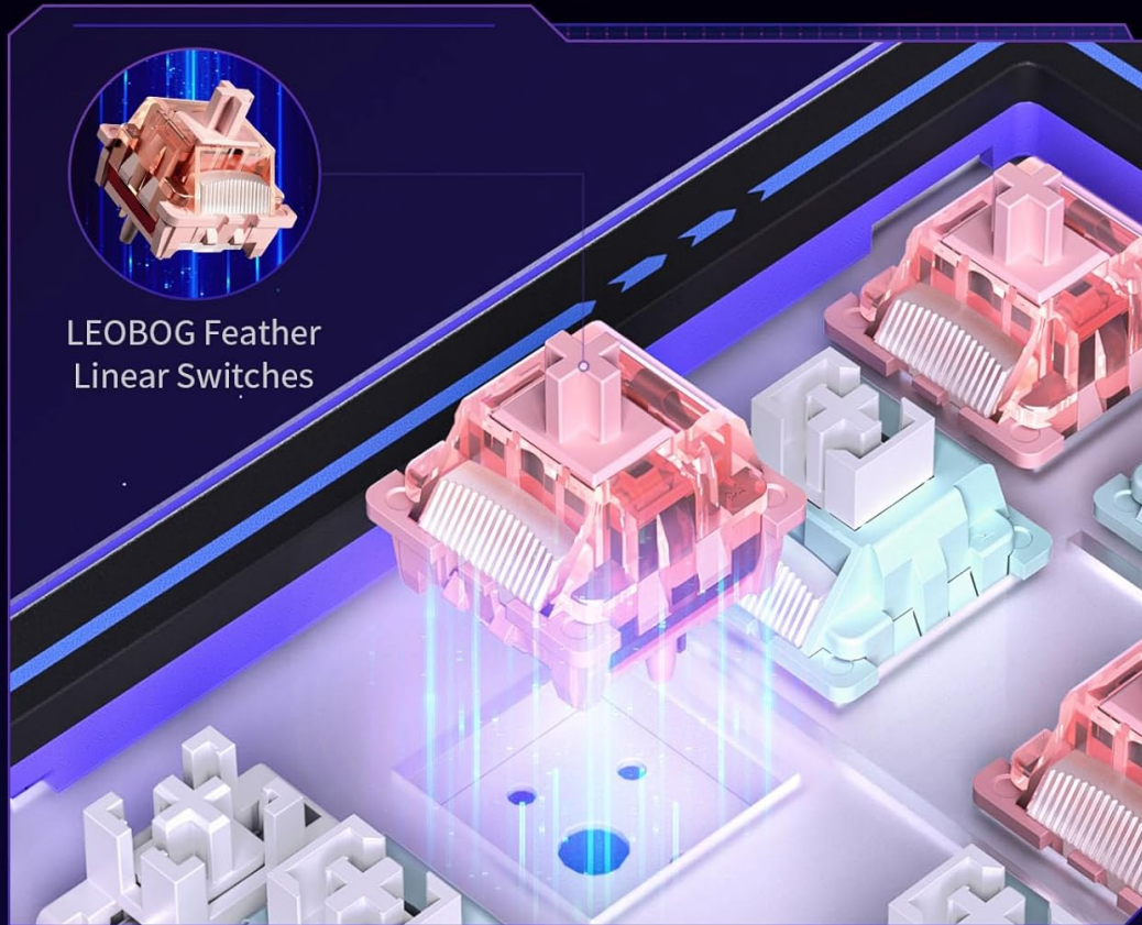
Figure 8: Illustration of the hot-swappable switch design.

For full customization, including designing pixel animations, uploading GIFs, creating macros, and setting sleep timers, download the official driver software. Please note that the driver software currently supports Windows systems only and requires a wired connection for certain functions like animation uploads.