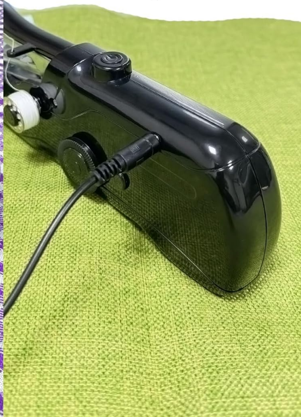
Image: The bottom of the sewing machine showing the battery compartment and the USB power input port.