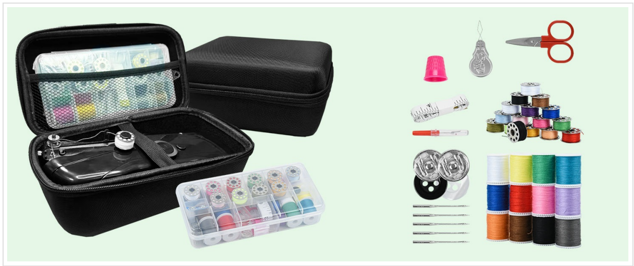
Image: A collection of sewing accessories provided with the machine, neatly arranged.