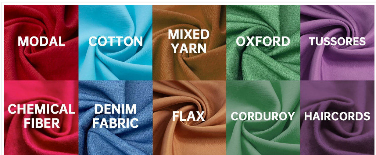
Image: A visual representation of different fabric materials compatible with the Aovly MINI Handheld Sewing Machine.

The machine is suitable for various fabric types, including modal, cotton, mixed yarn, oxford, tussore, chemical fiber, denim, flax, corduroy, and haircords.