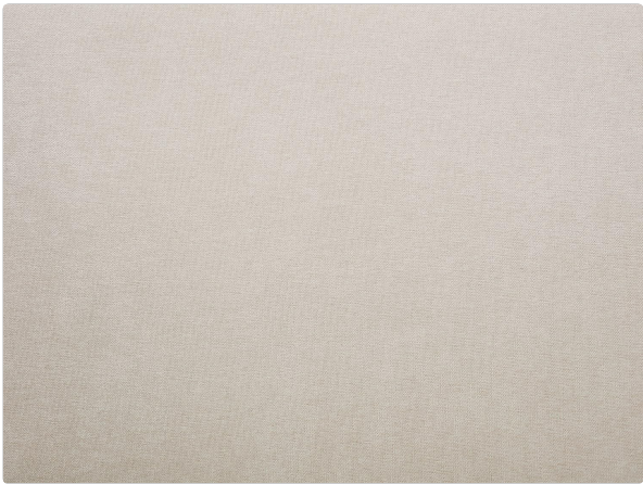
Image: A close-up view of the beige polyester fabric, highlighting its texture and weave.