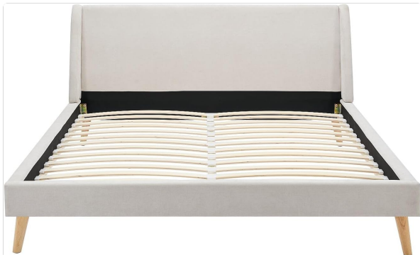
Image: Side view of the BENEDICTE bed frame, showing the headboard, side rails, and wooden slatted base.

Before assembly, verify that all components listed below are present and undamaged. If any parts are missing or damaged, please contact customer support.