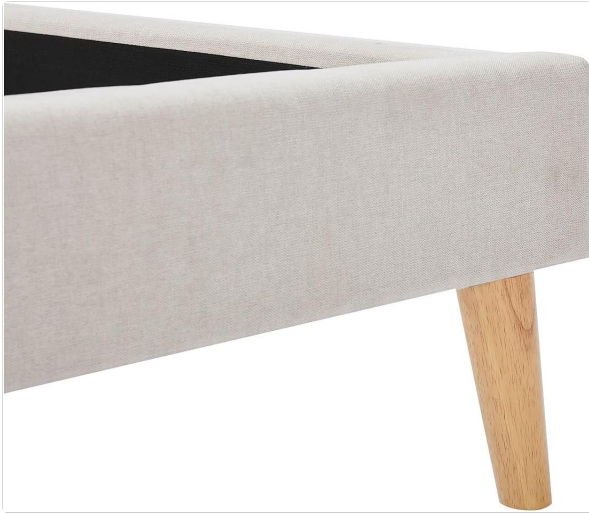
Image: A detailed shot of one of the wooden bed legs and the textured beige fabric covering the bed frame.