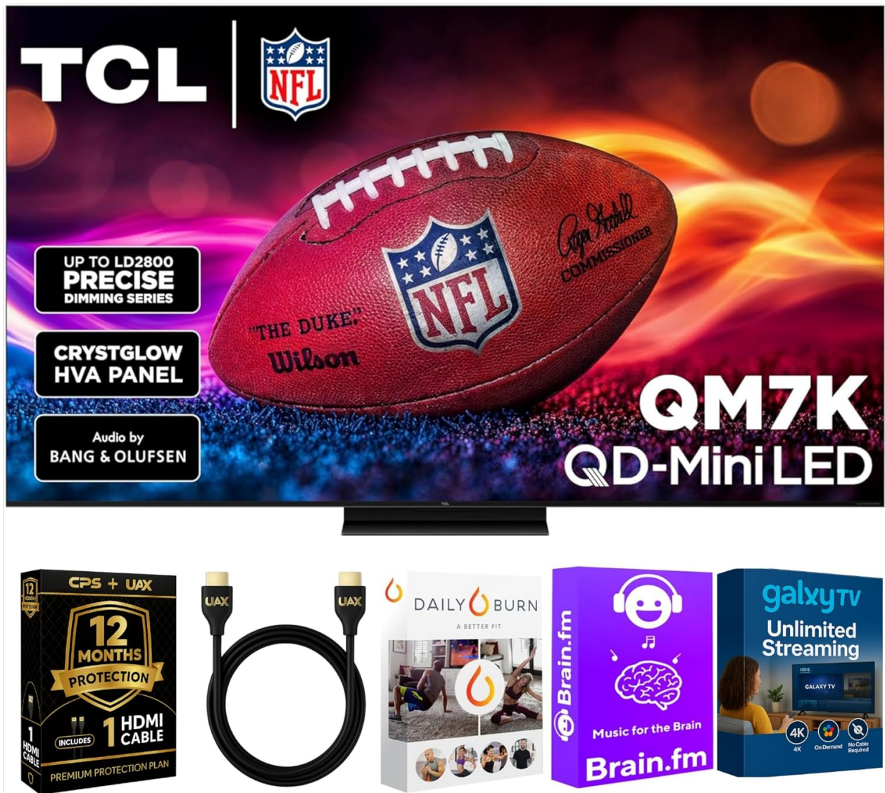
Image 1.1: The TCL 65-Inch QM7K QD MiniLED Smart GoogleTV, showcasing its design and the bundled accessories including an HDMI cable and protection plan information.