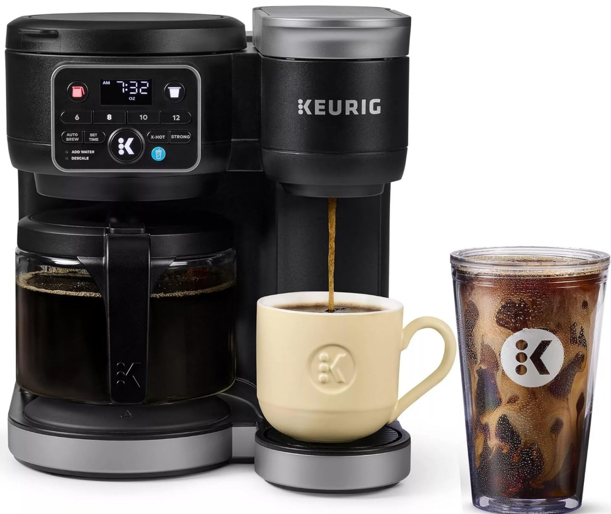
Image 1.1: The Keurig K-Duo coffee maker, demonstrating its dual brewing capabilities for hot and iced coffee.