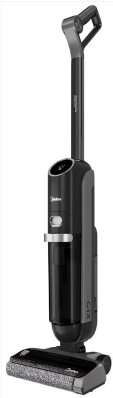
Image: Side view of the Midea X10 vacuum cleaner, highlighting the clean and dirty water tanks, and the handle design.