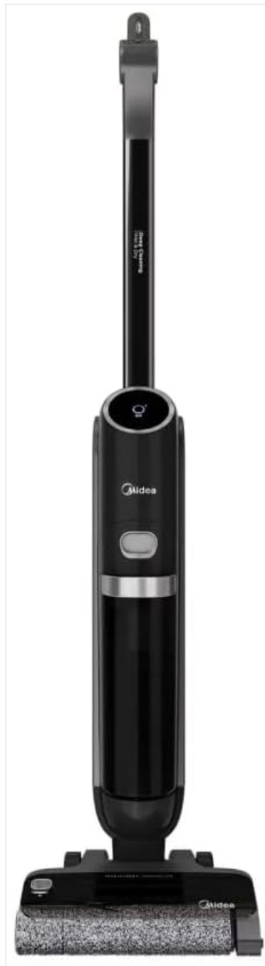
Image: Front view of the Midea X10 vacuum cleaner, showing the main body, handle, and brush head.