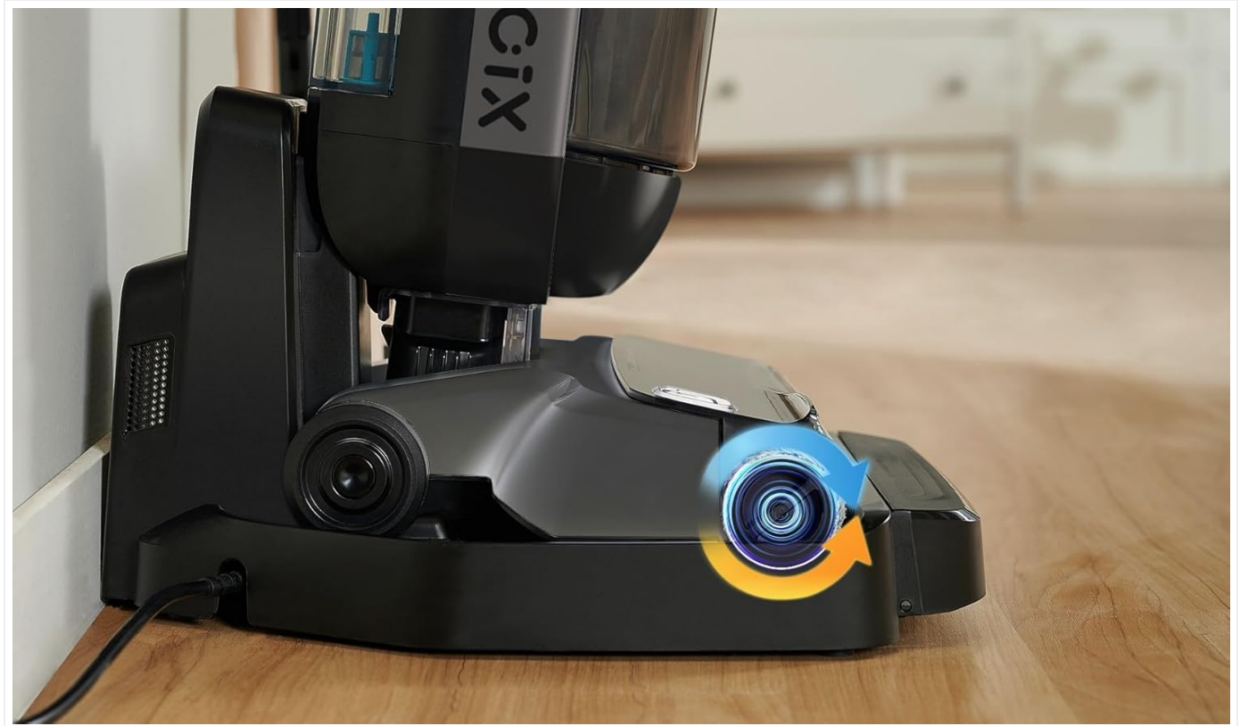
Image: The Midea X10 vacuum cleaner docked on its charging base, connected to power.