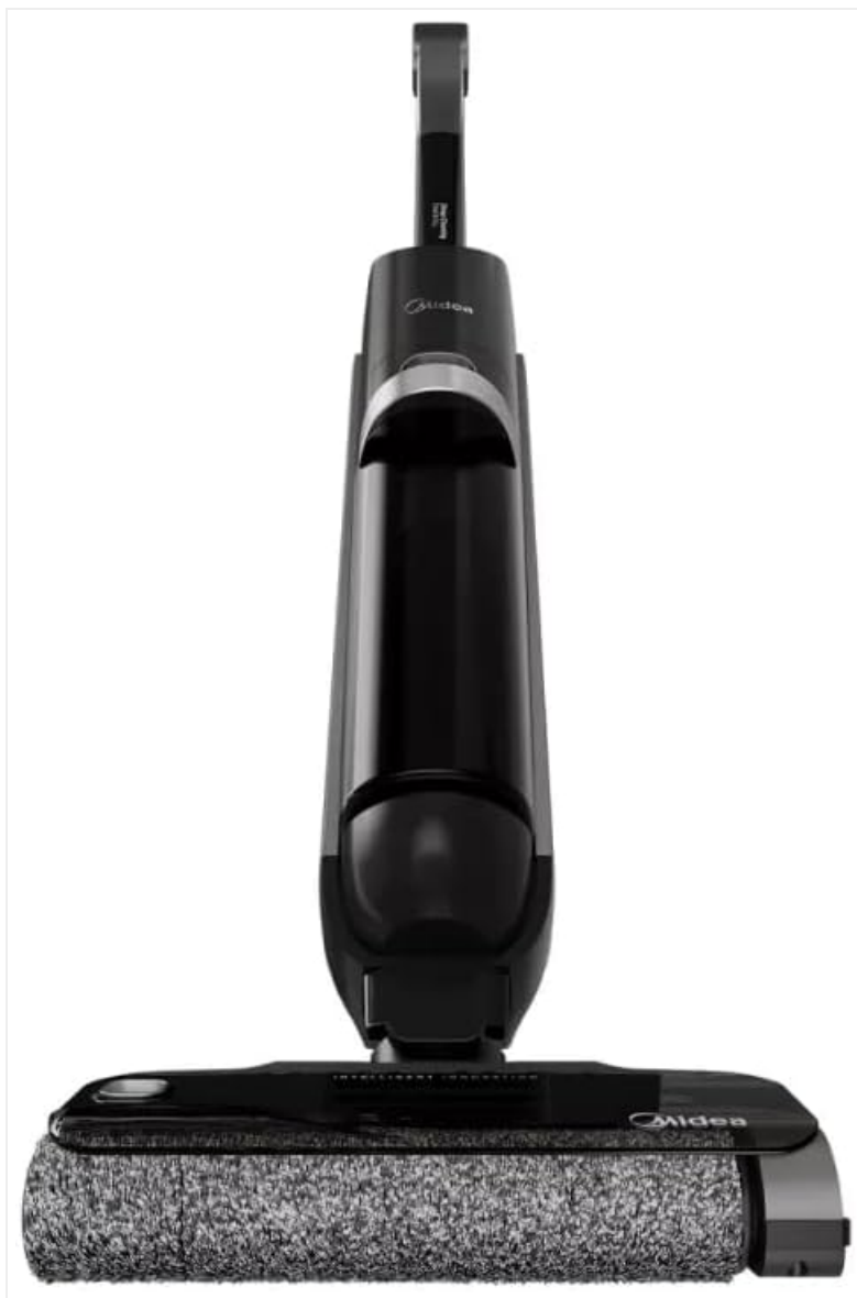
Image: Top-down view of the Midea X10 brush head, showing the roller brush and its cover.