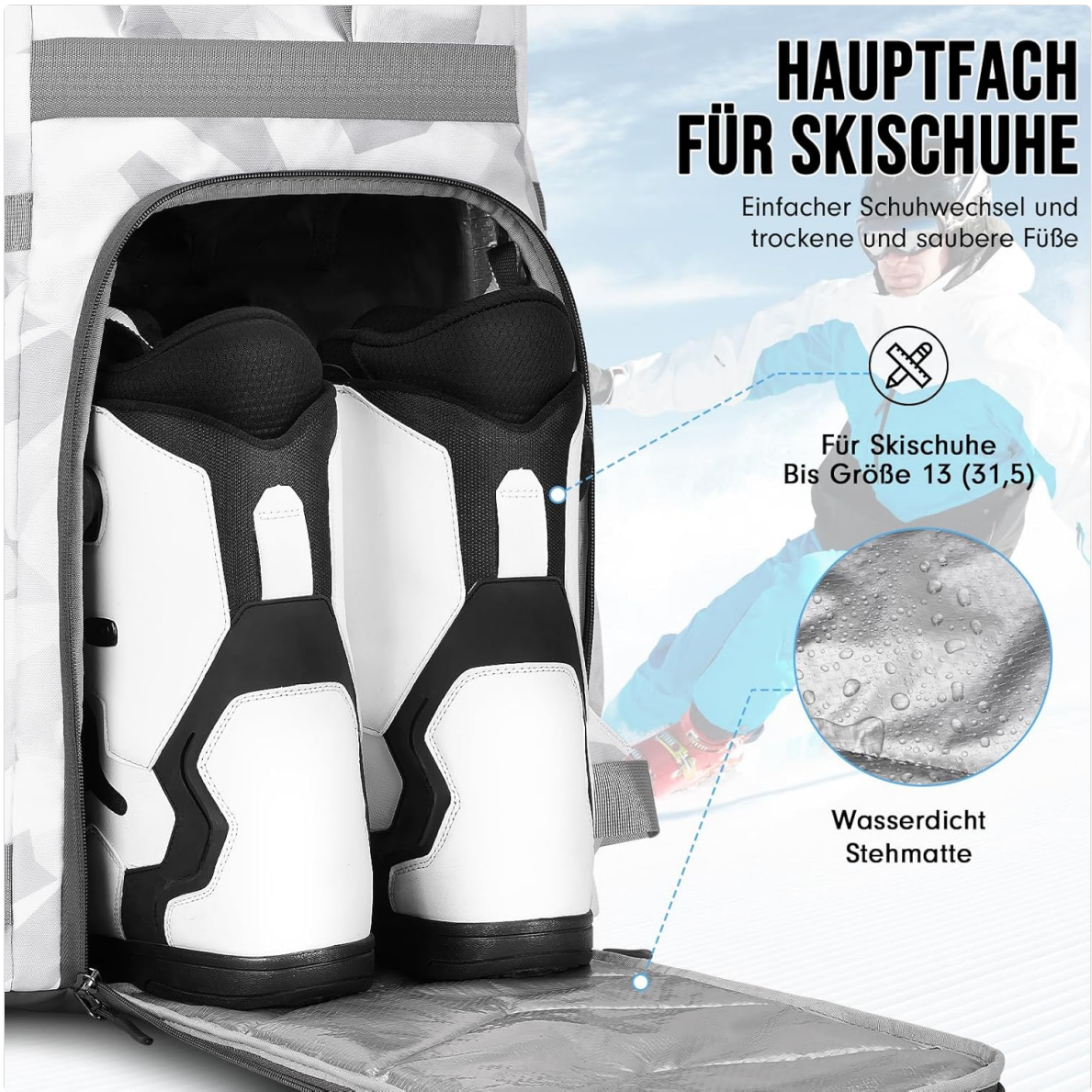
Image: A close-up view of the main boot compartment, showing ski boots placed inside and highlighting the waterproof standing mat for easy boot changes and dry feet.