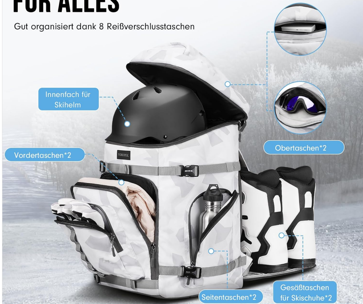
Image: An exploded view diagram illustrating the various compartments of the bag, including the internal helmet compartment, two front pockets, two side pockets, two top pockets, and two boot compartments.

Gut organisiert dank 8 Reißverschlusstaschen