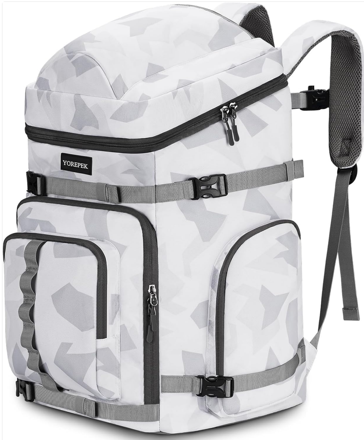
Image: The YOREPEK 65L Ski and Snowboard Boot Bag, showcasing its overall design and multiple external pockets.