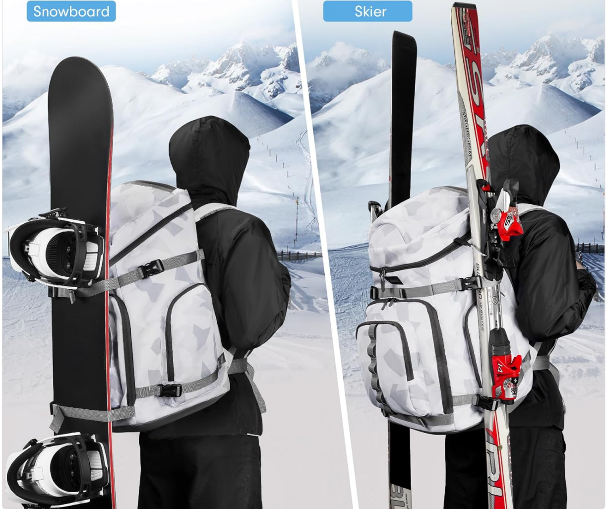
Image: A visual demonstration of the bag's hands-free carrying capability, showing a person with a snowboard attached to one side and skis attached to the other, against a snowy mountain backdrop.