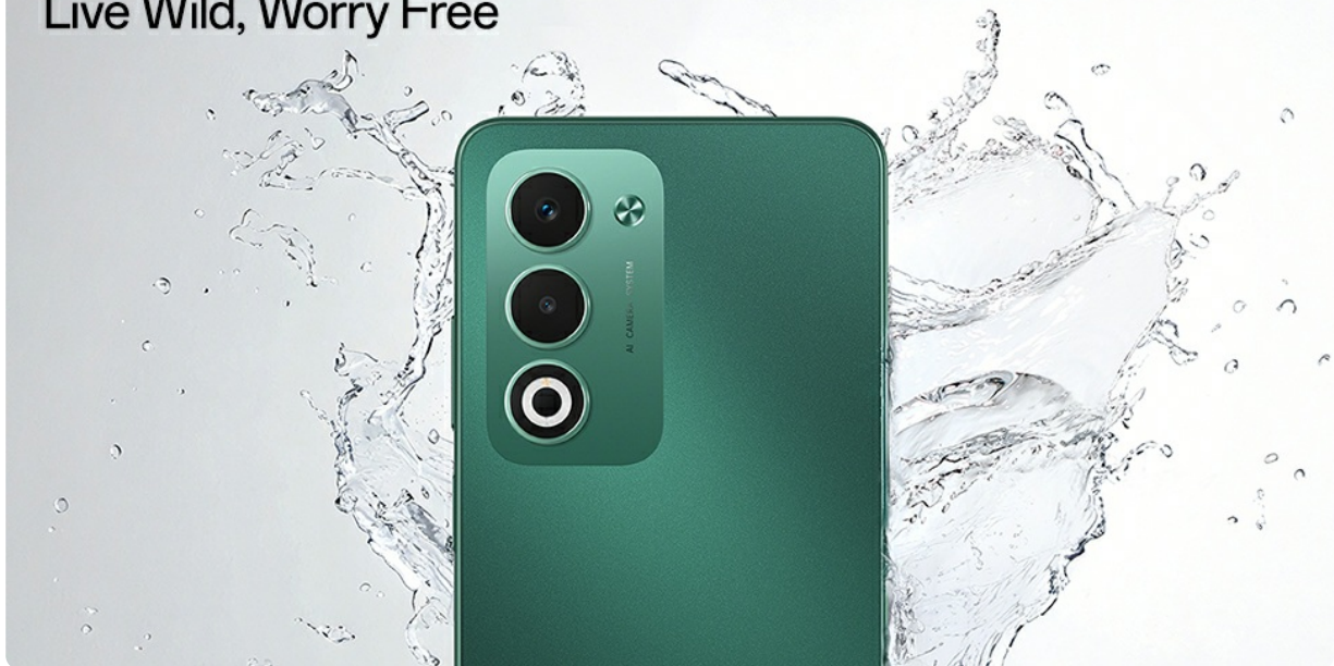
Image: The OPPO A5 5G being splashed with water, illustrating its IP65 water and dust resistance.