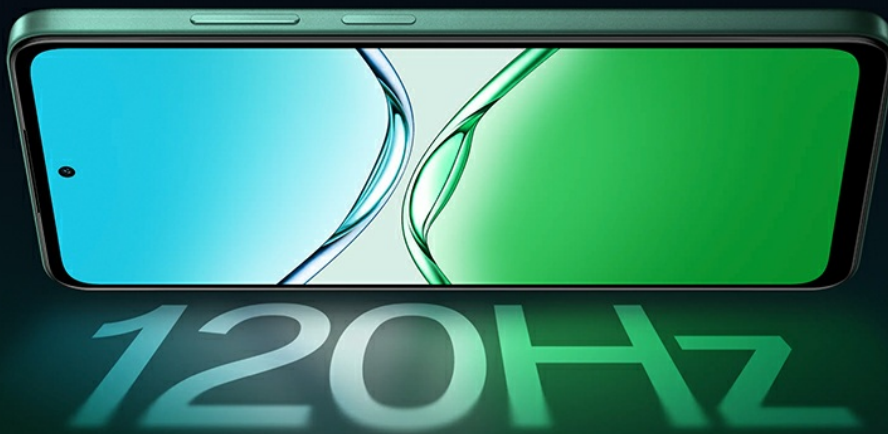
Image: The OPPO A5 5G showcasing its 120Hz Ultra Bright Display with vibrant colors.