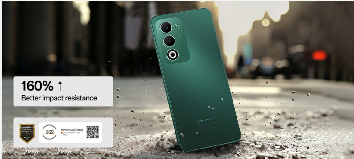
Image: The OPPO A5 5G demonstrating its robust 360° Armour Body, designed for impact resistance.