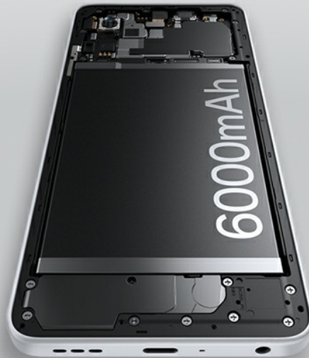
Image: Internal view of the OPPO A5 5G highlighting the large 6000mAh battery.