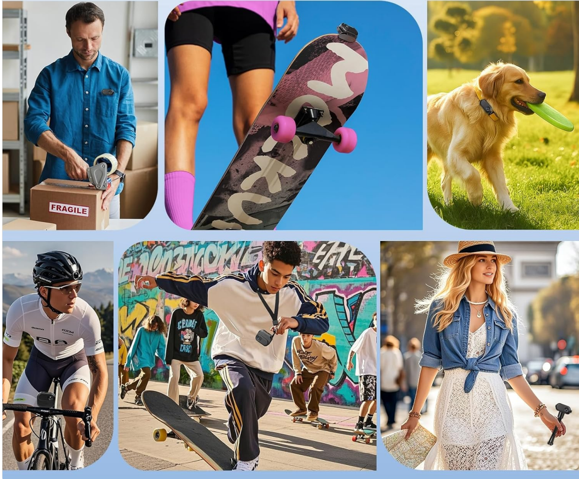
Figure 3.1: Examples of how to carry the camera using the magnet pendant, clip, or tripod.