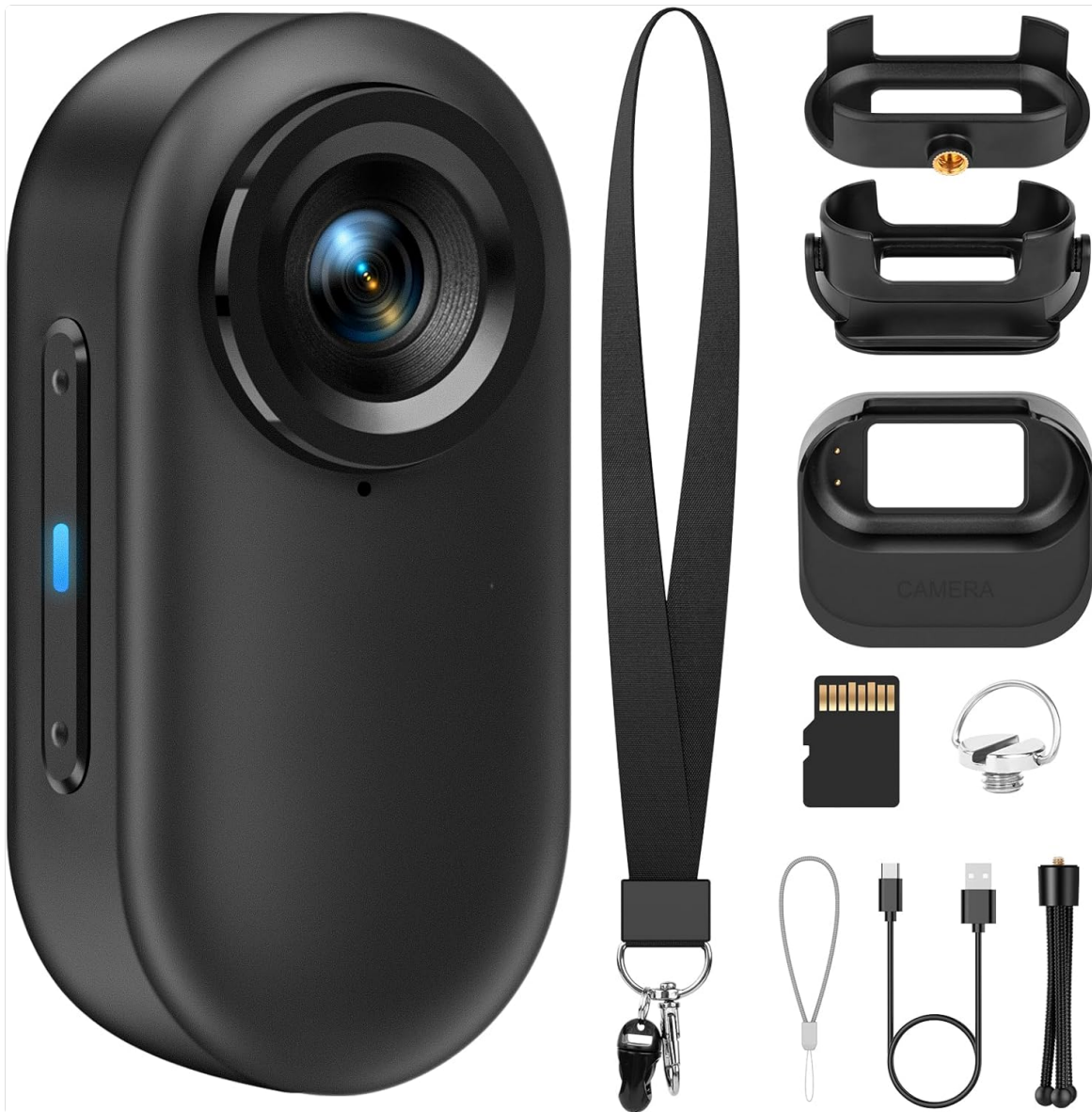
Figure 1.1: The rgjzkgm 1080P FHD Mini Body Camera shown with its various accessories, including the charging case, lanyard, clips, and tripod.