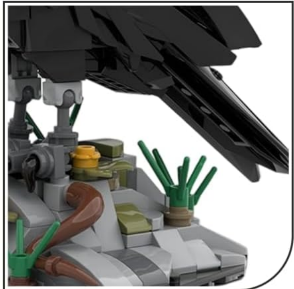
Image 4: Detailed close-up views of the Raven Bird model. This composite image shows the head, wing texture, and the base with its intricate elements, highlighting the brick construction.