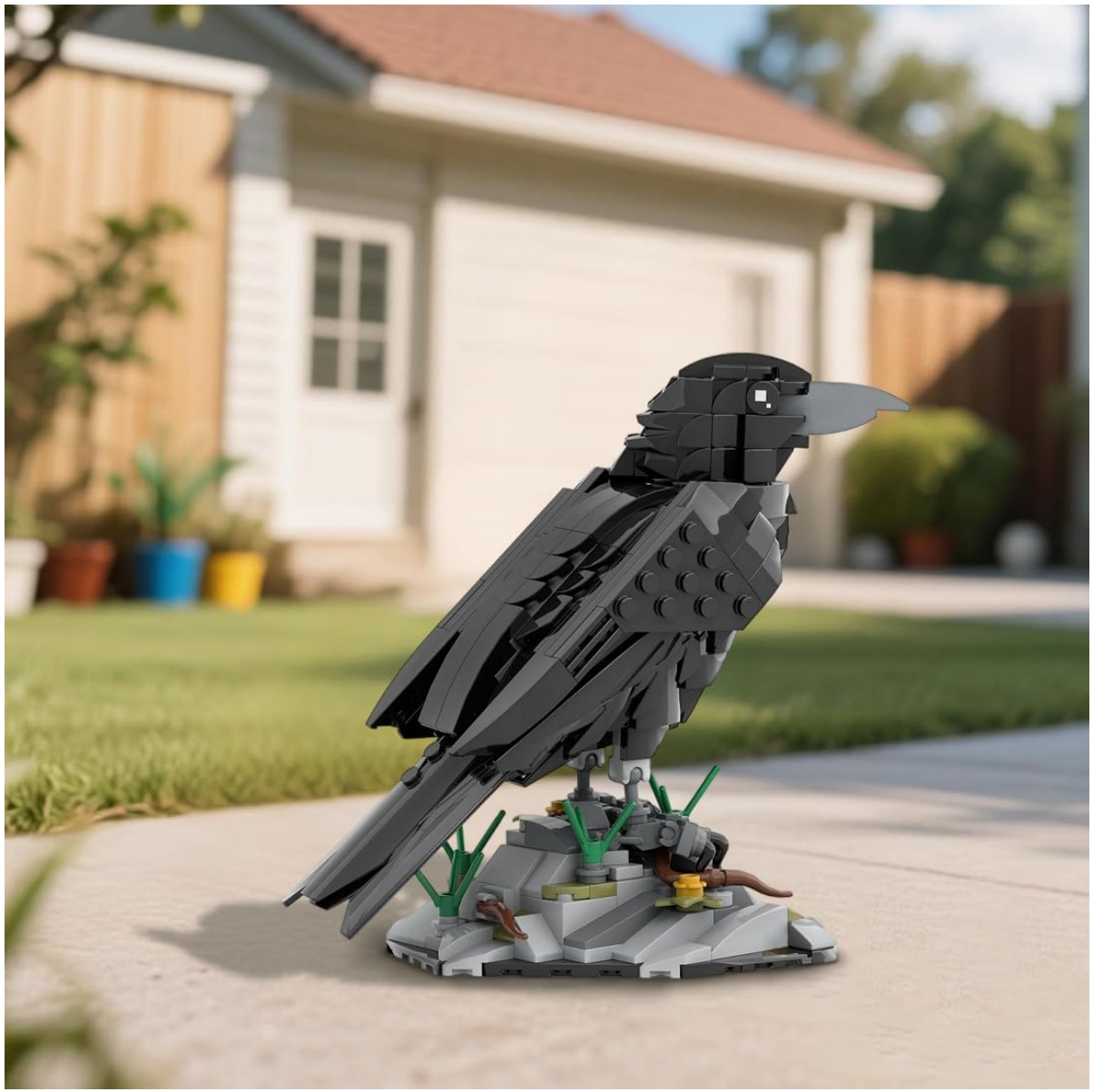
Image 2: The fully assembled Raven Bird model displayed outdoors on a patio. This view highlights the model's realistic appearance and its rocky base.